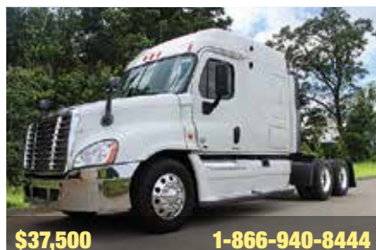
2012 Freightliner Cascadia 125, 70" Mid Roof Sleeper, Detroit DD 15 Engine, 475 HP, 10 Spd OD, 22.5 LP Tires, Qualifies for Freightliner Used Truck Warranty w/ ATS Coverage, 585,916 Miles. (CSFB4930-TXK-2)