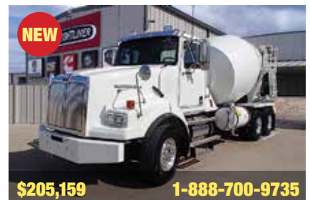
2018 Western Star 4900 Day Cab Glider, 1998 EPA Detroit Series 60 12.7L Engine, 425 HP, 4.88 Ratio, 4500RDS Allison Automatic Transmission, 11R22.5 Tires, All Aluminum Wheels, Warranty, Pre--Emission Glider. New (JPJR8371-WAC-2-b)