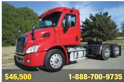
2015 Freightliner Cascadia 113, Day Cab, Detroit DD13 Engine, 450 HP, 10 Spd OD, 3.42 Ratio. 174" WB, 22.5 LP Tires, Aluminum Outer Wheels, 655,805 Miles. (FLGE0096-WFF-3)