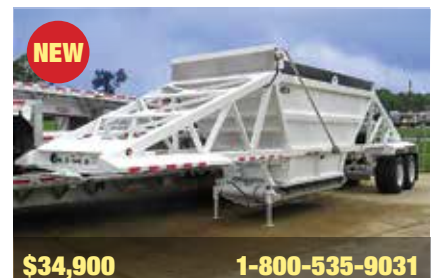
NEW $34,900 1-800-535-9031 2018 CPS Lightweight Bottom Dump, 12,800 LBS, 20 Cubic Yard Capacity, 40' x 96", Air Ride Suspension, 11R24.5 Tires, Electric Flip Tarp, Steel Wheels. New . (J3178752-FAR-3b)