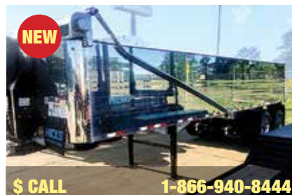
NEW $ CALL 1-866-940-8444 2018 Hicks 28' x 102" Aluminum End Dump Trailer. Frameless With Lift Axle, Aero Electric Mesh Tarp, and UHMW Liner. Air Ride Susp, All Aluminum Wheels and 11R24.5 Tires. New (JM686027-TXK-3-b)