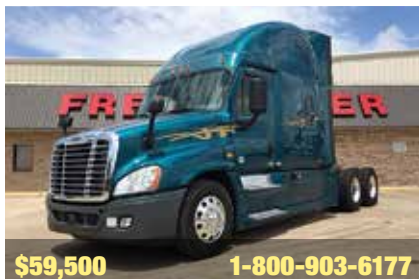
2015 Freightliner Cascadia 125 Evolution, 72" Raised Roof Sleeper, Detroit DD15 Engine, 455 HP, 10 Spd OD, 3.36 Ratio, 230" WB, 22.5 LP Tires, 8 New Virgin Drive Tires, All Aluminum Wheels, APU, Some Warranty, 476,394 Miles. (FSFN2633-TEM-2)