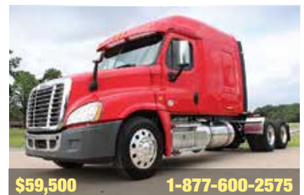
2014 Freightliner Cascadia 125, 72" Mid Roof, Detroit DD13 Engine, 450 HP, 10 Spd OD, 3.42 Ratio, 245" WB, 24.5 Tires, All Aluminum Wheels, Qualifies for Freightliner Used Truck Warranty w/ATS Coverage, 375,077 Miles. (ESFU1895-TYL-2)