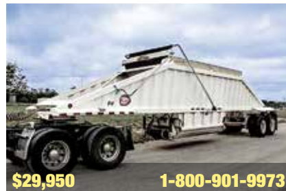
$29,950 1-800-901-9973 2013 CTS Pack Mule Dump Trailer, 40' x 96", Air Ride Suspension, 11R24.5 Tires, 8 New Tires, Steel Wheels. (DS000573-SAN-3)