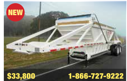
NEW $33,800 1-866-727-9222 2018 Dura Haul Belly Dump, 40' x 102", 11R24.5 Tires; Fixed Tandem Axle; Steel Composition; Fixed Type of Neck; Air Ride Suspension. (J1038317-BRY-3)