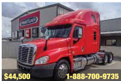
2014 Freightliner Cascadia 125, 72" Raised Roof Sleeper, DD15 Detroit Engine, 455 HP; Engine Brake; 2.47 Ratio; LP 22.5 Tires; 230 in WB, APU, Qualifies for Freightliner Used Truck Warranty with ATS Coverage, 539,629 Miles. (ESFR8121-WAC-2)