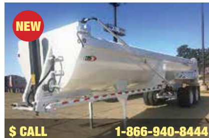
NEW $ CALL 1-866-940-8444 2018 CPS 32' White Half Round End Dump, 32' x 96" Spring Ride Suspension, Electric Flip Tarp, Steel Wheels and 11R24.5 Tires. New (J3172689-TXK-3)