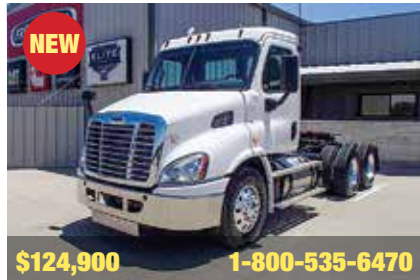
2017 Freightliner Cascadia 113 Day Cab, Detroit DD15 Engine, 450 HP, 10 Spd OD, 3.70 Ratio, 185" Wheelbase, 22.5 LP Tires, All Aluminum Wheels. New. (HLJC9426-ABQ-2)