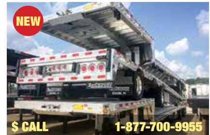
NEW $ CALL 1-877-700-9955 2018 Reitnauer 53' Big Bubba Drop Deck Trailer w/Tire Inflation System, (8) Aluminum Wheels, 17.5 tires, (2) Storage Boxes, (14) Retainers, and (14) Winches, Electric Dump Valve Rear Axle w/Wire Run to AUX 7-Way Plug at Front of Trailer. New . (JR044108-SHV-3)