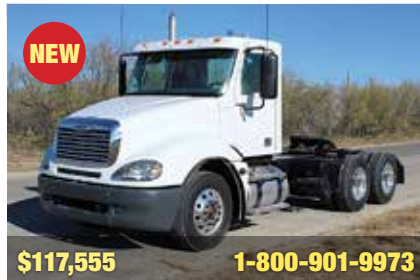
2018 Freightliner Columbia 120 Glider, Day Cab, Series 60 Detroit Engine, Pre Emission , 470 Horsepower;10 Spd OD; Engine Brake; 3.42 Ratio; 22.5 LP Tires; 190" Wheelbase.All Aluminium Wheels, New Glider. (JDJU5743-SAN-2)