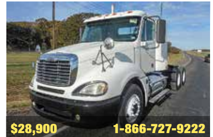
2009 Freightliner Columbia 112, Detroit Series 60 14L Engine, 10 Spd OD 455 Horsepower; Engine Brake; 3.58 Ratio; 22.5LP Tires; 191 in Wheelbase, 687,598 Miles. (9DAE0378-BRY-2)