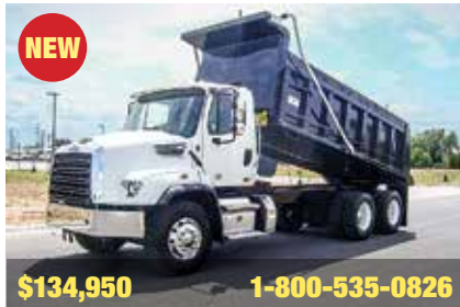
2016 Freightliner 114SD, New Ox 16-18 Yard Dump Body, Electric Tarp, Full Lockers, Detroit DD13 Engine, 450 HP, 4500RDS Allison Automatic Trans, 4.30 Ratio, 220" WB, 11R24.5 Tires. New. (GHHB7456-ABL-2)