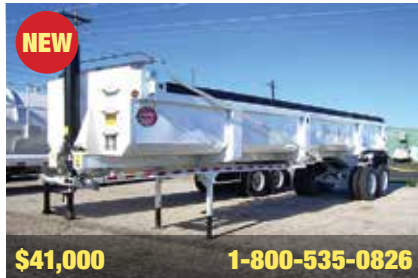
NEW $41,000 1-800-535-0826 2018 CTS Sandmaster Ultralight End Dump, 37' x 96", Flat Floor; 11R 24.5 Tires; Spring Suspension, Steel Composition; Electric Tarp. New (JS000102-ABL-3)