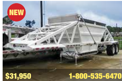
NEW $31,950 1-800-535-6470 2018 CPS Light Weight Bottom Dump, 13,300 Lbs., 40' X 96", 22 Cubic Yard Capacity, 11R24.5 Tires; Spring Suspension, Electric Mesh Flip Tarp, Steel Wheels. New . (H3015159-ABQ-3)