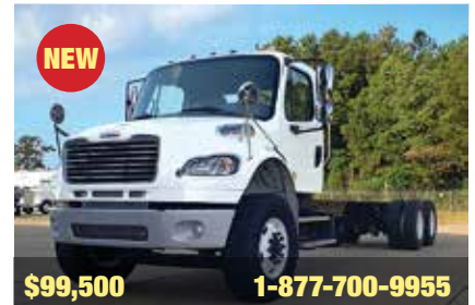
2018 Freightliner M2 106 Day Cab, Cummins ISL Engine, 350 HP, Allison Automatic Transmission, 5.29 Ratio, 276" Wheelbase, 11R22.5 Tires. New. (JHJW3041-SHV-2)