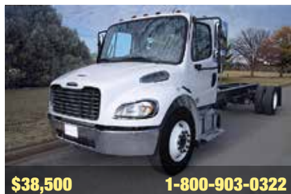
2015 Freightliner M2 106 Business Class, Cummins ISB Engine, 240 HP, Allison RDS Transmission, 5.13 Ratio, 252" WB, 11R22.5 Tires, 26,000 GVW, 117,750 Miles. (FHGL1949-WFF-2)