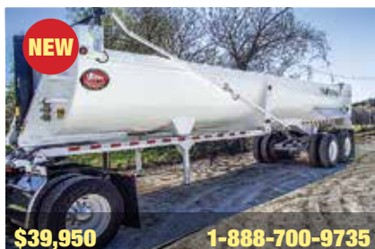
NEW $39,950 1-888-700-9735 2018 CTS Rockmaster HRD AR 450 End Dump, 32' x 102", Spring Suspension, 11R24.5 Tires, Electric Tarp. New . (JS000099-WAC-3)