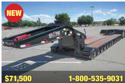
NEW $71,500 1-800-535-9031 2017 Globe Lowboy 53' x 102", 26' Well, 1 1HP Honda, 16" King Pin Setting, 98" Swing Clearance, 50" 5th Wheel Height, Tri-Axle, 22.5 LP Tires. 10 Year Warranty. Price Includes FET. New . (JB336970-FAR-3)