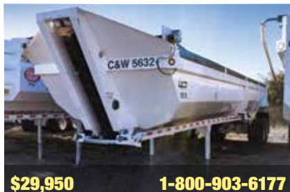
$29,950 1-800-903-6177 2015 CPS End Dump, 39' x 102", Spring Suspension, 11R24.5 Tires, New Tarp, Good Rubber, Clean Late Model Dump Trailer. (F3148632-TEM-3)