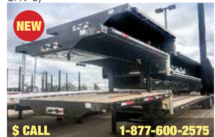
NEW $ CALL 1-877-600-2575 2018 Transcraft 48' x 102" Steel Drop Deck Trailer, Air Ride Susp, Spread Axle Set at Rear Most Position. 11' Upper Deck, Steel Wheels, 22.5 LP Tires, Mud Flaps Behind All Axles, Winch Track on C/S with 14 Winches Total. 12,437 Lbs. New (J3092830-TYL-3)