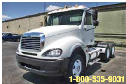
2006 Freightliner Conventional Day Cab, Detroit Diesel Engine, 455 HP, Engine Brake, 13 Spd Manual Transmission, Air Ride Suspension 3.73 Ratio, 169" Wheelbase, Locking Differentials, 642,696 Miles. (6LW30930-FAR-3)