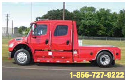
2011 Freightliner M2 Sports Chassis, Crew Cab Hauler, Cummins ISB Engine, 350 HP, Allison Automatic 6 Spd. 4.62 Ratio, 188" Wheelbase, 22.5 LP Tires, All Aluminum Wheels, 62,941 Miles. (BDAX0081-BRY-2)