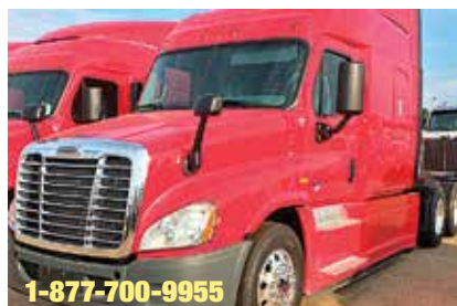
2016 Freightliner Cascadia 125, 72" Mid Roof Sleeper, 3.08 Ratio, Mid Roof Sleeper, Detroit Diesel Engine, 455 HP, Air Ride Suspension, Warranty. New . (GLGZ8818-SHV-2)