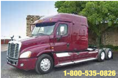
2010 Freightliner 125 Cascadia, 72 in Mid Roof XT Sleeper; DD15 Detroit Engine 475 hp; Diesel; Ultrashift; Engine Brake; Air Ride Suspension; 2.64 Ratio; 22.5 LP Tires; Aluminum/Steel Wheels; 230 in Wheelbase; 684,000 Miles. (ASAK8770-ABL-2)