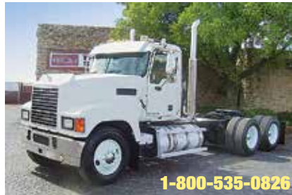
2013 Mack CHN613, MP8 Mack Engine 415 hp; Diesel; 10 Spd OD; Engine Brake; Air Ride Suspension; 3.79 Ratio; 11R 24.5 Tires; Aluminum/Steel Wheels; 220 in Wheelbase, 149,000 Miles. (CM008080-ABL-3)