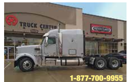
2015 Freightliner Coronado, DD15 Engine, Engine Brake, 70" Mid Roof Sleeper, 10 Spd, 3.36 Ratio, 262" Wheelbase, 24.5 Tires, All Aluminum Wheels, Warranty. New . (FDGR8234-SHV-3)

See a complete inventory of new and used trucks and trailers online at www.LonestarTruckGroup.com