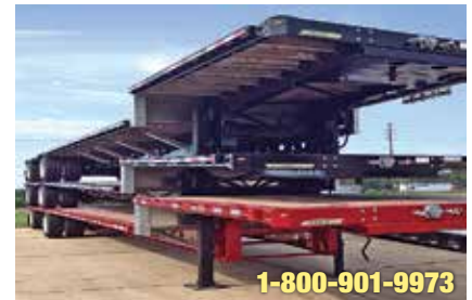
2015 Manac Single Drop Deck Trailer, 48' Length x 102" Wide, Air Ride Suspension, Airtong Floor, 22.5 Tires, Steel Wheels, Spread Axle. New . (5148853-SAN-TRL-2)