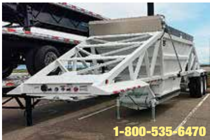
2016 Manac Bottom Dump Trailer, CPS Lightweight, 40' x 96", 24.5 Tires, Steel Wheels, Cramaro Tarp. Electric Flip Style, Black Mesh. New . (G3158999-ABQ-TRL-3)