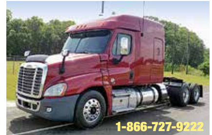
2012 Freightliner CA125 Cascadia, Mid Roof Sleeper; DD15 Detroit Engine 455 hp; Diesel; 10 Spd; Air Ride Suspension; 3.42 Ratio; 22.5 LP Tires; Aluminum Wheels; 245 in Wheelbase; 435,500 Miles. (CSBK4079-BRY-3)