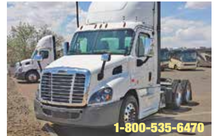
2016 Freightliner CA113DC Cascadia, 6 Cylinder Detroit Engine 450 hp; Diesel; 10 Spd; Engine Brake; Air Ride Suspension; 2.53 Ratio; 22.5 LP Tires; All Aluminum Wheels; 175 in Wheelbase, Warranty. New (GDGX2136-ABQ-2)