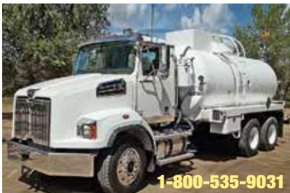
2015 Western Star 4700SB Vacuum Truck, Masport 400 Pump, Pintle Hitch, DD13 Detroit 470 hp; Diesel; Automatic OD; Engine Brake; TufTrac Suspension; 4.56 Ratio; Aluminum/Steel Wheels; 227 inch WB. New . (FLGX3135-FAR-2)