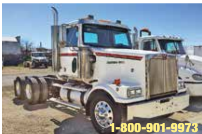
2006 Western Star 4900FA, Day Cab, Detroit Series 60 12.7 Engine, Fresh Eng. Overhaul & New Clutch, 455 HP, 10C OD Manual Transmission, 3.73 Ratio, 205" WB, 3.73 Ratio, 22.5 Tires, All Aluminum Wheels, 636,301 Miles. (6PW63718-SAN-3)