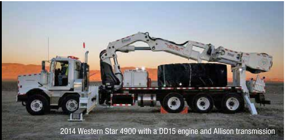
2014 Western Star 4900 with a DD15 engine and Allison transmission