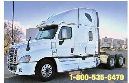
2011 Freightliner Cascadia, 70 in Condo Sleeper; Cummins Engine 500 hp; Diesel; 10 Spd OD; Engine Brake; Air Ride; 3.21 Ratio; 22.5 Tire, 8 Brand New Drive Tires, Aluminum/Steel Wheels; 235 in Wheelbase, 875,000 Miles. (BSAW2419-ABQ-2)