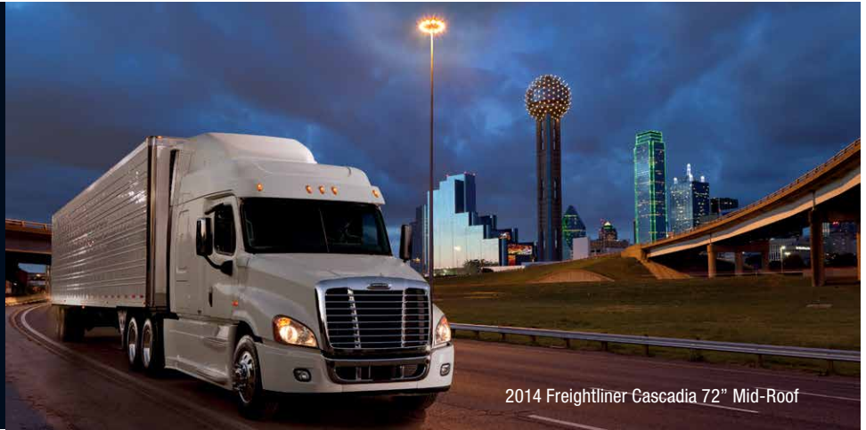
2014 Freightliner Cascadia 72" Mid-Road