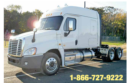
2014 Freightliner Cascadia, Mid Roof Sleeper; DD15 Detroit Engine 505 hp; Diesel; 132,500 mi; 10 Spd; Air Ride Suspension; 3.36 Ratio; 22.5 LP Tires; Aluminum Wheels; 235 in Wheelbase. New. (ESFX6892-BRY-3)