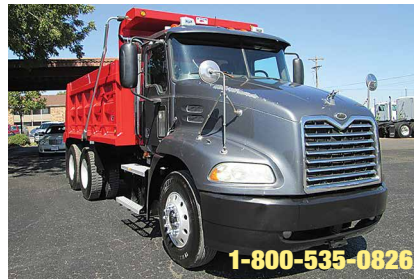
2005 Mack Vision CX613 Dump Truck, Mack Engine; 355/380 HP Diesel; 9 Spd OD; Engine Brake; Air Ride Suspension; 3.90 Ratio; 11R22.5 Tires; All Aluminum Wheels; Standard Cab; 706,000 Miles. (6N011265-ABL-3)