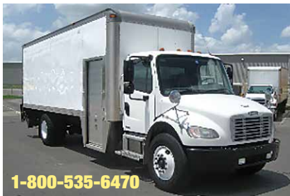
2007 Freightliner M2 112, Allison Automatic Transmission, Spring Suspension, Box is 12' With Lift Gate & Side Door, 22.5 Tires, Steel Wheels, 148,000 Miles. (7HY79276-ABQ-3)