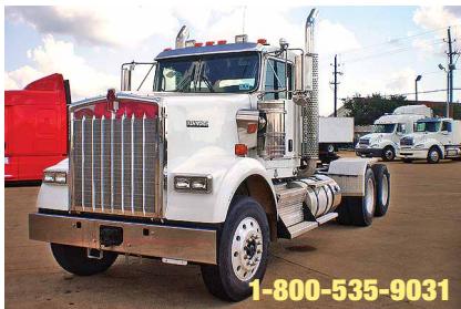
2012 Kenworth W900, PX13 Engine, 18 Spd., 3.91 Ratio, 230" Wheelbase, All Aluminum Wheels, 24.5 Tires, 120,786 Miles. (CJ294830-FAR-2)