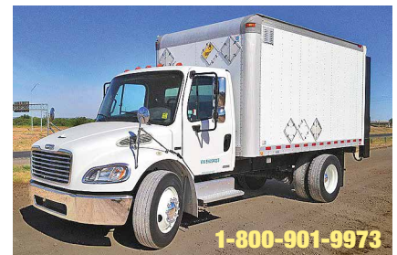
2006 Freightliner Medium Duty M2 106, Standard Cab; MBE900 Mercedes Engine 210 hp; Diesel; 6 Spd; Spring Suspension; Lift End Gate; Roll up Door; 4.56 Ratio; 22.5 Tires; All Steel Wheels; 178" Wheelbase; Single Axle, 98,000 Miles. (6HV94008-SAN-2)