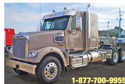
2014 Freightliner Coronado SD, Pearl Fawn Metallic, 48" Mid Roof Sleeper, Detroit DD15, 505 HP, 10 Speed, 3.90 Ratio, 230" Wheelbase, 24.5 Tires, All Aluminum Wheels. New. (EDFU1917-SHV-2)