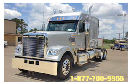
2014 Freightliner Coronado, Silver Metallic, Detroit DD15, 475 HP, Engine Brake, 10 SPD, 3.42 Ratio, 262" Wheelbase, 24.5 LP Tires, Aluminum Front Wheels, Outer Aluminum Rear Wheels. New. (EDFP0073-SHV-3)

See a complete inventory of new and used trucks and trailers online at www.LonestarTruckGroup.com