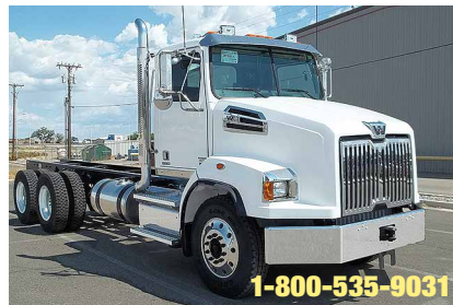
2014 Western Star 4700, Detroit DD13, Engine Brake, Allison Automatic 6 Spd, 4.30 Ratio, 227" Wheelbase, 24.5 Tires, Aluminum Front Wheels, Steel Rear Wheels. New. (EPFU3770-FAR-3)