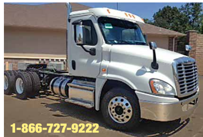
2013 Cascadia , DD13 Detroit Engine 450 hp; Diesel; 10 Spd; Air Ride Suspension; 3.70 Ratio; 22.5 LP Tires; Aluminum/Steel Wheels; 210 in Wheelbase. New. (DSBZ6073-BRY-2)