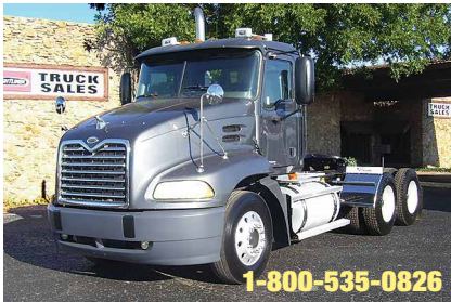
2005 Mack Vision CX613, Mack Engine; Diesel; 355/380 HP, 9 Spd OD; Engine Brake; Air Ride Suspension; 3.90 Ratio; 11R22.5 Tires; All Aluminum Wheels; 626,000 Miles. (5N001729-ABL-2)