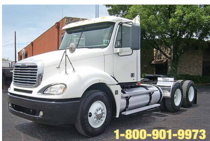
2007 Freightliner Columbia, Series 30 Detroit, 10 Sp. OD, 3.70 Ratio, 183" Wheelbase, 22.5 Tires, Steel Wheels, 566,000 Miles. (7PX77569-SAN-3)