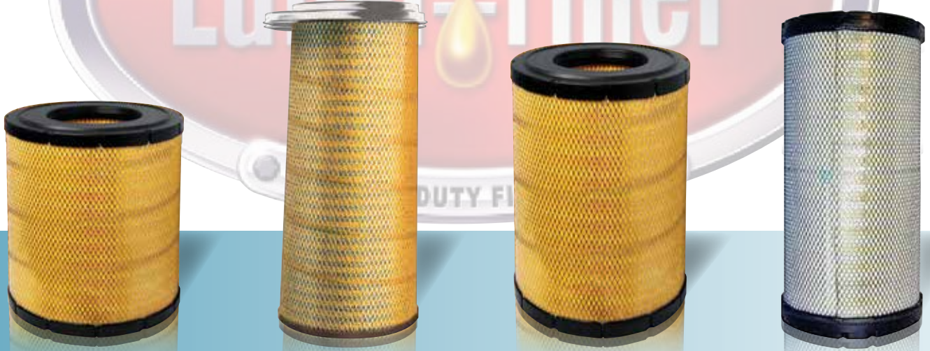
Parts pictures are for reference only. Actual parts may vary. Prices good through December 31, 2013

LBF-LAF4816 Luber-finer Air Filter $44.95 ea.