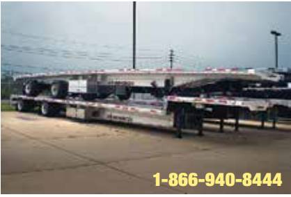
2014 Transcraft Flat Bed, 53' x 102", Air Ride Suspension, 24.5 Tires, Aluminum Wheels, One Aluminum box, Sliding Winches. (E3819159-SHV-TRL-1a)