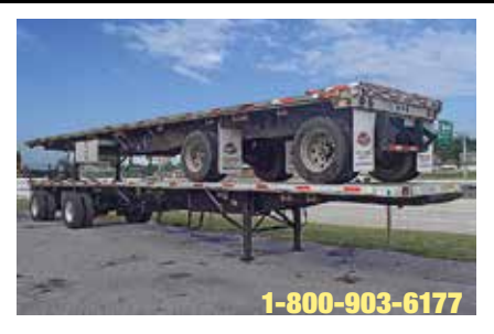
2007 Utility Combo Flat Bed, (Qty: 7) Air Ride; LP 24.5 Tires; Fixed Spread Tandem Axle; Combination Composition; 48' X 102' Utility Combo Spread Axle, Air Ride, Rear Flip, All Aluminum Wheels, LP 22.5 Virgin Tires, Boxes! (7A018736-TEM-TRL-3)