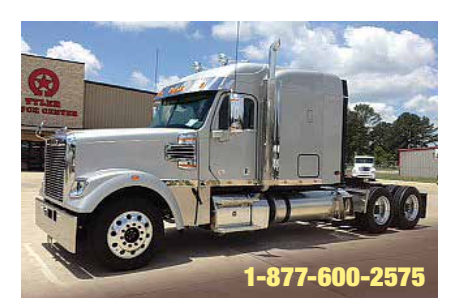
2014 Freightliner CC132 Coronado, Detroit DD15, 10 Spd, Air Ride Suspension, 3.42 Ratio, 262" Wheelbase, 24.5 LP Tires, Aluminum Front Wheels, Aluminum Outer Wheels. New. (EDFP0077-TYL-3)