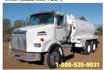
2012 Western Star 4900 Vacuum Tank Truck, (Qty: 2) DD13 Detroit 450 hp; Diesel; 8LL; Eng. Brake; TufTrac Susp; 4.30 Ratio; Aluminum/Steel Wheels; 227 in WB; Tandem Axle; 24.5 Tires; 46,000 lb Rear Axle Weight; 14,600 lb Front Axle. New. (CPBM8294-FAR-1)