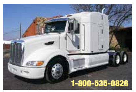
2009 Peterbilt 386, 63 in Mid Roof Sleeper; C13 Caterpillar Engine 470 hp; Diesel; 13 Spd OD; Engine Brake; Air Ride Suspension; 22.5 LP Tires; Aluminum Outside Wheels; 579,343 Miles. (9D789113-ABL-3)