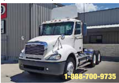
2007 Freightliner Columbia, 14.0 Detroit Engine 455 hp; Diesel; 10 Spd OD; Engine Brake; Air Ride Suspension; 3.70 Ratio; 11R 22.5 Tires; All Steel Wheels; 171 in Wheelbase, 578,000 Miles. (7LX77328-WAC-3)