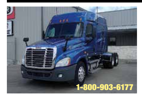
2009 Freightliner Cascadia, Detroit DD15, 10 Spd, 230" Wheelbase, All Aluminum Wheels, 635,000 Miles. (9LAF0616-TEM-2)