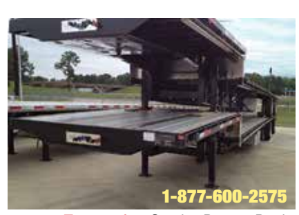
2014 Transcraft Steel Drop Deck, Aluminum Floor, 53' x 102", Air Ride Suspension, 22.5 Tires, Aluminum Outer Wheels. (E3765250-TYL-TRL-2b)