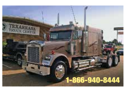
2007 Freightliner Classic, 70" Mid Roof Sleeper, Caterpillar C15 Engine, 475 HP, 10 Speed, Engine Brake 3.58 Ratio, 245" Wheelbase, 24.5 LP Tires, Aluminum Front Wheels, Steel Rear Wheels, 777,934 Miles. (7DX55382-TXK-1)