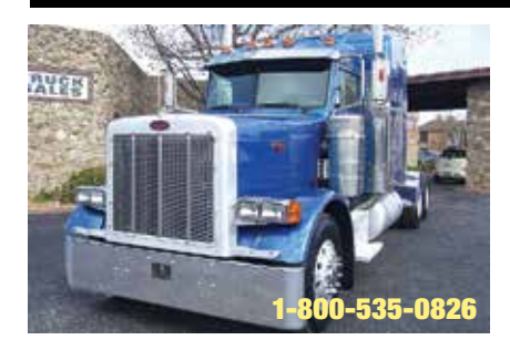
2006 Peterbilt 379, 63 in Mid Roof Sleeper; C15 Caterpillar Engine 475 hp; Diesel; 10 Spd OD; Engine Brake; Air Ride; 3.58 Ratio; 22.5 Tires; Aluminum Outside Wheels; 250 in Wheelbase; 800,000 Miles. (6N889998-ABL-2)