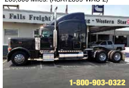
2006 Peterbilt 379, Caterpillar C15, 475 HP, 13 Spd,63" Sleeper, Engine Brake, Air Ride Suspension, Ready to Work, 762,884 Miles. (6N894662-WFF-3)