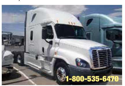
2014 Freightliner Cascadia, 70 in Condo Sleeper; DD15 Detroit Engine 455 hp; Diesel; 1,500 mi; 10 Spd OD; Engine Brake; Air Ride Suspension; 2.62 Ratio; 22.5 Tires; All Aluminum Wheels; 226 in Wheelbase. New. (ESFL5232-ABQ-3)