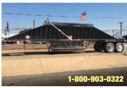
2013 CTS Belly Dump, Spring Suspension; 40 ft Length; Frame; Fixed Tandem Axle. New (DS001277-WFF-TRL-1)