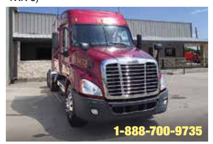
2010 Freightliner Cascadia, 72 in Mid Roof XT Sleeper; DD 15 Detroit Engine 455 hp; Diesel; 10 Spd OD; Engine Brake; Air Ride Suspension; 3.42 Ratio; LP 22.5 Tires; All Aluminum Wheels; 230 in Wheelbase; 269,000 Miles. (ASAT2899-WAC-2)