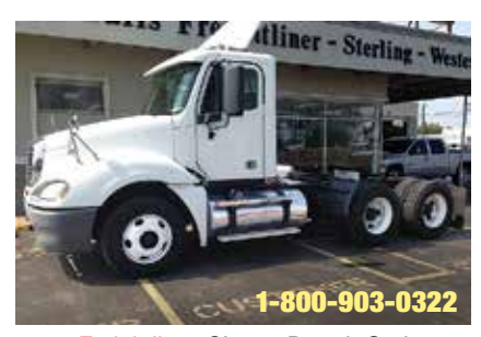
2007 Freightliner CL120, Detroit Series 60 14L, 455 HP, 10 Spd, Air Ride Suspension, 3 Axles, 3.73 Ratio, 169" Wheelbase, 22.5 LP Tires, Steel Wheels, Good Work Truck, 620,000 Miles. (7LY27987-WFF-2)