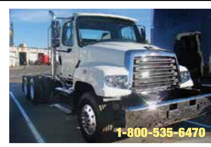
2013 Freightliner 114SD, Standard Cab; DD13 Detroit Engine 450 hp; Diesel; 13 Spd OD; Engine Brake; TufTrac Suspension; 3.90 Ratio; 22.5 Tires; Aluminum/Steel Wheels; 216 in Wheelbase. New. (DDBW8035-ABQ-2)