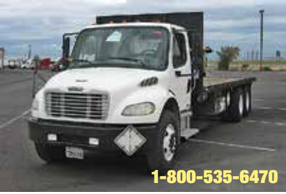
2006 Freightliner M2, Standard Cab; C7 CAT, 250 hp; 9 Spd OD; Air Ride; 24 ft Long x 102 in Wide; 4.11 Ratio; 11R22.5 Tires; Steel Wheels; 270 in WB, 24' flat bed w/ stake pockets & mounts for fork lift on back, incl 6 mo 25,000 eng. warranty, 225,250 Miles. (6HW13897-ABQ-1)