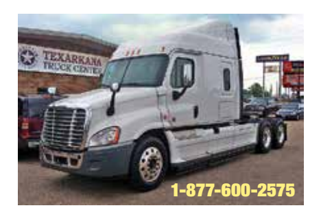
2014 Freightliner Cascadia, Detroit DD13 Engine, 72" Mid Roof Sleeper 10 Spd Ultrashift Plus Transmission, 3.36 Ratio, 245" Wheelbase, 24.5 LP Tires, All Aluminum Wheels. New. (ESFK1311-TYL-1)