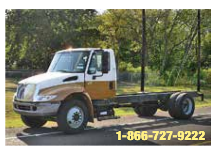
2003 International 4200, VT365 International Engine 215 hp; Diesel; Spring Suspension; 22.5 LP Tires; All Steel Wheels; 10,000 lb Front Axle Weight; 22,000 lb Rear Axle Weight; Gross Vehicle Weight (lbs): 32000, 123,650 Miles. (3H571967-BRY-2)