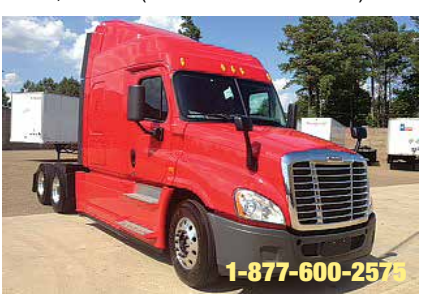
2014 Freightliner Evolution, 72" Mid Roof Sleeper, Detroit DD15 Engine, 475 HP, 10 Spd, 3.42 Ratio, 238" Wheelbase, 22.5 LP Tires, Aluminum Front Wheels, Aluminum Outer Wheels, Warranty. New. (ESFT1245-TYL-2)