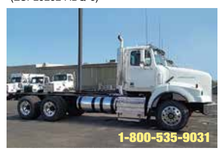
2012 Western Star 4900SA, (Qty: 2) Standard Cab; ISX Cummins 485 hp; Diesel; 18 Spd; Eng. Brake; TufTrac Susp; 4.30 Ratio; 24.5 Tires; Alum. Wheels; 227" WB; 14,600 lb Front Axle; 46,000 lb Rear Axle. New. (DPBW7372-FAR-2)