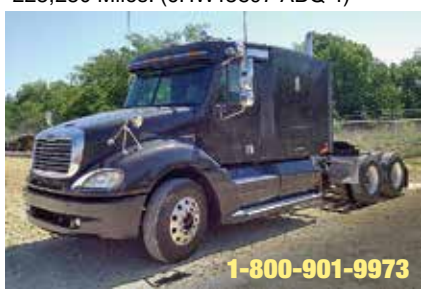
2006 Freightliner Columbia 120, 58 in Mid Roof Sleeper; S60 14L Detroit Engine 455 hp; Diesel; 10 Spd OD; Engine Brake; Air Ride Suspension; 3.90 Ratio; 22.5 Tires; All Aluminum Wheels; 228 in Wheelbase; 607,755 Miles. (6LW31881-SAN-1)