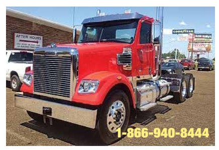
2014 Freightliner CC122 Coronado SD, DD13 Detroit Engine, 10 Spd, Air Ride Suspension, 3.90 Ratio, 220" Wheelbase, 24.5 Tires, All Aluminum Wheels. New. (EDFR4158-TXK-2)