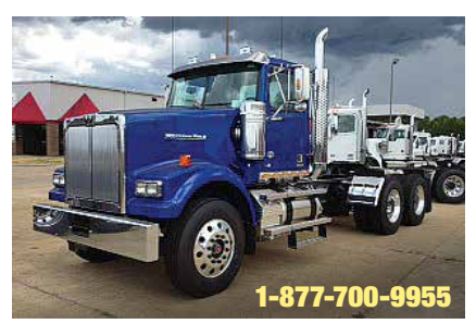
2014 Western Star 4900, Detroit DD15, 505 HP, 10 Spd, 3.90 Ratio, 220" Wheelbase, 24.5 Tires, All Aluminum Wheels, Warranty. New. (EDFR2059-SHV-1)