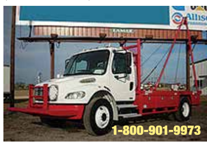
2006 Freightliner M2106, C7 Engine, 6 Spd Transmission, 26,000 GVWR, 3.9 Ratio, 252" Wheelbase, 22.5 Tires, Steel Wheels, Unit Qualifies for Warranty, Ask for Details, 142,136 Miles. (6HW19374-SAN-2)