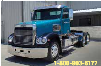
2006 Freightliner Coronado, 14.0 Detroit Engine 515 hp; Diesel; 10 Spd OD; Engine Brake; Air Ride Suspension; 3.73 Ratio; 11R 22.5 Tires; All Aluminum Wheels; 217 in Wheelbase; 510,000 Miles. (6PW82829-TEM-1)