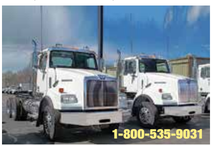
2012 Western Star 4900SB, 18 Spd, Tuff Trac Suspension, 4.30 Ratio, 227' Wheelbase, 24.5 Tires, All Aluminum Wheels. New. (CPBW7374-FAR-3)