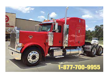
2007 Peterbilt 379, 63 in Ultracab Unibilt; C15 Caterpillar Engine 475 hp; Diesel; 18 Spd OD; Engine Brake; Air Ride Suspension; 24.5LP Tires; All Aluminum Wheels; 270 in Wheelbase; 691,603 Miles. (7D674559-SHV-3)