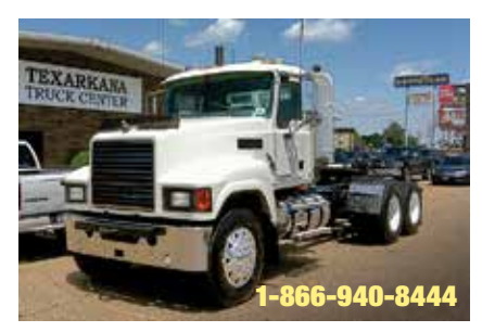
2009 Mack CH600, MP8 Mack Engine 445 hp; Diesel; 10 Spd OD; Engine Brake; Camelback Suspension; 3.94 Ratio; 24.5 Tires; Aluminum/Steel Wheels; 218 in Wheelbase, 269,678 Miles. (9N004309-TXK-3)