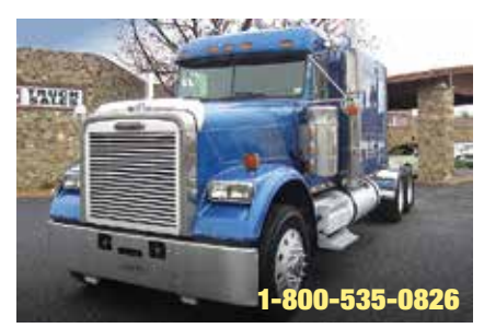
2008 Freightliner FLD12064, 70" Mid Roof Sleeper; 14.0 L Detroit Engine 515 hp; Diesel; 10 Spd OD; Engine Brake; Air Ride; 3.58 Ratio; 24.5 LP Tires; Aluminum Outside Wheels; 250" Wheelbase; 6 Month 50K NTP Engine Warranty. 612,000 Miles. (8DZ84369-ABL-1)