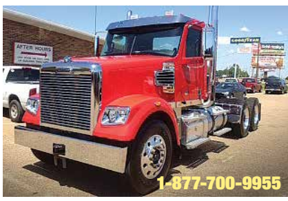
2014 Freightliner Coronado SD, Detroit DD15, 505 HP, 10 Spd, 3.90 Ratio, 220" Wheelbase, 24.5 Tires, All Aluminum Wheels, Warranty. New. (EDFR4169-SHV-2)