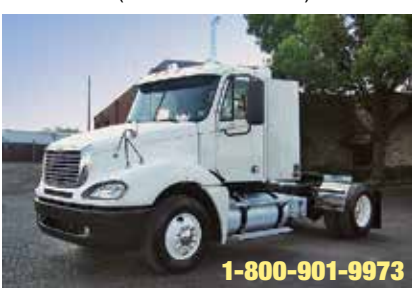
2007 Freightliner Conventional, Detroit Series 14L, 10 Speed Transmission 3.58 Ratio, 172" Wheelbase, 22.5 Tires, Steel Wheels, 709,325 Miles. (7LX75999-SAN-3)