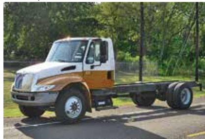
2004 International 4200, VT365 International Engine; Diesel Fuel Type; Automatic; Spring Suspension; 22.5 LP Tires; All Steel Wheels; Single Axle, 152,850 Miles. (4H662569-SAN-1) $19,500 $8,500