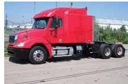
2007 Freightliner Columbia 120, 70 in Mid Roof XT Sleeper; Detroit 455 hp; 10 Spd OD; Engine Brake; Air Ride; 3.58 Ratio; 22.5LP Tires; Aluminum Outside Wheels; 230 in WB; Tandem Axle; 707,000 Miles. (7LW52341-WFF-2)