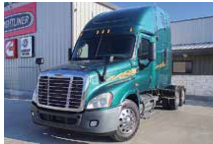
2009 Freightliner Cascadia, 72 in Raised Roof Condo; DD 15 Detroit Engine 500 hp; Diesel; 10 Spd OD; Engine Brake; Air Ride Suspension; 3.42 Ratio; LP 22.5 Tires; Aluminum Wheels; 230 in Wheelbase; 494,000 Miles. (9LAK8581-TEM-3)