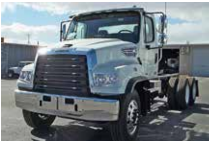
2012 Freightliner 114SD, Standard Cab; DD13 Detroit Engine 450 hp; Diesel; 8LL; Engine Brake; TufTrac Suspension; 4.30 Ratio; 24.5 Tires; Aluminum/Steel Wheels; 227 in Wheelbase. (CHBT4798-FAR-1) $117,590 New.