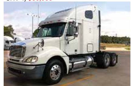
2004 Freightliner Columbia 120, 70 in Condo Sleeper; S60 Detroit 475 hp; Diesel; 10 Spd OD; Engine Brake; Air Ride; 22.5 LP Tires; Aluminum Wheels; 234 in WB; Has Thermo-King APU, Engine Warranty Included, 936,000 Miles. (4LN32801-TYL-1) $19,880 $19,500