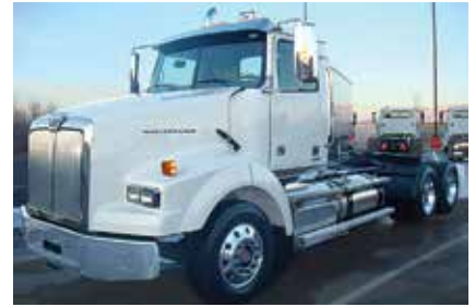
2012 Western Star 4900SA, ISX Cummins Engine 500 hp; 10 mi; Diesel; 13 Spd OD; Engine Brake; Air Ride Suspension; 3.58 Ratio; 22.5 Tires; All Aluminum Wheels; 215 in Wheelbase. (CPBW7384-ABQ-2) $118,900 $114,900 New.