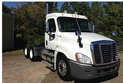
2010 Freightliner Cascadia, DD15 Detroit Engine 475 hp; Diesel; 10 Spd OD; Engine Brake; Air Ride; 3.42 Ratio; 22.5 LP Tires; Aluminum/Steel Wheels; 205 in Wheelbase; 366,591 Miles. (ASAV6420-TXK-1) $67,880