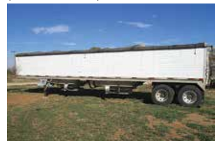
1991 Wilson Grain Hopper, Spring Suspension; 42 ft Length x 96 in Width; Aluminum Floor; 24.5 Tires; Aluminum Wheels; Fixed Tandem Axle; Stainless Steel Composition; 42x96 Wilson Grain trailer. 66" sides, and vibrators. (MA215391-TEX-TRL-3c) $19,500 $17,500.