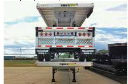
2013 Reitnauer Flat Bed, (Qty: 6) Air Ride Suspension; 48 ft Length x 102 in Width; Aluminum Floor; 24.5 Tires; Aluminum Composition; 48x102 MaxMizer, sliding winches, cargo tie downs, aluminum wheels, and aluminum tool box. (DR028067-TYL-TRL-1A) $39,006.69 includes FET