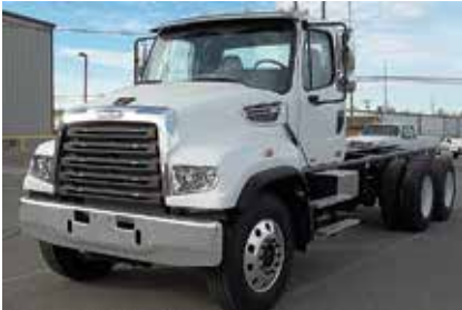
2013 Freightliner 114SD, DD13 Detroit 450 hp; Diesel; 6 Spd; Eng. Brake; TufTrac Susp; 4.56 Ratio; 24.5 Tires; Alum. Wheels; 227" WB; 1/2 inch frame rail 3.2 million RBF Frame, Allison Auto w/ PTO Provision; 6x4. (DDBX9805-FAR-2) New