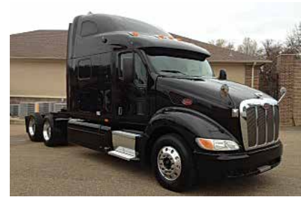
2007 Peterbilt 387, 70 in Unibilt; C15 Caterpillar Engine 435 hp; Diesel; 13 Spd OD; Engine Brake; Air Ride; 22.5 Tires; All Aluminum Wheels; 230 in Wheelbase; 694,971 Miles. (7D664649-TXK-2) $42,900