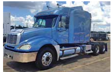
2005 Freightliner Columbia 120, 70 in Mid Roof XT Sleeper; 3126 Mercedes Engine 450 hp; Diesel; 12 Spd; Engine Brake; Air Ride; 3.58 Ratio; 22.5 Tires; Aluminum Outside Wheels; 230 in Wheelbase; 804,920 Miles. (5LV32028-SHV-3)

See a complete inventory of new and used trucks and trailers online at: www.LonestarTruckGroup.com