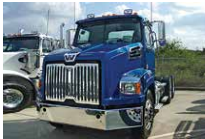
2013 Western Star 4700SB, DD13 Detroit Engine 470 hp; Diesel; 10 Spd OD; Air Ride Suspension; 3.70 Ratio; 24.5 Tires; All Aluminum Wheels; 185 in Wheelbase. (DPFE9368-SHV-2) New.