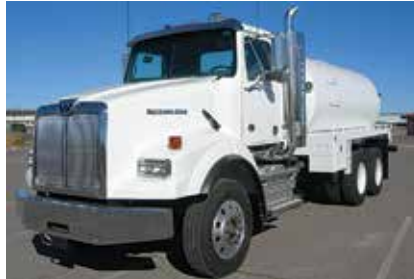
2012 Western Star 4964SA Vacuum Tank Truck, ISX Cummins Engine 485 hp; Diesel; 8LL; Engine Brake; TufTrac Suspension; 4.30 Ratio; Aluminum/Steel Wheels; 227" WB; Tandem Axle; 24.5 Tires. New. (CPBK9610-FAR-3)