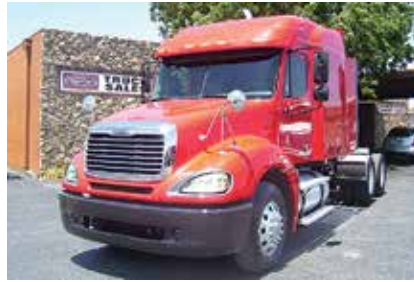
2007 Freightliner Columbia 120, 70 in Mid Roof Sleeper; DDC 14.0 Detroit 455 hp; 10 Spd OD; Engine Brake; Air Ride; 3.58 Ratio; 22.5 LP Tires; Alum. Wheels; 230" WB; Thermo King Tripac APU; 670,000 Miles. (7LW57637-ABL-3) $29,500