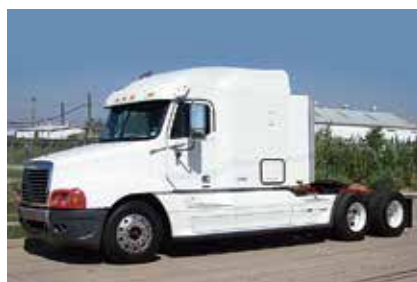
2005 Freightliner Century 120, 70 in Mid Roof XT Sleeper; Detroit Engine 455 hp; Diesel; Ultrashift OD; Engine Brake; Air Ride; 3.73 Ratio; 22.5LP Tires; Aluminum/Steel Wheels; 230 in Wheelbase; 886,000 Miles. (5LN99578-WFF-1) $18,500