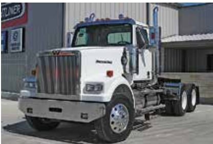
2013 Western Star 4900FA, (Qty: 5) ISX Cummins Engine 450 hp; 10 Spd OD; Engine Brake; Air Ride Suspension; 3.70 Ratio; 11R 24.5 Tires; Aluminum/Steel Wheels; 215 in Wheelbase. (BW8000-WAC-1) $117,900 $114,000 New.