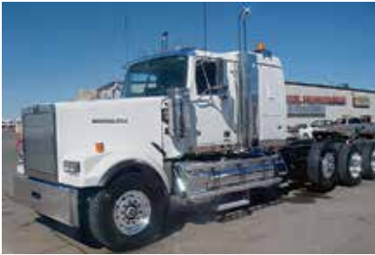
2012 Western Star 4900EX, 48" Flat Top Sleeper; ISX Cummins 600 hp; 1,411 mi; 18 Spd OD; Eng Brake; Air Ride; 4.10 R; 24.5 Tires; Alum. Whls; 298" WB; Tri Axle; 20,000# FrntAxWt; 66,000# RearAxWt. (CPBW7381-ABQ-3) $159,900 $154,900 New.