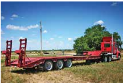
2013 Viking Lowboy , Spring Suspension; 46 ft Length x 102 in Width; Wood Floor; 22.5LP Tires; Steel Composition; Triple axle equipment lowboy. (DN062817-SAN-TRL-3) New.