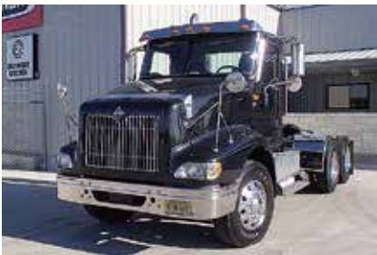
2009 International 9200i, ISM Cummins Engine 410 hp; Diesel; 10 Spd OD; Engine Brake; Air Ride Suspension; 3.70 Ratio; 22.5 Tires; All Aluminum Wheels; 179 in Wheelbase; 525,000 Miles. (9C048701-TEM-1) $46,950