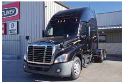
2009 Freightliner Cascadia, 72 in Raised Roof Condo; DD 15 Detroit Engine 500 hp; Diesel; 10 Spd OD; Engine Brake; Air Ride; 3.42 Ratio; LP 22.5 Tires; All Aluminum Wheels; 230 in Wheelbase; 453,000 Miles. (9LAK7185-WAC-3)