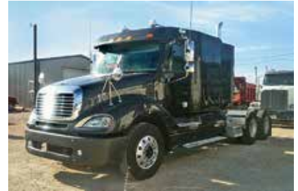
2006 Freightliner Columbia 120, Mid-Roof 70" Sleeper, Detroit Series 60 14L Engine, 10 Spd, Air Ride Suspension, 3.90 Ratio, 228" Wheelbase, 22.5 LP Tires, Aluminum Front Wheels, Aluminum Outer Wheels, 609,000 Miles. (6LW31884-SAN-2)