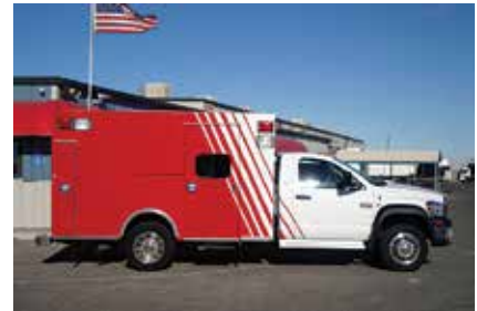
2009 Dodge Ram 4500, Braum Express Model 144, ISB Cummins Engine 300 hp; 6 Spd; 19.5 Tires; All Steel Wheels; 165" WB; 4.44 Ratio; 7,000 lb Front Axle Wt; Drive Side: Left Hand Drive; Gross Vehicle Wt (lbs): 16500, 8,205 Demo-Only Miles. (9G542633-BRY-1) $122,500 $109,950