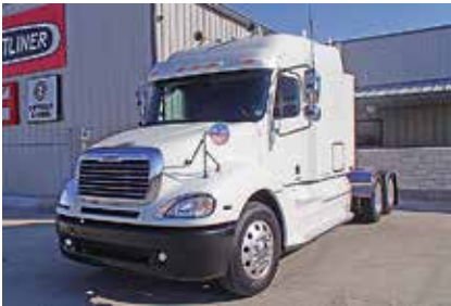
2005 Freightliner Columbia 120, 70 in Mid Roof XT Sleeper; 4000 Mercedes Engine 450 hp; Diesel; 10 Spd OD; Engine Brake; Air Ride; 3.58 Ratio; LP 24.5 Tires; Aluminum Wheels; 238 in Wheelbase; 655,000 Miles. (5LV00149-TEM-2)