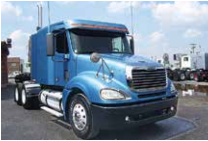
2007 Freightliner Columbia 120, 58 in Mid Roof Sleeper; DDC 14.0 Detroit Engine 455 hp; Diesel; 10 Spd OD; Engine Brake; Air Ride; 3.55 Ratio; 22.5 LP Tires; All Steel Wheels; 219 in Wheelbase, 656,890 Miles. (7LY81476-ABL-2) $32,000 $29,500