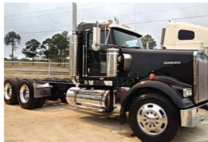
2007 Kenworth W900L, C15 Caterpillar Engine 500 hp; Diesel; 10 Spd OD; Engine Brake; Air Ride; 3.90 Ratio; 24.5 Tires; All Aluminum Wheels; 220 in Wheelbase; 390,000 Miles. (7J208966-TYL-2)