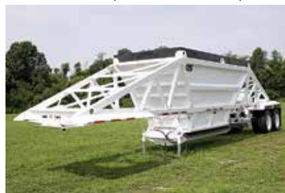
2013 MANAC Light Weight Belly Dump, (Qty: 2) Spring Suspension; 40 ft Length x 102 in Width; Frame; 24.5 Tires; Steel Disc Wheels; Fixed Tandem Axle; Steel Composition; Spring ride, steel wheels, and tarp. (D3139239-TYL-TRL-2b)