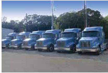
2005 International 9200i, Mid Roof Sleeper; ISX 15L Cummins Engine 450 hp; Diesel; 10 Spd; Air Ride Suspension; 3.55 Ratio; 22.5 LP Tires; Aluminum/Steel Wheels; 209 in Wheelbase, 760,000 Miles. (5C156731-BRY-2)