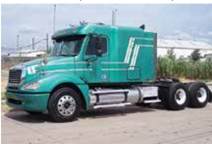
2006 Freightliner Columbia 120, 58 in Mid Roof Sleeper; Detroit Engine 490 hp; Diesel; 10 Spd OD; Engine Brake; Air Ride; 3.42 Ratio; 11R22.5 Tires; Aluminum/Steel Wheels; 218 in Wheelbase; 625,000 Miles. (6LV70503-WFF-3)