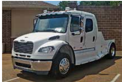
2011 Freightliner Business Class M2 106, ISC Cummins 350 hp; Auto-OD; Eng. Brake; Air Ride; 4.63 Ratio; 22.5 Tires; Aluminum Wheels; 195" WB; Single Axle; 10,000 lb Front Axle Wt; 17,500 lb Rear Axle Wt; 1,500 Miles. (BDBA7353-ABQ-1) $119,900 $114,900