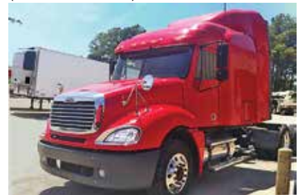
2007 Freightliner Columbia 120, 60" Mid Roof Sleeper, Detroit Series 60 14 L, 515 HP, 10 Spd, Eng. Brake, Air Ride, 3.58 Ratio, 230" WB, 22.5 Tires, Aluminum Front Wheels, Aluminum Outside Rear Wheels, 698,560 Miles. (5LW52312-SHV-1) $35,900