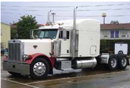
2006 Peterbilt 379EXHD, 70 in Ultracab Unibilt; C15 Caterpillar Engine 475 hp; Diesel; 18 Spd OD; Engine Brake; Air Ride Suspension; 3.36 Ratio; 24.5 Tires; All Aluminum Wheels; 651,046 Miles. (6D854523-TXK-3) $55,900