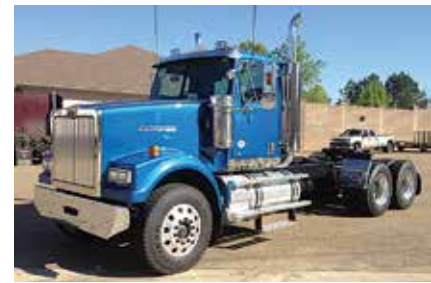
2012 Freightliner 114SD, DD13 Detroit Engine 450 hp; Diesel; 10 Spd OD; Engine Brake; Air Ride Suspension; 3.70 Ratio; 24.5 LP Tires; Aluminum Wheels; 210 in Wheelbase. (CHBK1589-TYL-3)