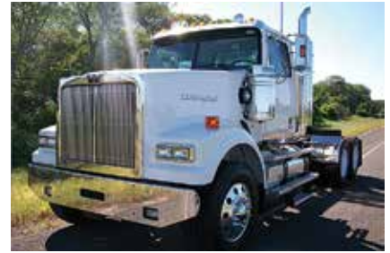
2013 Western Star 4900, ISX 15L Cummins Engine 450 hp; Diesel; 10 Spd; Air Ride Suspension; 3.70 Ratio; 24.5 Tires; Aluminum/Steel Wheels; 215 in Wheelbase. (CPBW7998-BRY-3) New.