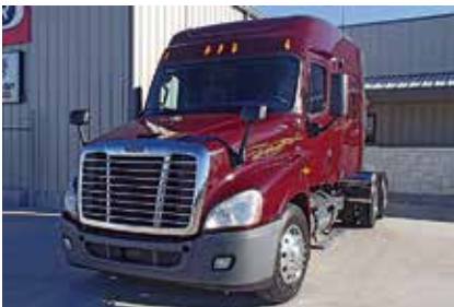
2009 Freightliner Cascadia, 72 in Mid Roof XT Sleeper; DD 15 Detroit Engine 500 hp; Diesel; 10 Spd OD; Engine Brake; Air Ride; 3.42 Ratio; LP 22.5 Tires; All Aluminum Wheels; 230 in Wheelbase; 418,000 Miles. (9LAF0481-WAC-2)