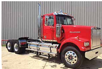
2013 Western Star 4900 , Detroit DD15, 505 HP, 10 Spd, Air Ride Suspension, 230" Wheelbase, 24.5 Tires, All Aluminum Wheels, 5 yr / 500K Mile Detroit Engine Warranty. New. (DPFA5980-SHV-2)