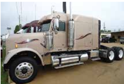
2007 Freightliner Classic 70" Flat Top Sleeper , Caterpillar C15, 475 HP, 10 Spd, 3.58 Ratio, 245" Wheelbase, 24.5 Tires, Aluminum Front Wheels, Steel Rear Wheels. (7DX67281-TXK-3)