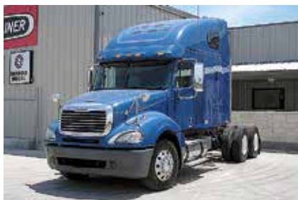
2007 Freightliner CL12064ST Columbia 120 , 70 in Raised Roof Condo; 14.0 Detroit Engine; Diesel; 10 Spd OD; Engine Brake; Air Ride Suspension; 3.55 Ratio; LP 22.5 Tires; Aluminum/Steel Wheels; 230 in Wheelbase; Tandem Axle, 582,000 Miles. (7LY88280-TEM-1) $43,500