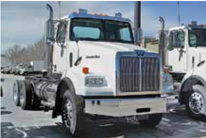
2012 Western Star 4900SB , Cummins ISX, 485 HP, 18 Spd Transmission, TufTrac Suspension, 4.30 Ratio, 227" Wheelbase, All Aluminum Wheels, 24.5 Tires. New. (CDPBW7373-FAR-2)