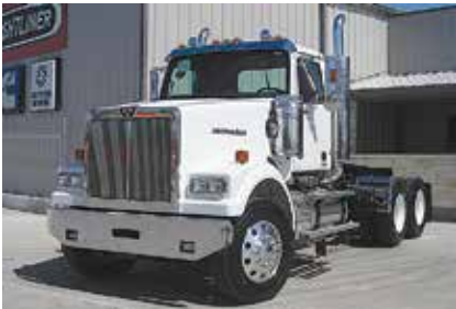
2013 Western Star 4900FA , ISX Cummins Engine 450 hp; 10 Spd OD; Engine Brake; Air Ride Suspension; 3.70 Ratio; 11R 24.5 Tires; Aluminum/Steel Wheels; 215 in Wheelbase; Tandem Axle. New. (DPBW8000-TEM-2)