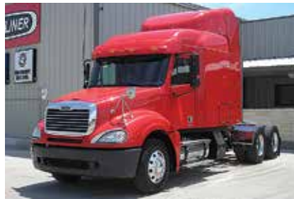
2006 Freightliner CL12064 Columbia 120 , 70 in Mid Roof XT Sleeper; 14.0 Detroit 515 hp; 10 Spd OD; Engine Brake; Air Ride; 3.58 Ratio; LP 22.5 Tires; Aluminum Wheels; 230 in WB; 630,000 Miles. (6LW57999-TEM-3) $39,900 $39,500