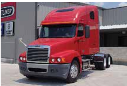
2007 Freightliner C12064ST Century 120 , 70 in Raised Roof Condo; 14.0 Detroit Engine 455 hp; Diesel; 10 Spd OD; Engine Brake; Air Ride; 3.58 Ratio; LP 22.5 Tires; Aluminum/Steel Wheels; 230 in WB, 570,000 Miles. (7LV79970-WAC-2)