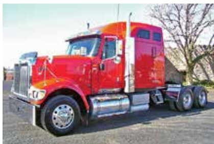
2008 International 9900i , 72 in Pro Sleeper; C15 Caterpillar 475 hp; 13 Spd OD; Engine Brake; Air Ride; 22.5 LP Tires; All Aluminum Wheels; 260 in WB; Fresh Overhaul - Comes With 3-YR Unlimited Miles Cat OPT Warranty, 509,000 Miles. (8C637335-ABL-1) $72,500