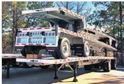
2012 Reitnauer Drop Deck , Air Ride Susp; 48 ft Length x 102 in Width; Aluminum Floor; 22.5 Tires; Alum. Comp; 48x102 Drop Deck. Alum. wheels, Tool box, and LED lights. -0- Down Financing Available WAC. New. (CR026805-TYL-TRL-2b)