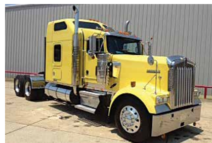
2006 Kenworth W900L , 72 in Aerocab Aerodyne Sleeper; C15 Caterpillar Engine 475 hp; Diesel; 13 Spd OD; Engine Brake; 8 Bag Air Ride; 3.36 Ratio; 11 X 24.5 Tires; All Aluminum Wheels; 266 in WB; Tandem Axle. (6J112429-SHV-1) $51,800 $49,800