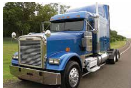
(3) 2008 Freightliner Classic XL FLD13264T , 70 in Mid Roof XT Sleeper; 14.0 Detroit 490 hp; Diesel; 10 Spd OD; Eng. Brake; Air Ride; 3.58 Ratio; LP 22.5 Tires; Alum. Wheels; 259" WB; 557,000 Miles. ((8DY42057-BRY-1) $59,950