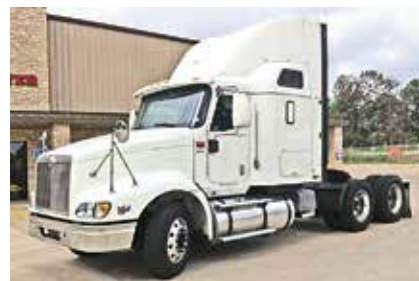
2005 International 9400 , Cummins ISX, 450 HP, 10 Spd, Air Ride Suspension, 2.64 Ratio, 204" Wheelbase, 22.5 LP Tires, All Aluminum Wheels, 881,470 Miles. (5N043475-TYL-1) $25,500