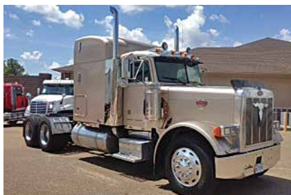
2001 Peterbilt Conventional , 63" Mid Roof Sleeper, 24.5 Tires, Aluminum Front Wheels, Aluminum Outer Wheels, 983,541 Miles. (1D560656-TXK-1) $18,500