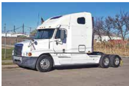
2007 Freightliner CST 12064 Century 120 , 70 in RR Condo; Detroit 455 HP; 10 Spd OD; Engine Brake; Air Ride Suspension; 3.58 Ratio; 22.5LP Tires; All Aluminum Wheels; 236 in WB; Tandem Axle, 598,000 Miles. (7LX03451-WFF-1) $39,900