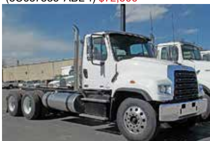
2012 Freightliner 114SD , Detroit DD13, 450 HP, 10 Spd Transmission, TufTrac Suspension, 4.30 Ratio, 220" Wheelbase, Aluminum Front Wheels, Steel Rear Wheels, 24.5 Tires. New. (CHBT4798-FAR-1) $118,200 Includes FET