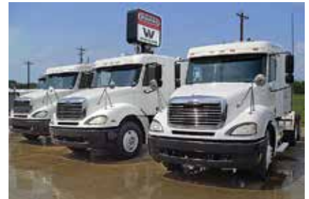
2004 Freightliner CL120 Columbia , 48 in Mid Roof Sleeper; Mercedes Engine 450 hp; Diesel; 10 Spd OD; Engine Brake; Air Ride; 3.73 Ratio; 22.5 Tires; Aluminum/Steel Wheels; 220 in Wheelbase; Tandem Axle, 645,337 Miles. (4LL98011-BRY-3)