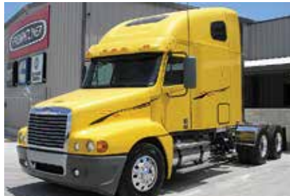
2008 Freightliner CST120 Century , Detroit DDC 14.0, 500 HP, 10 Spd, Engine Brake, Air Ride Suspension, 230" Wheelbase, 3.42 Ratio, 22.5 LP Tires, All Aluminum Wheels, Diesel Powered APU, EPA 2007 Motor, 498,000 Miles. (8LAB3321-BRY-2)