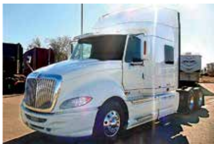
(2) 2008 International Prostar , Mid Roof Sleeper; ISX Cummins Engine 485 hp; Diesel; 13 Spd OD; Engine Brake; Air Ride Suspension; 3.55 Ratio; 22.5 Tires; All Aluminum Wheels; Tandem Axle, 463,690 Miles. (8C571251-ABQ-1) $52,500 $47,500