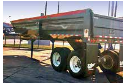
2012 Manac Light Weight End Dump , Spring Susp; 26 ft Length; Frameless; 11r24.5 Tires; Steel Disc Wheels; Fixed Tandem Axle; Steel Composition; 26' Light Wt End Dump. 44,000 Single Point Susp 11r24.5 Tires. -0- Down WAC. New. (CP014315-SHV-TRL-1A) $26,100