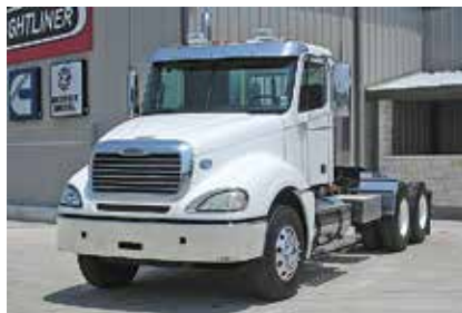
2009 Freightliner CL12064ST Columbia 120 , DD 15 Detroit Engine 475 hp; Diesel; 10 Spd OD; Engine Brake; Air Ride; 3.90 Ratio; 11 R 22.5 Tires; Aluminum/Steel Wheels; 210 in WB, 193,400 Miles. (9DAC9440-WAC-3)