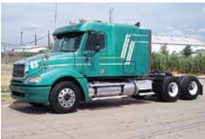
2006 Freightliner Conventional Mid Roof Sleeper , Detroit DDC 14.0, 490 HP, 10 SPD, Engine Brake, Air Ride Suspension, 218" Wheelbase, 22.5 Tires, Aluminum Front Wheels, Steel Rear Wheels, 692,000 Miles. (6LV70500-WFF-3)