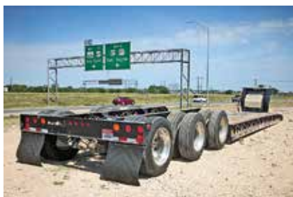
2008 Etny Low Boy . 51' x 102", 22.5 LP Tires, 50 Ton Detach. Pony Motor, 25' in the Well and Rear Axle Lift. Good Rubber, and All New Brake Shoes, Drums and S-Cams. (8E111240-SAN-TRL-1) $51,500 $49,867