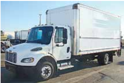
2005 Freightliner Business Class M2 106 Med. Duty , C7 Caterpillar 207 hp; Auto OD; Spring; Lift End Gate; Roll up Door; CurbsideSideDoors; 4.30Ratio; 19.5Tires; Steel Wheels; 204 in WB; 129,930 Miles (5DN79799-ABQ-3) $27,900—$25,900