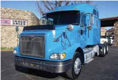
2005 International 9400 , 72 in Mid Roof Sleeper; ISX Cummins Engine 435 hp; Diesel; 10 Spd OD; Engine Brake; Air Ride; 3.58 Ratio; 22.5 LP Tires; Aluminum Outside Wheels; 229 in Wheelbase, 787,432 Miles. (5C005570-ABL-2)