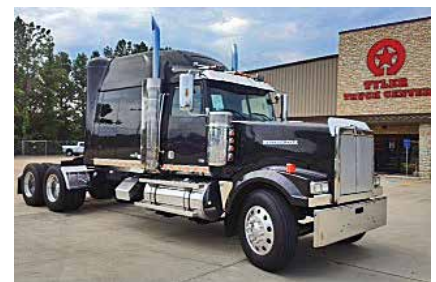
2010 Western Star 4900 EX . Detroit DD15 - 500-560 HP, 13 Spd, 60" Mid Roof Sleeper, Air Ride Suspension, 3.36 Ratio, 265" Wheelbase, 159,382 Miles. (APAV2882-TYL-3)