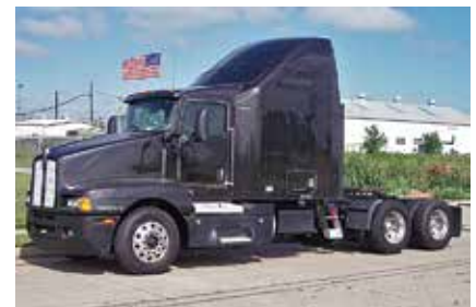
2006 Kenworth T660 72 in Premium High Roof; Caterpillar Engine 435 hp; Diesel; 13 Spd OD; Engine Brake; Air Ride; 3.58 Ratio; 22.5LP Tires; Aluminum Outside Wheels; 235 in Wheelbase; Tandem Axle, 680,000 Miles. (6J109047-WF-2)