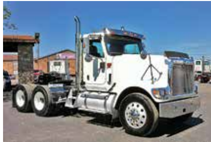
2009 International 9900 , ISX Cummins 435 hp; 10 Spd OD; Engine Brake; Air Ride; 3.91 Ratio; 24.5 Tires; Aluminum/Steel Wheels; 191 in WB; 6-Months 50K NTP Engine Warranty, 487,803 Miles.