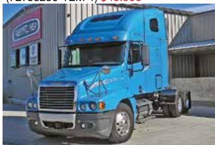
2008 Freightliner C12064ST Century 120 , 70 in Raised Roof Condo; 14.0 Detroit 515 hp; 10 Spd OD; Engine Brake; Air Ride; 3.42 Ratio; LP 22.5 Tires; All Aluminum Wheels; 230 in WB; Single Axle, 446,000 Miles. (8LW48819-WAC-1) $55,500