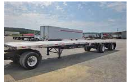
2005 Fontaine Combo Flatbed , (Qty: 3) Air Ride; Alum. Floor; 22.5 Tires; Steel Wheels; Spread Tandem Axle; Comp. Comp; 48x102 combo flatbed. Sliding winches, wide spread air ride, alum. floors. Fin. Avail WAC. (51530685-SHV-TRL-3c)