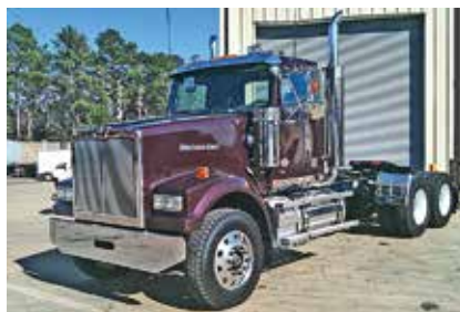
2012 Western Star 4900 , Detroit DD15, 505 HP, 10 Spd, 3.9 Ratio, Engine Brake, Air Ride, 24.5 Tires, Aluminum Front Wheel - Steel Rear Wheels. 5 Year / 500K Detroit Warranty. New. (CPBM9281-TYL-2)