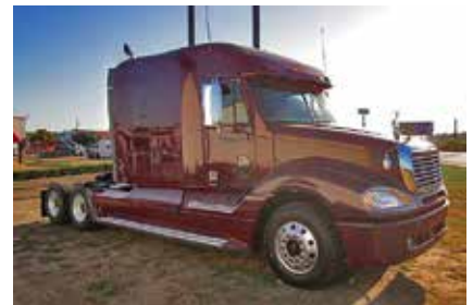
2007 Freightliner CL12042ST Columbia 120 , 70 in Mid Roof XT Sleeper; DDC 14.0 Detroit 455 hp; 10 Spd OD; Engine Brake; Air Ride; 3.58 Ratio; 22.5 Tires; Aluminum Outsiders; 230 in WB, 532,321 Miles. (7LX08966-SHV-3) $39,500 $33,500

See a complete inventory of new and used trucks and trailers online at: www.LonestarTruckGroup.com