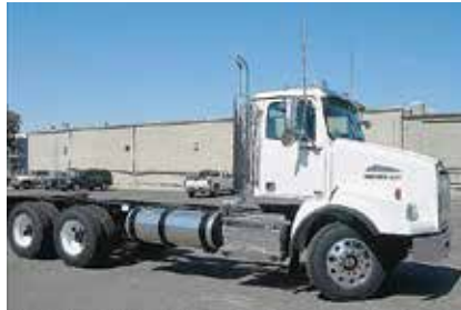
2012 Western Star 4900 , (Qty: 2) Standard Cab; DD13 Detroit Engine 450 hp; Diesel; 8LL; Engine Brake; TufTrac; 4.30 Ratio; 24.5 Tires; Aluminum/Steel Wheels; 227 in Wheelbase; Tandem Axle, New (CPBM2894-FAR-3)