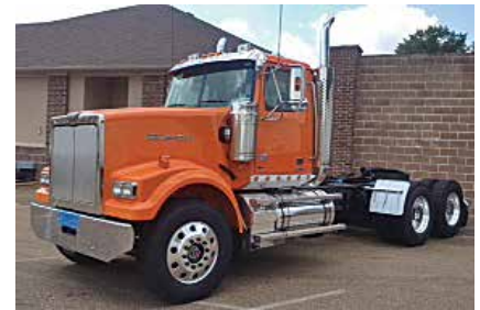
2013 Western Star 4900 , Detroit DD15, 505 HP, 10 Spd, Air Ride Suspension, 3.90 Ratio, 220" Wheelbase, 24.5 Tires, Aluminum Front Wheels, Aluminum Rear Wheels. New. (DPFA5975-TXK-2)