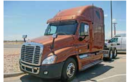
2012 Freightliner CA12564SLP Cascadia , 70 in Double Deck Condo; ISX Cummins 500 hp; 12 mi; 13 Spd OD; Engine Brake; Air Ride; 3.42 Ratio; 22.5 Tires; Alum. Outside Wheels; 240 in WB; (CSBK2995-ABQ-2) $124,900 $122,900 FET Included. New.