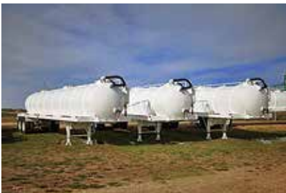
2012 Jack County Vacuum Trailers , Capacity: 5460 Gallons, Fixed Suspension, Tandem Axle, Steel Wheels, 11R24.5 Tires. (C1364776-SAN-TRL-3)