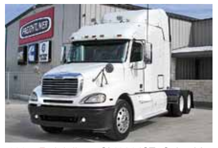
2007 Freightliner CL12064ST Columbia 120, 70 in Mid Roof XT Sleeper; 4000 Mercedes Engine 450 hp; 10 Spd OD; Engine Brake; Air Ride; 3.58 Ratio; LP 24.5 Tires; Aluminum/Steel Wheels; 230 in WB, 684,000 Miles. (7LY58084-TEM-3)