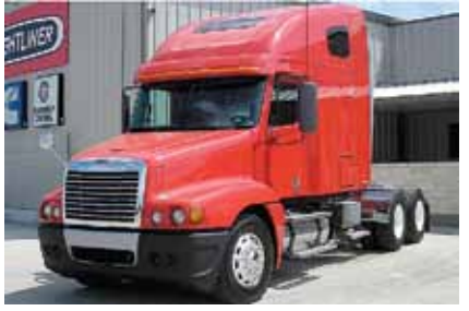
2007 Freightliner C12064ST Century 120, 70 in Raised Roof Condo; 14.0 Detroit Engine; Diesel; 10 Spd OD; Engine Brake; Air Ride; 3.58 Ratio; LP 22.5 Tires; Aluminum/Steel Wheels; 230" WB; 555,000 Miles. (7PV80063-WAC-3)