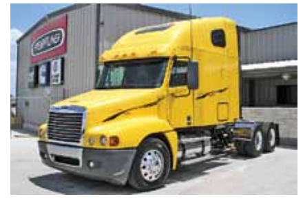
2008 Freightliner CST120 Century, Detroit DDC 14.0, 500 HP, 10 Spd, Raised Roof Sleeper, 3.42 Ratio, Engine Brake, Air Ride, 230" WB, 22.5 LP Tires, Aluminum Wheels, Diesel Powered APU, EPA 2007 Motor, 495,000 Miles. (8LAB3321-BRY-3)