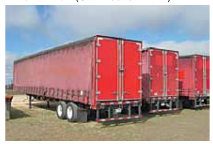
2004 Nuva Van Trailers, (4 Qty) 48' x 102", Air Ride Suspension, Swing Doors. 11R22.5 Tires, Soft Side Steel Trailers, Apiton Floors. (41045455-SAN-TRL-3)