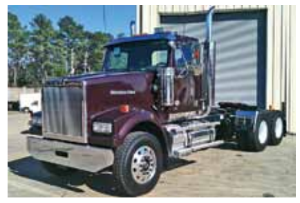
2012 Western Star 4900, Detroit DD15, 505 HP, 10 Spd, 3.90 Ratio, Engine Brake, Air Ride, 24.5 Tires, Aluminum Front Wheels, Steel Rear Wheels, Warranty. New (CPBM9281-TYL-2)