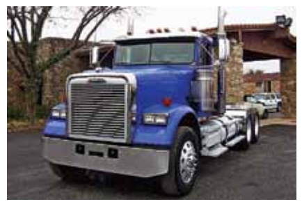
2009 Freightliner FLD12064SD, DDC 14.0 Detroit Engine 490 hp; Diesel; 10 Spd OD; Engine Brake; Air Ride Suspension; 3.90 Ratio; 24.5 Tires; Aluminum Outside Wheels; 212 in Wheelbase, New Tires, 525,000 Miles. (9DAE2552-ABL-2) $65,000