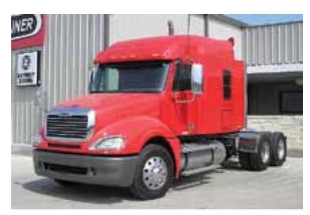
2008 Freightliner CL12064ST Columbia 120, 70 in Mid Roof XT Sleeper; 14.0 Detroit Engine 515 hp; Diesel; 10 Spd OD; Engine Brake; Air Ride; 3.42 Ratio; LP 22.5 Tires; Aluminum Wheels; 230" WB, 593,000 Miles. (8LZ86155-WAC-2)