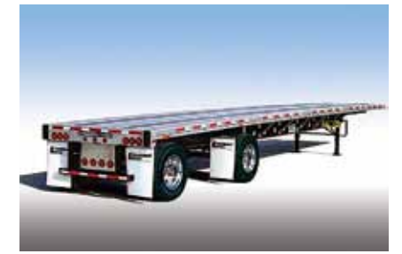
2013 Transcraft Combo Flatbed, (Qty: 3) Air Ride Suspension; 48 ft Length x 102 in Width; Aluminum Floor; 22.5 Tires; Aluminum/Steel Wheels; Spread Tandem Axle; Combination Composition; Combo Flatbeds. New. (D3742658-SHV-TRL-3c)