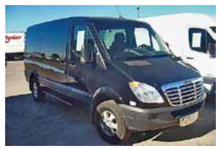
2010 Freightliner Sprinter 2500, V6 Diesel Mercedes Eng. 188 hp; Diesel; 40 mi; Automatic OD; Spring Susp; Steel Wheels; Single Axle; 11 Passengers; 144 in WB, 2010 Emissions. New. (A5498817-ABQ-2) $49,900 $39,900