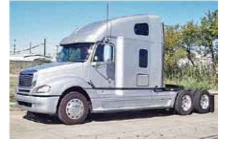
2007 Freightliner Columbia 120, 70 in Raised Roof Condo; Detroit Engine 490 hp; 10 Spd OD; Engine Brake; Air Ride; 3.42 Ratio; 24.5LP Tires; All Aluminum Wheels; 235" Wheelbase; 620,000 Miles. (7LW76277-WF-1) $45,900-$42,900