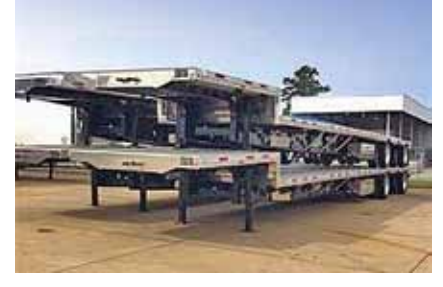
2013 Transcraft Combo Drop Deck, (Qty: 3) Air Ride; 53 ft Long x 102 in Wide; Alum. Floor; 22.5 Tires; Alum. Outside Wheels; Sliding Spread Tandem Axle; Combination Comp; Fixed Neck. New. (D3742652-SHV-TRL-2B) $Call for Price.