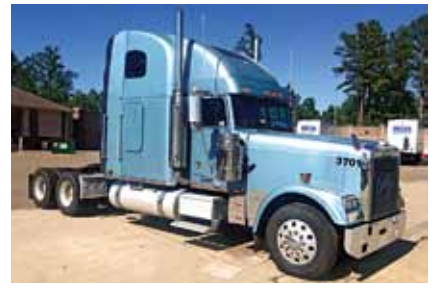
2006 Freightliner FLD132 Classic XL, 70" Sleeper, Caterpillar C15, 9 Spd, 3.58 Ratio, 260" Wheelbase. (6DU25708-TXK-2) $44,500