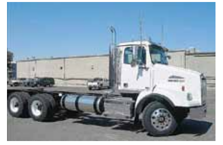
2012 Western Star 4900, (Qty: 2) Standard Cab; DD13 Detroit Engine 450 hp; Diesel; 8LL; Engine Brake; TufTrac; 4.30 Ratio; 24.5 Tires; Aluminum/Steel Wheels; 227 in Wheelbase; Tandem Axle, New (CPBM2894-FAR-3)