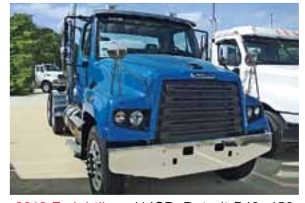
2012 Freightliner 114SD, Detroit D13, 450 HP, 10 Spd. 3:70 Ratio, Engine Brake, Single Axle, Air Ride, 210" WB, 24.5 LP Tires, Steel Wheels, Aluminum Rear Wheels, 5 year/500,000 Engine Warranty. New (CHBK1589-TXK-1) Call For Price