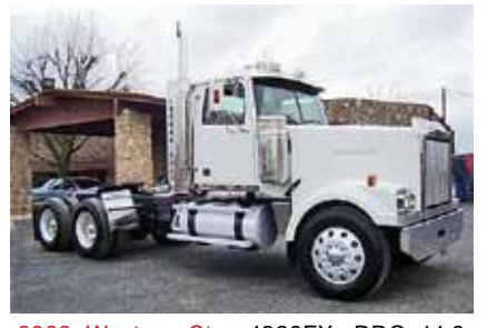
2009 Western Star 4900EX, DDC 14.0 Detroit Engine 515 hp; Diesel; 10 Spd OD; Engine Brake; TufTrac Suspension; 3.91 Ratio; 24.5 Tires; All Aluminum Wheels; 225 in Wheelbase, 150,000 Miles. (9PAF2635-ABL-3) $92,500