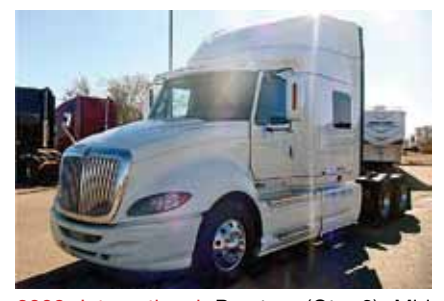
2008 International Prostar, (Qty 2) Mid Roof Sleeper; ISX Cummins Engine 485 hp; Diesel; 498,563 mi; 13 Spd OD; Eng. Brake; Air Ride; 3.55 Ratio; 22.5 Tires; Alum Wheels; 12,000 lb Front Axle Wt; 40,000 lb Rear Axle Wt, 498,563 Miles. (8C538659-ABQ-1) $64,900 $52,900