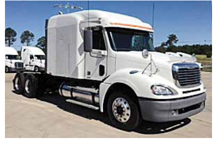
2007 Freightliner Conventional Mid Roof Sleeper, Detroit DDC 14.0, 475 HP, 10 Spd, Exhaust Brake, Air Ride Suspension, 22.5 LP Tires, All Aluminum Wheels, 686,356 Miles. ((7LW29006-TYL-1) $47,500