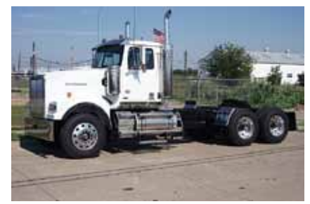
2013 Western Star 4900SF, Diesel Detroit Engine 505 hp; Diesel; 13 Spd OD; Engine Brake; Air Ride Suspension; 3.70 Ratio; 11R24.5 Tires; All Aluminum Wheels; 220 in Wheelbase; Tandem Axle; New (DPBZ1129-WF-2)