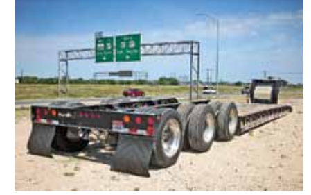
2008 ETNY Low Boy. 51' x 102", 22.5 LP Tires, 50 Ton Detach. Pony Motor, 25' in the Well and Rear Axle Lift. Good Rubber, and All New Brake Shoes, Drums and S-Cams. (8E111240-SAN-TRL-2)