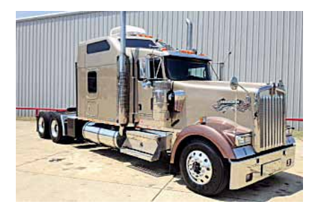
2006 Kenworth W900L, 86 in Studio Sleeper; C15 Caterpillar Engine 550 hp; Diesel; 639 mi; 18 Spd OD; Engine Brake; Air Ride Suspension; 3.55 Ratio; All Aluminum Wheels; Tandem Axle. (6J142906-SHV-3)