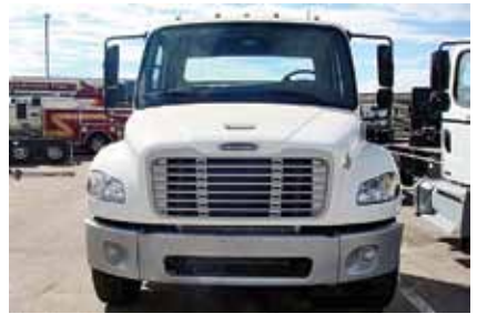
2011 Freightliner M2 106, Standard Cab; ISB Cummins 220 hp; 6 mi; 5 Spd; Spring Susp; 5.13 Ratio; 22.5 Tires; Steel Wheels; 254" WB; Single Ax; 18,000 lb Rear Ax Wt; 8,000 lb Front Axle Wt, New. (BDAZ7404-ABQ-3)-$59,900 $49,900