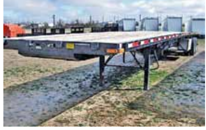
2008 Transcraft Flat Bed, 53' x 102", Air Ride Suspension, Tandem Axle, 11R24.5 Tires, Steel Wheels, Hardwood Floors. (81084591-SAN-TRL-1) $18,500