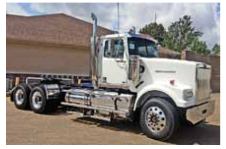
2013 Western Star 4900, Detroit DD15, 505 HP, 10 Spd, 3.90 Ratio, Air Ride Suspension, 230" Wheelbase, 24.5 Tires, All Aluminum Wheels, 5 Year/500K Engine Warranty. New (DPBW5387-TXK-3)