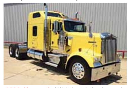
2006 Kenworth W900L, 72 in Aerocab Aerodyne Sleeper; C15 Caterpillar Engine 475 hp; Diesel; 13 Spd OD; Engine Brake; 8 Bag Air Ride; 3.36 Ratio; 11 X 24.5 Tires; All Aluminum Wheels; 266 in Wheelbase; Tandem Axle. (6J112429-SHV-2)