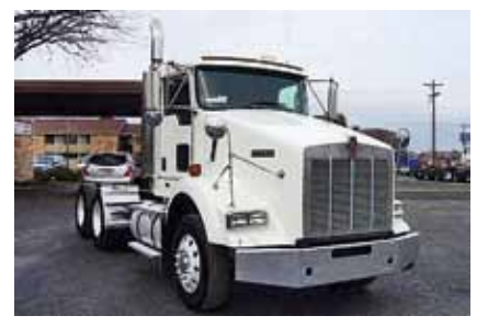
2008 Kenworth T800, ISX Cummins Engine 450 hp; Diesel; 10 Spd OD; Engine Brake; Air Ride; 3.55 Ratio; 22.5 LP Tires; All Aluminum Wheels; 173" WB; 6 Months 50K NTP Engine Warranty, 610,000 Miles. (8J235232-ABL-1) $52,500