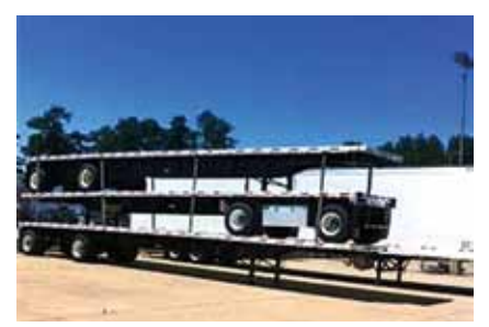
2007 Wabash Combo Flatbed, (Qty: 8) Air Ride Susp; 48 ft Long x 102 in Wide; Alum. Floor; 22.5 Tires; All Steel Wheels; Spread Tandem Axle; Combination Comp; 48x102 Combo Flatbed. (72020630-SHV-TRL-1A) Call for Price