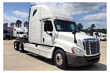
2010 Freightliner CA12564SLP Cascadia, 70 in Condo Sleeper; DD15 Detroit Engine 475 hp; 10 Spd OD; Engine Brake; Air Ride; 3.55 Ratio; 22.5 LP Tires; Aluminum Outside Wheels; 230" WB, 386,400 Miles. (ASAN4747-TYL-3)