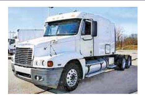
2007 Freightliner CST120 Century, Mid Roof Sleeper, Mercedes MBE4000, 10 Spd, 3.42 Ratio, Engine Brake, Air Ride, 22.5 LP Tires, Aluminum Front Wheels, Aluminum Outer Wheels, Unit has APU, 514,710 Miles. (7LZ50218-BRY-1) $39,900