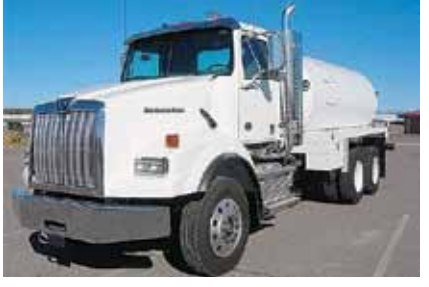
2012 Western Star 4964SA Vacuum Tank Truck, Cummins 485 hp; Diesel; 8LL; Engine Brake; TufTrac Susp; 4.30 Ratio; Aluminum/Steel Wheels; 227 in WB; 24.5 Tires; 46,000 lb Rear Axle Wt; 14,600 lb Front Axle Wt. New (CPBK9610-FAR-1) $167,000 $166,000