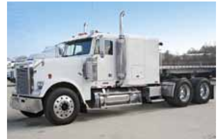
2000 Freightliner FLD120, Caterpillar 3406, 500 HP, 10 Spd, 42" Flat Top Sleeper, Air Ride, 4.11 Ratio, 230" Wheelbase, 24.5 Tires, Aluminum Front Wheels, Aluminum Outer Wheels, 1,211,276 Miles. (7YB86481-TYL-3 $22,500 ) $20,800