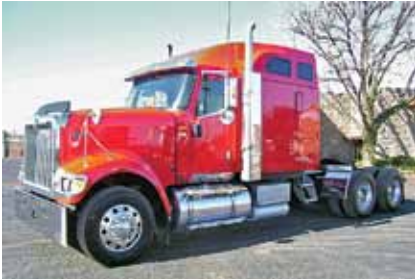
2008 International 9900 Mid-Roof Sleeper, Caterpillar C15, 475 HP, 13 Spd, 3.58 Ratio, Engine Brake, Air Ride, 22.5 LP Tires, All Aluminum Wheels, 509,000 Miles. 6 Months 50K Miles NTP Engine Warranty. (8C637335-ABL-2) $68,500 $61,500