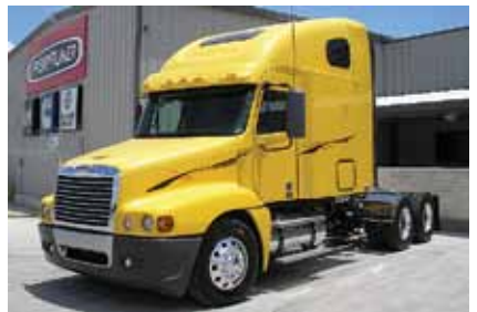
2008 Freightliner Century 120, Detroit Diesel DDC 14.0, 500 HP, 10 Spd, Raised Roof Sleeper 3.42 Ratio, Engine Brake, Air Ride Suspension, 22.5 LP Tires, All Aluminum Wheels, Diesel Powered APU, 495,000 Miles. (8LAB3321-BRY-3)