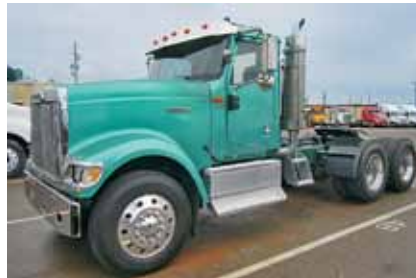
2000 International 9900, Caterpillar C12, 430 HP, 10 Speed, Air Ride, 24.5 Tires, Aluminum Front Wheels, Aluminum Outer Rear Wheels. 766,540 Miles. (YCO66784-TYL-2) $23,500 $19,880