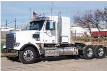
2012 Freightliner Coronado SD, 48 in Mid Roof Sleeper; Cummins Engine 450 hp; Diesel; 10 Spd OD; Engine Brake; Air Ride Suspension; 3.70 Ratio; 11R24.5 Tires; All Aluminum Wheels; 230 in Wheelbase; Tandem Axle; New (CDBV0761-WFF-3)