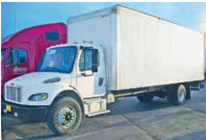
2007 Freightliner M2 26' Box Van, Caterpillar C7, 210 HP, Eaton Fuller 6 speed, 4.11 Ratio, Spring Suspension, 270" Wheelbase, Overhead Rear Doors, No Side Doors, Air Brakes, 85,000 Miles. (7HY30138-ABQ-3) $38,900 $32,900