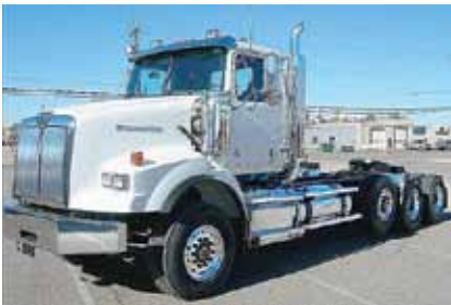
2012 Western Star 4900SA, Cummins Engine 525 hp; Diesel; 18 Spd; Engine Brake; Air Ride; 4.30 Ratio; 24.5 Tires; All Aluminum Wheels; 260" WB; Tri Axle; 20,000 lb Front Axle Wt; 46,000 lb Rear Axle Wt. New (CPBM9529-FAR-2)