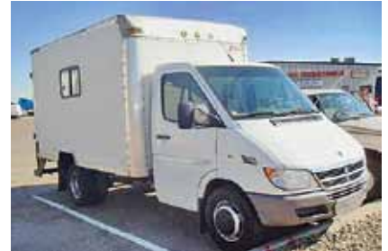
2006 Dodge Sprinter 3500, Standard Cab; Box Van, 5 cyl diesel Mercedes Engine; Diesel Fuel Type; 5 Spd OD; Spring Susp; Swing Door; 16 Tires; Steel Wheels; 144 in WB; Single Axle, 189,610 Miles. (65933715-ABQ-2) $14,900