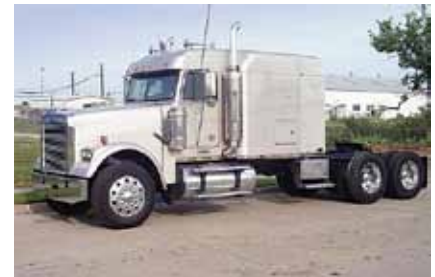
2007 Freightliner FLD12064SD, 70 in Mid Roof Sleeper; Detroit 515 hp; 10 Spd OD; Engine Brake; Air Ride; 3.58 Ratio; 11R24.5 Tires; All Aluminum Wheels; 250" WB; Tandem Axle; 483,000 Miles. (7DX55550-WFF-2)