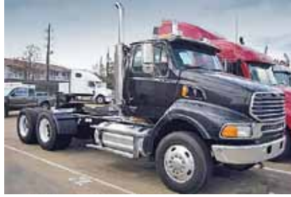
2005 Sterling A9500, MBE4000 Mercedes Engine 460 hp; Diesel Fuel Type; 10 Spd OD; Engine Brake; Air Ride Suspension; Aluminum/Steel Wheels; Tandem Axle. ) 5AU47043-SHV-2) $26,000