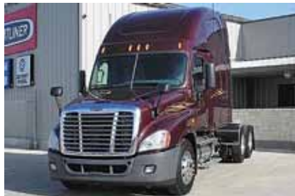
2009 Freightliner CA12564SLP Cascadia, 72 in Raised Roof Condo; 14.0 Detroit 500 hp; Diesel; 10 Spd OD; Engine Brake; Air Ride; 3.42 Ratio; LP 22.5 Tires; Aluminum Wheels; 230 in WB; Tandem Axle, 420,000 Miles. (9LAF0163-WAC-3)