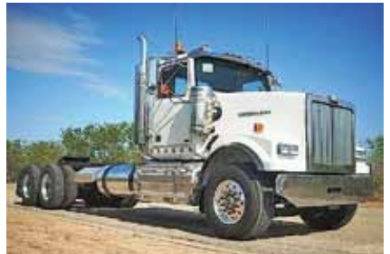
2012 Western Star 4900FA, 275 in WB, DD15 Detroit 560 hp, 18 Spd OD, Jakes, 20K Front, 4.10 Ratio, Neway 52,000 lb Air Ride, 48" A/S 5th Wheel, Dual 125 Gal Alum Tanks, Alum Wheels, Tinted Sliding Rear Window. New . (CPBM7234-SAN-2)