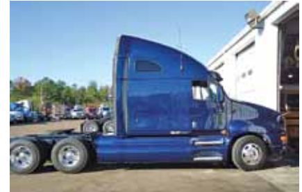
2007 Kenworth T2000, Raised Roof Sleeper, Caterpillar C15, 435 HP, 13 Spd, Air Ride Suspension, 3.36 Ratio, 22.5 LP Tires, All Aluminum Wheels. (7J168327-TXK-2) $43,500 $38,500