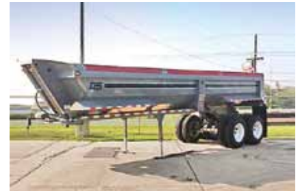
2012 Manac End Dump, 26' Lightweight End Dump, Single Point Suspension, 11R24.6 Tires. New . (CP014315-SHV-TRL-3c)