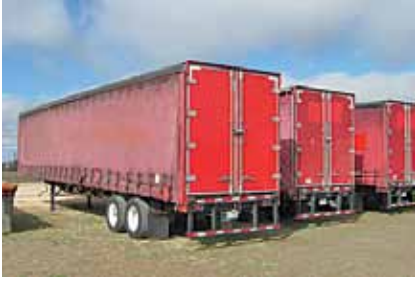
2004 Nuva Van Trailers, (4 Qty) 48' x 102", Air Ride Suspension, Swing Doors. 11R22.5 Tires, Soft Side Steel Trailers, Apiton Floors. (41045455-SAN-TRL-3)