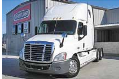
2009 Freightliner Cascadia, 72 in Raised Roof Condo; DD 15 Detroit 475 hp; Diesel Fuel Type; 10 Spd OD; Engine Brake; Air Ride; 3.58 Ratio; LP 22.5 Tires; All Aluminum Wheels; 240 in Wheelbase; 430,000 Miles. (9LAC0386-TEM-3)