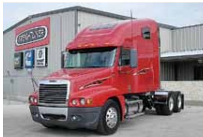
2008 Freightliner CL12064ST Century 120, 70 in RR Condo; 14.0 Detroit Engine 500 hp; Diesel; 10 Spd OD; Engine Brake; Air Ride; 3.42 Ratio; LP 22.5 Tires; All Aluminum Wheels; 230 in WB, 559,150 Miles. (8LAB3328-BRY-2) $59,750