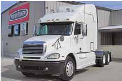
2007 Freightliner Columbia 120, 70 in Mid Roof XT Sleeper; 4000 Mercedes 450 hp; Diesel Fuel Type; 10 Spd OD; Engine Brake; Air Ride; 3.58 Ratio; LP 24.5 Tires; Aluminum/Steel Wheels; 230 in WB; 684,000 Miles. (7LY58084-WAC-2)