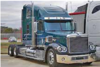
2007 Freightliner CC13264 Coronado, 70 in Hi Rise Sleeper; S60 Detroit 515 hp; 13 Spd OD; Eng. Brake; Air Ride; 3.58 Ratio; 22.5 Tires; All Aluminum Wheels; 265 in WB, 825,760 Miles. (7PY20704-TXK-3) $43,800 $42,500