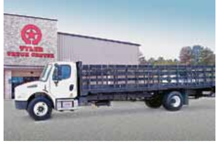
2004 Freightliner Business Class M2 Medium Duty, Diesel Fuel Type; 6 Spd OD; 4.11 Ratio; Steel Disc Wheels; LOW LOW Miles and Clean Fleet Maintained, Gross Vehicle Weight (lbs): 26000, 120,000 Miles. (4HM63358-SHV-3) $26,500