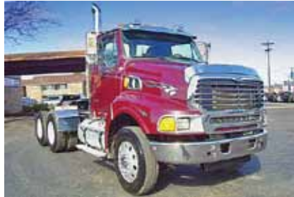
2009 Sterling L9500, DD15 Detroit 560 hp; ; Diesel Fuel Type; 18 Spd OD; Eng Brake; Air Ride; 4.10 Ratio; 24.5 Tires; Alum Wheels; 196 in WB; 14,000 lb Front Axle Wt; 46,000 lb Rear Axle Wt, 233,000 Mileage. (9AAB0130-ABL-3) $67,500