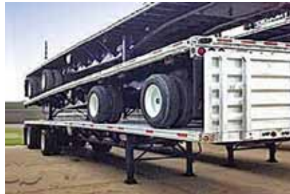
2003 Fontaine Combo Flatbed, (Qty: 6) Air Ride; 48 ft Long x 102 in Wide; Alum. Floor; 22.5 Tires; Steel Wheels; Spread Tandem Axle; Combination Comp; Headboards, Sliding Winches. (31516803-SHV-TRL-3b)