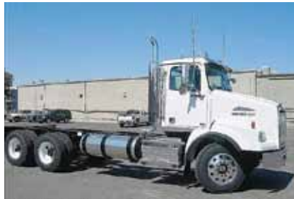
2012 Western Star 4900, (Qty: 2) Standard Cab; DD13 Detroit Engine 450 hp; Diesel; 8LL; Engine Brake; TufTrac; 4.30 Ratio; 24.5 Tires; Aluminum/Steel Wheels; 227 in Wheelbase; Tandem Axle, New (CPBM2894-FAR-3)