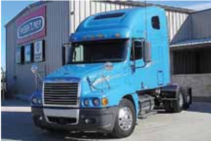
2008 Freightliner Century 120, 70 in Raised Roof Condo; 14.0 Detroit Engine 515 hp; Diesel; 10 Spd OD; Engine Brake; Air Ride; 3.42 Ratio; LP 22.5 Tires; All Aluminum Wheels; 230 in WB; Tandem Axle, 446,000 Miles. (8LW48819-TEM-2)