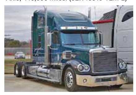
2007 Freightliner CC13264 Coronado, 70 in Hi Rise Sleeper; S60 Detroit 515 hp; 13 Spd OD; Eng. Brake; Air Ride; 3.58 Ratio; 22.5 Tires; All Aluminum Wheels; 265 in WB, 825,760 Miles. (7PY20704-TXK-3) $43.800 $43,500