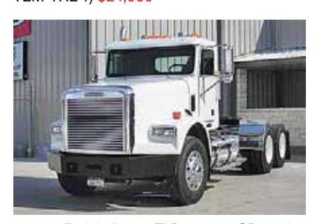
2005 Freightliner FLD 12064SD, 14.0 Detroit Engine 490 hp; Diesel; 10 Spd OD; Air Ride Suspension; 3.73 Ratio; 11R 24.5 Tires; Aluminum/Steel Wheels; 220 in Wheelbase; Tandem Axle, 417,000 Miles. (5DV55616-WAC-1) $46,000 $45,500