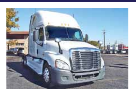
2009 Freightliner CA12564SLP, 72 in RR; DD15 Detroit 475 hp; 10 Spd OD; Air Ride; 3.58 Ratio; 22.5 LP Tires; All Alum. Wheels; 240 in WB, CARB approved, Texas TERP grant approved, NEW DRIVE TIRES, 436,000 Miles. (9LAC0620-ABL-1) $73,500