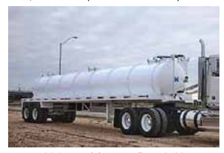
2012 Majona (5) 130 Barrel Vacuum Trailers in stock now, 65 on order, White Polysiloxane Exterior Severe Duty Industrial Paint, 2 Part Epoxy Interior Coating, 40 ft Long x 102 in Wide x 1 ft High; Complete Rigging Available, New (CA906031-SAN-TRL-2)