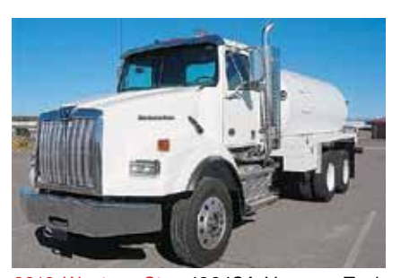
2012 Western Star 4964SA Vacuum Tank Truck, Cummins 485 hp; Diesel; 8LL; Engine Brake; TufTrac Susp; 4.30 Ratio; Aluminum/Steel Wheels; 227 in WB; 24.5 Tires; 46,000 lb Rear Axle Wt; 14,600 lb Front Axle Wt. New (CPBK9610-FAR-1) $167,500