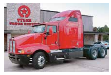
2007 Kenworth T600, 72 in Aerocab Aerodyne Sleeper; ISX Cummins Engine 450 hp; Diesel; Automatic OD; Engine Brake; Air Ride; 3.36 Ratio; 22.5 LP Tires; All Aluminum Wheels; 240 in Wheelbase. (7J189869-SHV-1) $49,700 $47,500