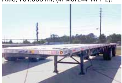
2000 Utility Flat Bed, 48' x 102", 2..5 LP Tires, Air Ride Suspension, Aluminum Floor, Sliding Winches. (YA317116-TYL-TRL-3c)