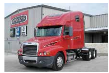
2008 Freightliner CL12064ST Century 120, 70 in RR Condo; 14.0 Detroit Engine 500 hp; Diesel; 10 Spd OD; Engine Brake; Air Ride; 3.42 Ratio; LP 22.5 Tires; All Aluminum Wheels; 230 in WB, 559,150 Miles. (8LAB3328-BRY-2) $59,750