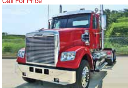
2012 Freightliner Coronado SD, Cummins ISX, 500 HP, 18 Spd, Air Ride Suspension, 24.5 LP Tires, All Aluminum Wheels, Warranty Available. New (CDBK0972-TXK-1) $122,661.