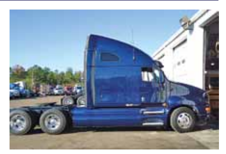
2007 Kenworth T2000, Raised Roof Sleeper, Caterpillar C15, 435 HP, 13 Spd, Air Ride Suspension, 3.36 Ratio, 22.5 LP Tires, All Aluminum Wheels. (7J168327-TXK-2) $43,500