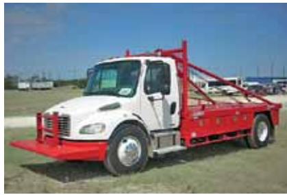
2004, 2005, 2006 & 2007 Freightliner Gang Trucks Coming Off Line Every 10 Days, Cat Power, 6 SPD, New 15'5" Bed, 20K Tulsa Winch with 2 Way Air PTO, Air Shift Controls, 6-7/8" Tailroller. Custom Built Units, Power Train Warranty & Financing Available. (Gang Truck-SAN-3)