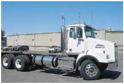
2012 Western Star 4900, (Qty: 2) Standard Cab; DD13 Detroit Engine 450 hp; Diesel; 8LL; Engine Brake; TufTrac; 4.30 Ratio; 24.5 Tires; Aluminum/Steel Wheels; 227 in Wheelbase; Tandem Axle, New (CPBM2894-FAR-3)