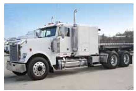
2000 Freightliner FLD120, Caterpillar 3406, 500 HP, 10 Spd, 42" Flat Top Sleeper, Air Ride, 4.11 Ratio, 230" Wheelbase, 24.5 Tires, Aluminum Front Wheels, Aluminum Outer Wheels, 1,211,276 Miles. (7YB86481-TYL-3) $22,500