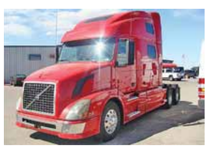
2007 Volvo VNL64T780, 71" Double Deck Condo; D13 Volvo Eng 465 hp; Ultrashift OD; Eng Brake; Air Ride; 3.42 Ratio; 22.5 Tires; Alum. Wheels; 12,500# Frnt Axle Wt; 40,000# Rear Axle Wt, 560,470 Miles. (7N435090-ABQ-2) $41,900 $37,900