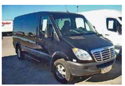
2010 Freightliner Sprinter 2500, V6 Diesel Mercedes Engine 188 hp; Diesel; 40 mi; Automatic OD; Spring Susp; All Steel Wheels; Single Axle; 11 Passengers; 144 in WB, Drives like a car, hauls like a truck. 2010 Emissions. New. (A5498817-ABQ-1) $49,900 $44,900