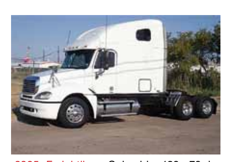
2005 Freightliner Columbia 120, 70 in Raised Roof Condo; Detroit 455 hp; 10 Spd OD; Engine Brake; Air Ride; 3.58 Ratio; 22.5LP Tires; All Aluminum Wheels; 230 in WB; 758,000 Miles. (5LN73029-WF-1) $28,900 $25,900