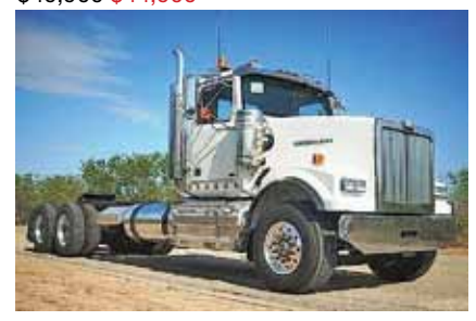
2012 Western Star 4900FA, 275 in WB, DD15 Detroit 560 hp, 18 Spd OD, Jakes, 20K Front, 4.10 Ratio, Neway 52,000 lb Air Ride, 48" A/S 5th Wheel, Dual 125 Gal Alum Tanks, Alum Wheels, Tinted Sliding Rear Window. New. (CPBM7234-SAN-1) Call For Price