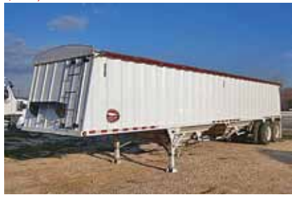
2010 Construction Trailer Hopper Bottom, Leaf Springs Suspension; 40 ft Length x 96 in Width; 11R 24.5 Tires; All Steel Wheels; Fixed Tandem Axle; Steel Composition; 2 Hoppers; Better than New. (AS000538-TEM-TRL-1) $24,000