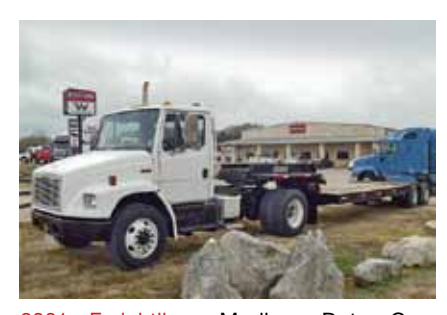
2001 Freightliner Medium Duty Conventional, Cummins ISC 260, Allison Automatic Transmission, 5.38 Ratio, Spring Suspension, 22.5 LP Tires, Steel Wheels, Air Brakes. (1HF65400-BRY-1) $16,900