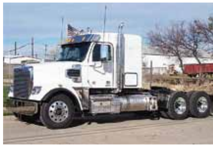
2012 Freightliner Coronado SD, 48 in Mid Roof Sleeper; Cummins Engine 450 hp; Diesel; 10 Spd OD; Engine Brake; Air Ride Suspension; 3.70 Ratio; 11R24,5 Tires; All Aluminum Wheels; 230 in Wheelbase; Tandem Axle; New (CDBV0761-WFF-3)