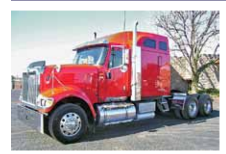
2008 International 9900 Mid Roof Sleeper, Caterpillar C15, 475 HP, 13 Spd, 3.58 Ratio, Engine Brake, Air Ride, 22.5 LP Tires, All Aluminum Wheels, 509,000 Miles. 6 Months 50K Miles NTP Engine Warranty. (8C637335-ABL-2) $68,500