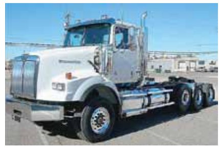
2012 Western Star 4900SA, Cummins Engine 525 hp; Diesel; 18 Spd; Engine Brake; Air Ride; 4.30 Ratio; 24.5 Tires; All Aluminum Wheels; 260" WB; Tri Axle; 20,000 lb Front Axle Wt; 46,000 lb Rear Axle Wt. New (CPBM9529-FAR-2)