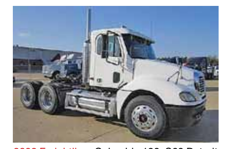
2002 Freightliner Columbia 120, S60 Detroit Engine 430 hp; Diesel; 10 Spd OD; Air Ride Suspension; 3.70 Ratio; Aluminum Wheels; 171 in Wheelbase; Tandem Axle; 734,540 Miles. (2PJ96345-TYL-1) $27,500 $26,500