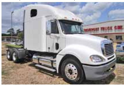
2007 Freightliner Columbia CL120, Detroit Diesel DDC 14, 455 HP, 10 Spd, 70" Condo Sleeper, Air Ride Suspension, 3.58 Ratio, 230" WB, 22.5 LP Tires, All Aluminum Wheels, 498,210 Miles. (7LY88971-SHV-2) $42,500 $33,800