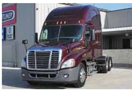
2009 Freightliner CA12564SLP Cascadia, 72 in Raised Roof Condo; 14.0 Detroit 500 hp; Diesel; 10 Spd OD; Engine Brake; Air Ride; 3.42 Ratio; LP 22.5 Tires; Aluminum Wheels; 230 in WB; Tandem Axle, 420,000 Miles. (9LAF0163-WAC-3)