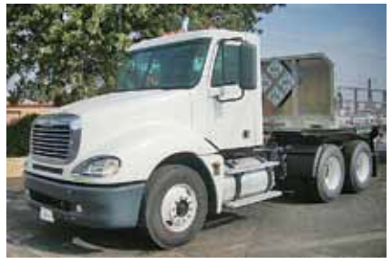
2005 Freightliner CL120 Columbia Day Cab, Detroit DDC 14.0, 450 HP, 10 Spd, Air Ride, 3.70 Ratio, 171" WB, 22.5 Tires, Steel Wheels, 489,506 Miles. 6 Months 50K Miles NTP Engine Warranty. (5LN93610-ABL-3) $39,500