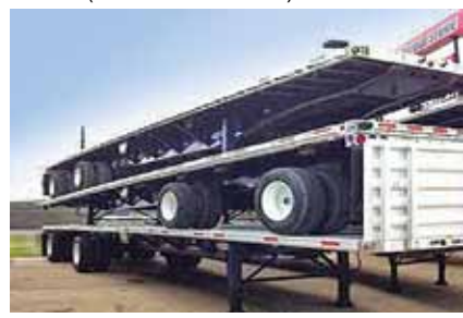
2003 Fontaine Combo Flatbed, (Qty: 10) Air Ride; 48 ft Length x 102 in Width; Aluminum Floor; 22.5 Tires; All Steel Wheels; Spread Tandem Axle; Combination Composition. (31516798-SHV-TRL-3b)