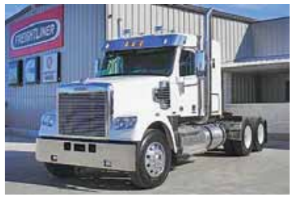
2012 Freightliner Coronado SD, 48 in Sleeper; DD 15 Detroit Engine 505 hp; Diesel; 10 Spd OD; Engine Brake; Air Ride; 3.42 Ratio; 11R 24.5 Tires; Aluminum/ Steel Wheels; 230" WB; Tandem Axle. New (CDBM5408-WAC-2)