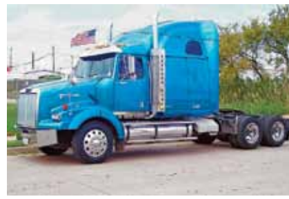
2004 Western Star 4900SA, 82 in Stratosphere; Detroit Engine 500 hp; 13 Spd OD; Engine Brake; Air Ride; 3.58 Ratio; 24.5LP Tires; All Aluminum Wheels; 244 in Wheelbase; Tandem Axle, 701,000 mi; (4PM87244-WFF-2).