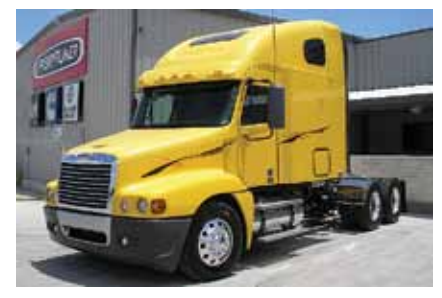
2008 Freightliner Century 120, Detroit Diesel DDC 14.0, 500 HP, 10 Spd, Raised Roof Sleeper 3.42 Ratio, Engine Brake, Air Ride Suspension, 22.5 LP Tires, All Aluminum Wheels, Diesel Powered APU, 495,000 Miles. (8LAB3321-BRY-3)