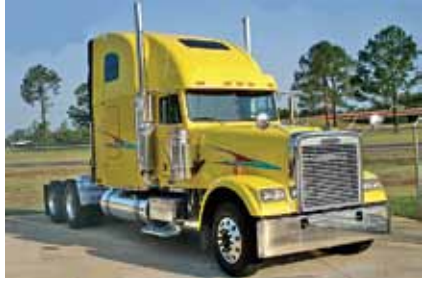
2005 Freightliner FLD132, Raised Roof Sleeper, Detroit Diesel DDC 14.0, 515 HP, 13 Spd, Engine Brake Air Ride Suspension, 259" Wheel Base, 225.5 LP Tires, All Aluminum Wheels, 783,890 Miles. (5DU47506-TYL-1) $35,500