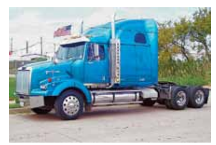
2004 Western Star 4900SA, 82 in Stratosphere; Detroit Engine 500 hp; 13 Spd OD; Engine Brake; Air Ride; 3.58 Ratio; 24.5LP Tires; All Aluminum Wheels; 244 in Wheelbase; Tandem Axle, 701,000 mi; (4PM87244-WFF-2).