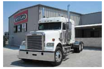
2007 Freightliner FLD12064T Classic, 70 in Mid Roof Sleeper; 14.0 Detroit Engine 515 hp; Diesel; 10 Spd OD; Engine Brake; Air Ride; 11R24.5 Tires; Aluminum/ Steel Wheels; 250 in WB; Tandem Axle; 764,000 Miles. (7DX26959-WAC-2)