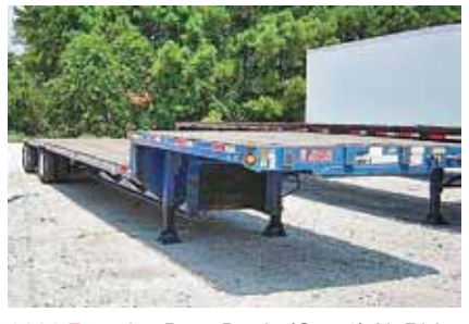
2000 Fontaine Drop Deck, (Qty: 6) Air Ride; 48 ft Long / 102 in Dide; Apitong Floor; 22.5 Tires; Steel Disc Wheels; Spread Tandem Ax; Steel Comp.; Wide Spread Air ride, Container locks 1-20' container. Trailer has 11' upper deck / 37' bottom deck. (Y5993422-SHV-TRL-1A) Call for Price