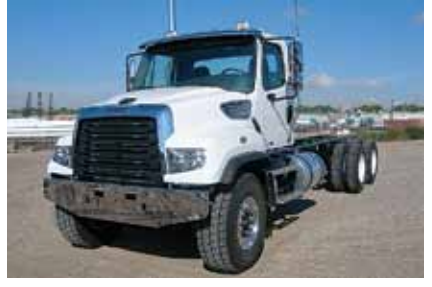
2012 Freightliner 114SD, Standard Cab; DD13 Detroit Engine 450 hp; Diesel; 18 Spd; Engine Brake; TufTrac Susp; 4.30 Ratio; 24.5 Tires; Alum/Steel Wheels; 260 in WB; 14,600 lb Front Axle Wt; 46,000 lb Rear Axle Wt. (CDBK3308-FAR-3)