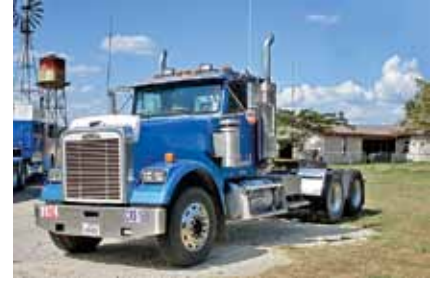
2000 Freightliner FLD120, Detroit Diesel DDC 12.7, 500 HP, 10 Spd, Air Ride Suspension, 4.33 Ratio, 220" Wheelbase, 24.5 Tires, All Aluminum Wheels, 834,320 Miles. (YPA723331-TYL-2) $23,500