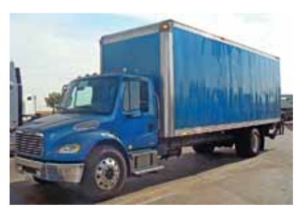
2005 Freightliner M2 Business Class Box Van, Caterpillar C7, 210 HP, Eaton-Fuller 6 Spd., Spring Suspension, 270" Wheelbase, Overhead Rear Door, No Side Door, Air Brakes, 22.5 Tires, All Aluminum Wheels, 82,530 Miles. (5HU46722-ABQ-2) $36,900 $29,900