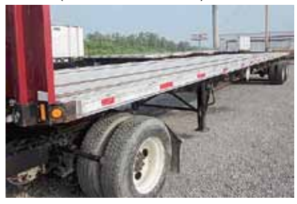
2000 Fontaine Combo Flatbed, (Qty: 2) Spring Susp; 48 ft Long x 102 in Wide; ALum. Floor; 22.5 Tires; All Steel Wheels; Sliding Tandem Axle; Combination Composition; Alum. Combo Spring Slider. 22.5 Tires. (Y5990931-SHV-TRL-3b)