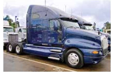
2007 Kenworth T2000, 72" Sleeper, Caterpillar C15, 435 HP, 9 Spd, Air Ride Suspension, 3.36 Ratio, 240" Wheelbase, 22.5 LP Tires, All Aluminum Wheels, Truck has ThermoKing Diesel Powered APU. (7J168380-TYL-3) $43,500