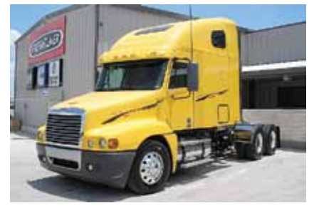
2008 Freightliner C12064ST Century 120, 70 in Raised Roof Condo; 14.0 Detroit Engine 500 hp; Diesel; 10 Spd OD; Engine Brake; Air Ride; 3.42 Ratio; LP 22.5 Tires; All Aluminum Wheels; 230 in Wheelbase; 475,000 Miles. (8LAB3321-TEM-2)