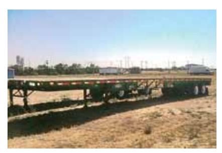
1994 Fontaine, 48' x 102" Flatbed, 22.5 LP Tires, Air Ride Suspension, Hardwood Floors, Nice Trailer with Good Brakes and Tires, Needs a Couple of Boards in Floor. (R1562228-SAN-TRL-3)