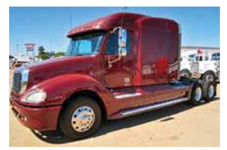
2007 Freightliner CL12064ST Columbia 120, 70 in Mid Roof XT Sleeper; DDC 14.0 Detroit Engine 455 hp; Diesel; Automatic OD;EngineBrake; AirRide; 3.58 Ratio; 22.5 LP Tires; Aluminum Outside Wheels; 230" WB. (7LX08966-TXK-2) $43,880 $43,500