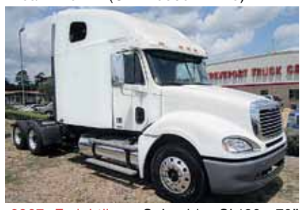
2007 Freightliner Columbia CL120, 70" Sleeper, Detroit Diesel DDC 14.0, 455 HP, 10 Spd, Air Ride Suspension, 3.58 Ratio, 230" WB, 22.5 LP Tires, All Aluminum Wheels, 498,210 Miles. (7LY88971-SHV-2) $42,500 $39,700