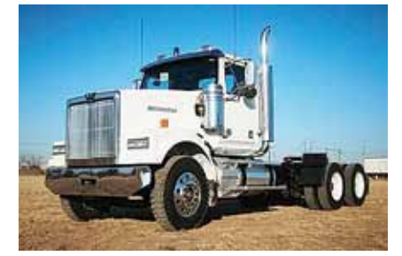
2011 Western Star 4900FA, DD15 Detroit Engine 505 hp; Diesel; 13 Spd OD; Engine Brake; Air Ride Suspension; 4.10 Ratio; 24.5 Tires; Aluminum/Steel Wheels; 230 in Wheelbase; Tandem Axle, 101 Miles. (BPBD5801-SAN-2)