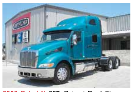
2009 Peterbilt 387, Raised Roof Sleeper; ISX Cummins Engine 475 hp; Diesel; 10 Spd OD; Engine Brake; Air Ride Suspension; LP 22.5 Tires; All Aluminum Wheels; 228 in Wheelbase: Tandem Axle. 405.000 Miles. (9D775287-TEM-1) $75,500 $75,000