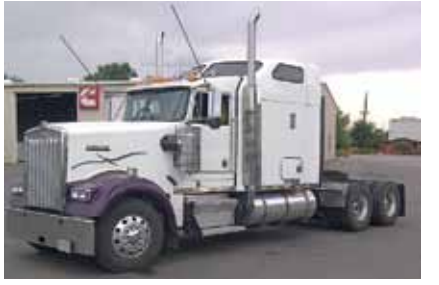
2005 Kenworth W900L, Cummins ISX, 400 HP, 13 Spd, Air Ride Suspension, 3.55 Ratio, 262" Wheelbase, 22.5 Tires, All Aluminum Wheels, 585,550 Miles. (5R075916-FAR-1) $43,900 $43,400