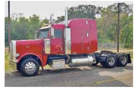
2008 Peterbilt 388, 63 in Mid Roof Sleeper; ISX Cummins Engine 475 hp; Diesel; 13 Spd OD; Engine Brake; Air Ride Suspension; 3.55 Ratio; 22.5 Tires; Aluminum Wheels; Tandem Axle. (8D749997-BRY-2)