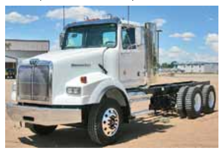
2012 Western Star 4900SA, Cummins ISX, 485 HP, 18 Spd, Tuff Trac Suspension, 4.30 Ratio, 227 in Wheelbase, 24.5 Tires, Aluminum Front Wheels, Steel Rear Wheels, New. (CPBL2661-FAR-2) New