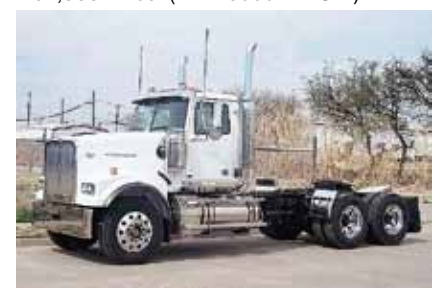
2012 Western Star 4900FA, (Qty: 3) DD15 Detroit Engine 505 hp; Diesel; 10 Spd OD; Engine Brake; Air Ride Suspension; 3.70 Ratio; 11R24.5 Tires; All Aluminum Wheels; 220 in Wheelbase; Tandem Axle, (CPBL2636-WFF-3) New.