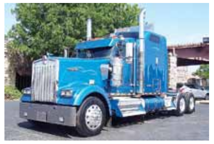
2008 Kenworth W900L, 72" Aerodyne Sleeper; C15 Caterpillar Engine 550 hp; Diesel; 18 Spd OD; Engine Brake; Air Ride; 3.25 Ratio; 24.5 LP Tires; All Aluminum Wheels; 275" Wheelbase, 462,846 Miles. (8R228658-ABL-2) $79,500-$77,500