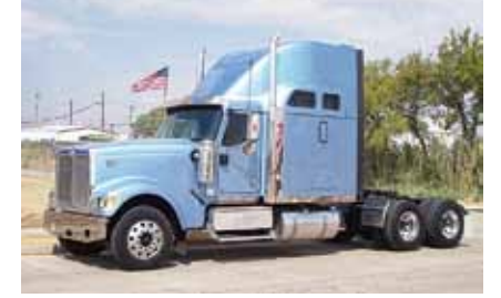
2007 International 9900, Caterpillar C15, 475 HP, 13 Spd, Ratio 3.25, Engine Brake, Air Ride Suspension, 22.5 LP Tires, All Aluminum Wheels, Air Brakes, 626,000 Miles. (7C361212-WFF-1) $47,900