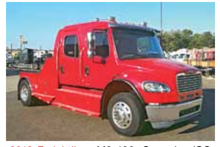
2012 Freightliner M2 106, Cummins ISC, 350 HP, Allison Automatic Transmission, Air Ride Suspension, 4.63 Ration, 195 in Wheelbase, Aluminum Front Wheels, Aluminum Outer Rear Wheels, 22.5 LP Tires, This Crew Cab is Decked Out. New. (CDBE8216-TXK-1) $127,500