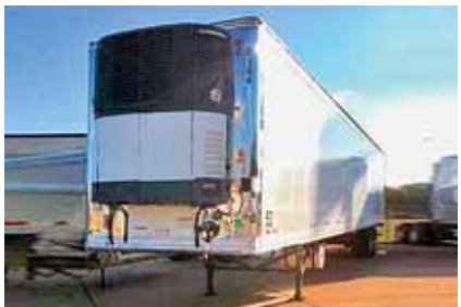
2007 Great Dane Reefer, Air Ride; 53 ft Long x 102 in Wide; Swing Door; Aluminum Floor; 22.5 Tires; Aluminum Outsiders; Sliding Tandem Axle; Stainless Steel Comp; Carrier Reefer; 9034 Hours; Insulated. (7S700812-TXK-TRL-3b)