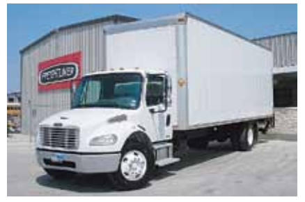
2005 Freightliner M2 106 Medium Duty, 2005 Freightliner M2 106 Medium Duty, Standard Cab; C7 Caterpillar 210 hp; Diesel Automatic; Spring Susp; 24 ft Length; Lift End Gate; Roll up Door; 5.57 Ratio; 22.5 Tires; Steel Wheels; 270" WB; Single Axle, 195,000 Miles. (5HU59464-WAC-1) $26,000 $24,500 www.LonestarTruckGroup.com