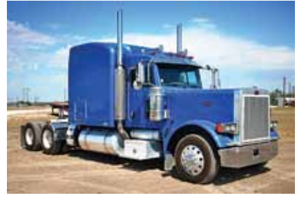
2007 Peterbilt 379, 70" Sleeper, Caterpillar C15, 475 HP, 13 Spd, Air Ride Suspension, 3.25 Ratio, 22.5 Tires, Aluminum Front Wheels, Aluminum Outer Wheels, 737,225 Miles. (7D673921-SAN-1) $48,500