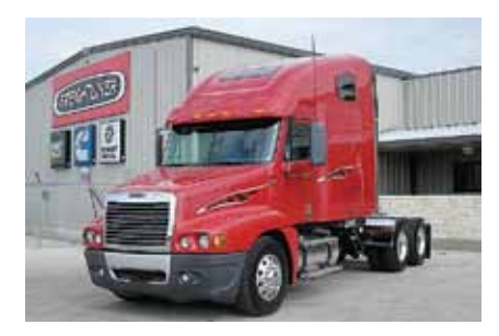
2008 Freightliner CL12064ST Century 120, 70 in Raised Roof Condo; 14.0 Detroit Engine 500 hp; Diesel; 10 Spd OD; Engine Brake; Air Ride Suspension; 3.42 Ratio; LP 22.5 Tires; All Aluminum Wheels; 230 in Wheelbase; Tandem Axle, 559,150 Miles. (8LAB3328-BRY-1) $59,750