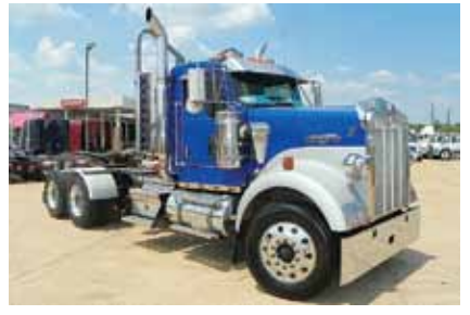
2006 Kenworth W900, C15 Caterpillar Engine 475 hp; Diesel; 18 Spd OD; Engine Brake; Air Ride Suspension; 24.5 Tires; Aluminum Wheels; 235 in Wheelbase; Tandem Axle, 485,000 Miles. (6J110320-TXK-3) <del>$67,500 $65,800</del>