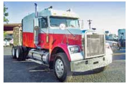
2004 Freightliner FLD12064SD, 70 in Mid Roof Sleeper; DDC 14.0 Detroit Engine 435 hp; Diesel; 10 Spd OD; Engine Brake; Air Ride; 4.11 Ratio; 24.5 Tires; Aluminum/ Steel Wheels; 244 in WB; 704,000 Miles. (4DM19439-ABL-1) $34,500