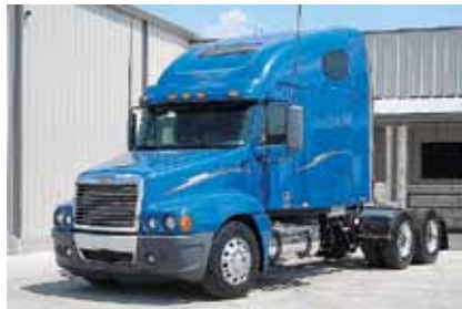
2008 Freightliner CL12064ST Century 120 , 70 in Raised Roof Condo; 14.0 Detroit Engine 500 hp; Diesel; 10 Spd OD; Engine Brake; Air Ride; 3.42 Ratio; LP 22.5 Tires; All Aluminum Wheels; 230" WB; Tandem Axle, 418,000 Miles. (8LAB3433-WAC-3)