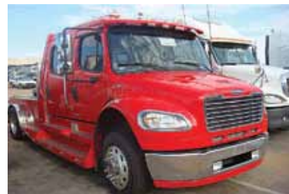
2007 Freightliner RHA114 , Crew Cab; MBE900 330 hp; Diesel; Auto OD; Engine Brake; Air Ride; 4.63 Ratio; 22.5 Tires; Alum-Whls; 187" WB; Singl.Ax; 11,500# Rear Ax Wt; 8,000# Frnt Ax Wt; 56,750 MIs (7HY17249-ABQ-2) $79,500