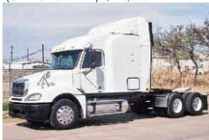
2007 Freightliner CL12064ST Columbia 120, 70" Mid Roof XT Sleeper; Detroit Engine 455 hp; Diesel; 10 Spd; Eng. Brake; Air Ride; 2.62 Ratio; 22.5LP Tires; Alum/Steel Wheels; 230" WB, 554,000 Miles. (7LW17837-WFF-1) $41,500