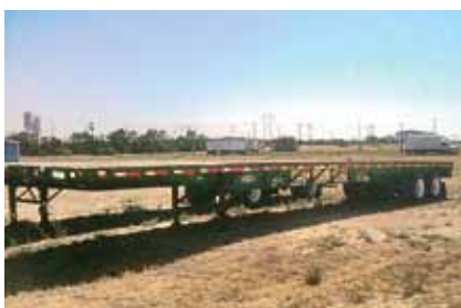
1994 Fontaine , 48' x 102" Flatbed, 22.5 LP Tires, Air Ride Suspension, Hardwood Floors, Nice Trailer with Good Brakes and Tires, Needs a Couple of Boards in Floor. (R1562228-SAN-TRL-3)