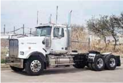
2012 Western Star 4900FA , (Qty: 3) DD15 Detroit Engine 505 hp; Diesel; 10 Spd OD; Engine Brake; Air Ride Suspension; 3.70 Ratio; 11R24.5 Tires; All Aluminum Wheels; 220 in Wheelbase; Tandem Axle, New. (CPBL2636-WFF-3)