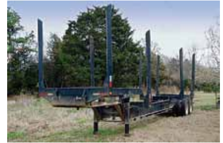
1998 Galyean 4-Bunk Log , Spring Suspension; 40 ft Length; 24.5 Tires; Steel Disc Wheels; Fixed Tandem Axle; Steel Composition; Call for more details. (WHO15604-TXK-TRL-3b) $10,000