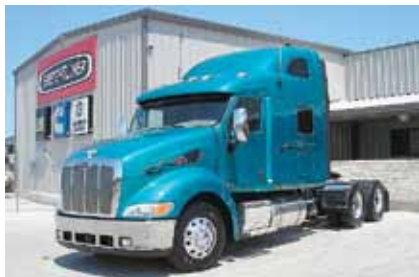
2009 Peterbilt 387, Raised Roof Sleeper; ISX Cummins Engine 475 hp; Diesel; 10 Spd OD; Engine Brake; Air Ride Suspension; LP 22.5 Tires; All Aluminum Wheels; 228 in Wheelbase; Tandem Axle, 405,000 Miles. (9D775287-TEM-1) $75,500