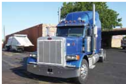
2007 Peterbilt 379 , Caterpillar C15, 475 HP, 13 Spd, Engine Brake, 3.25 Ratio, Air Ride Suspension, 265 Wheelbase, 22.5 LP Tires, Aluminum Front Wheels, Aluminum Outer Wheels, 737,225 Miles. (7D673921-SAN-2)