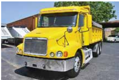
1999 Freightliner CL11264S Columbia 112 Dump, C12 Caterpillar Engine 350 hp; Diesel; 10 Spd; Engine Brake; Air Ride; 2.92 Ratio; 22.5 LP Tires; Aluminum Outside Wheels; 210 in Wheelbase, 821,000 Miles, Fresh Engine Overhaul. (XLA63093-ABL-1) $28,500