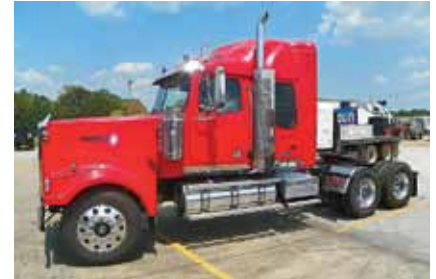
2007 Western Star 4900 , 36 in Hi Rise Sleeper; DDC 14.0 Detroit Engine 500 hp; Diesel; 10 Spd OD; Engine Brake; Air Ride; Aluminum Outside Wheels; 232 in Wheelbase; Tandem Axle, 398,645 Miles. (7PY55249-TXK-2) $64,880 $64,500