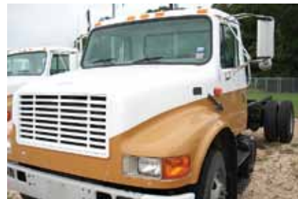
2000 International 4000. International T444E Engine, 210 HP, Spring Suspension, 209" Wheelbase, 22.5 LP Tires, Steel Wheels, Air Brakes, 150,000 Miles. (YH674367-BRY-1) $8,500 $6,300