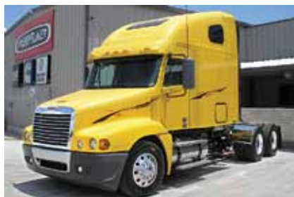
2008 Freightliner C12064ST Century 120 , 70 in Raised Roof Condo; 14.0 Detroit Engine 500 hp; Diesel; 10 Spd OD; Engine Brake; Air Ride; 3.42 Ratio; LP 22.5 Tires; Aluminum Wheels; 230" WB; Tandem Axle, 475,000 Miles. (8LAB3321-BRY-3)