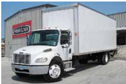
2005 Freightliner M2 106 Medium Duty, Standard Cab; C7 Caterpillar 210 hp; Diesel Automatic; Spring Susp; 24 ft Length; Lift End Gate; Roll up Door; 5.57 Ratio; 22.5 Tires; Steel Wheels; 270" WB; Single Axle, 195,000 Miles. (5HU59464-WAC-1) $26,000 $25,500