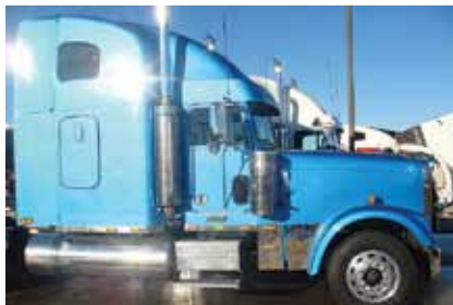
2007 Freightliner FLD132 Classic XL, Detroit Diesel DDC 14.0, 515 HP, 10 Spd, Engine Brake, Air Ride Suspension, 260" Wheelbase, 22.5 Tires, All Aluminum Wheels, Air Brakes, 555,032 Miles. Old (7DW78435-ABQ-1) $48,400 $44,900