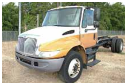
2003 International 4000 Series , Intl VT 365 Engine, 210 HP, Allison Automatic Transmission, Spring Suspension, 209 in Wheelbase, 138" Clear back of cab to center of axle, 71" Overhang, 195,000 Miles. (3N57943-BRY-2)