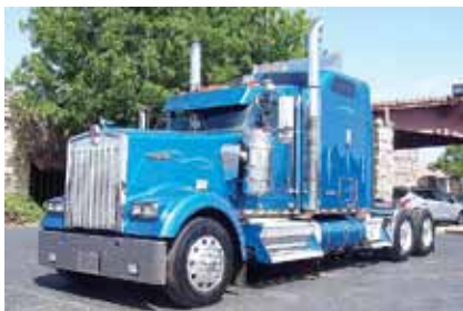
2008 Kenworth W900L , 72" Aerodyne Sleeper; C15 Caterpillar Engine 550 hp; Diesel; 18 Spd OD; Engine Brake; Air Ride; 3.25 Ratio; 24.5 LP Tires; All Aluminum Wheels; 275" Wheelbase, 462,846 Miles. (8R228658-ABL-2) $79,500