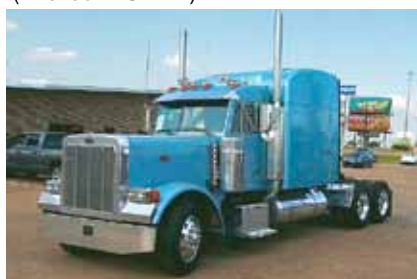
2004 Peterbilt 379 , 63 in Stand Up Sleeper; C15 Caterpillar Engine 435 hp; Diesel; 13 Spd OD; Engine Brake; Low Air Suspension; 22.5 LP Tires; All Aluminum Wheels; 265" WB; Tandem Axle. Carrier APU Unit. (4D819827-SHV-3) $31,800

See a complete inventory of new and used trucks and trailers online at: www.LonestarTruckGroup.com