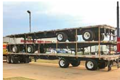
2000 Utility Flat Bed, 48" x 102, Air Ride Suspension, Aluminum Floor, Wide Spread Air Ride, Set Forward Suspension. Sliding Winches, 22.5 LP Tires. (YA931330-SHV-TRL-1A) $Call For Price