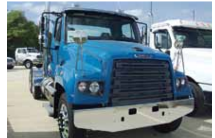
2012 Freightliner 114SD , Detroit Diesel D13, 450 HP, 10 Spd, Air Ride Suspension, 3.70 Ratio, 210 in Wheelbase, Steel Front - Aluminum All Rear, 24.5 LP Tires, Warranty - Ask for Details. New. (CHBK1589-TYL-3) $111,880