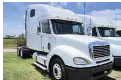
2007 Freightliner Columbia CL120, 70" Raised Roof Condo Sleeper, Detroit Diesel DDC 14.0, 455 HP, 10 Spd, Air Ride Suspension, 3.58 Ratio, 230" Wheelbase, 22.5 LP Tires, All Aluminum Wheels, 207,650 Miles. (7LY88990-SHV-1) $41,000