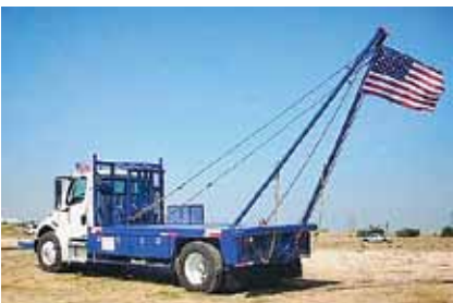
2005 Freightliner Business Class M2 106, Diesel Caterpillar Engine 190 hp; Diesel Fuel Type; 6 Spd; Spring Suspension; 4.11 Ratio; 22.5 Tires; All Steel Wheels; Single Axle; 15 ft Length; 17,500 lb Rear Axle Weight; 8,000 lb Front Axle Weight. (2005 White Gang SAN-1) $59,500