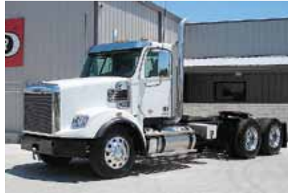
2012 Freightliner CC12264 Coronado SD , DD 15 Detroit Engine 505 hp; Diesel; 10 Spd OD; Engine Brake; Air Ride; 3.55 Ratio; 11R 14.5 Tires; Aluminum/Steel Wheels; 215 in Wheelbase; Tandem Axle, New. (CDBH0752-TEM-3)