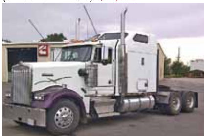
2005 Kenworth W900L , Cummins ISX, 400 HP, 13 Spd, Air Ride Suspension, 3.55 Ratio, 22.5 Tires, All Aluminum Wheels, 585,550 Miles. (5R075916-FAR-2)