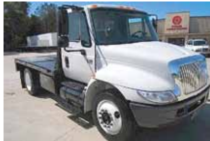
2007 International 400 Medium Duty , Standard Cab; DT466 International Engine 215 hp; Automatic; Diesel Fuel Type; Nice Clean Flatbed Truck, 307,423 Miles. (7H525170-TYL-2) $24,877