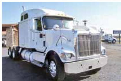
2006 International 9900i , 72 in Mid Roof Sleeper; ISX Cummins Engine 435 hp; Diesel; 10 Spd OD; Engine Brake; Air Ride Suspension; 22.5 Tires; Aluminum Outside Wheels; 260" WB, 722,500 Miles. (6C331036-ABL-3) $37,500