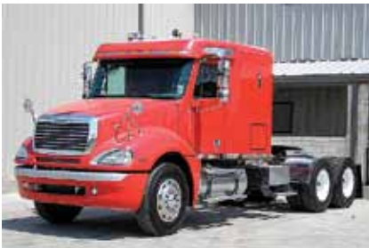
2006 Freightliner CL12064ST Century 120 , 58" Mid Roof Sleeper; Mercedes Engine 450 hp; Diesel; 10 Spd OD; Engine Brake; Air Ride; 3.58 Ratio; 11R 24.5 Tires; All Aluminum Wheels; 230" WB; Tandem Axle, 515,000 Miles. (6DW80886-WAC-2)