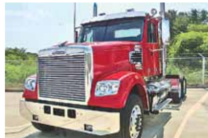
2012 Freightliner Coronado SD, Cummins ISX, 500 HP, 10 Spd, 3.70 Ratio, 220 in Wheelbase, Aluminum Front Wheels, Aluminum Outer Wheels, 24.5 LP Tires, Warranty - Ask for Details. New. (CDBK0286-TYL-1) $120,417