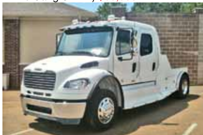
2012 Freightliner M2 106, Cummins ISC, 350 HP, Allison Automatic Transmission, Air Ride Suspension, 4.63 Ratio, 195 in Wheelbase, Aluminum Front Wheels, Aluminum Outer Rear Wheels, 22.5 LP Tires, This Crew Cab is Decked Out. New. (CDBE8216-TXK-1) $127,500