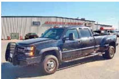
2006 Chevrolet 3500 LT Duty Truck , Crew Cab; Duramax Chevy Eng 360 hp; Diesel; 120,000 mi; OD; 16 Tires; Single Axle; Ranch-Hand-bumpers, Warn-winch, leather-heated-memory-seats, -Bose-sound, 4x4 Onstar, gooseneck ball/fifth. (6F109434-ABQ-3) $27,900