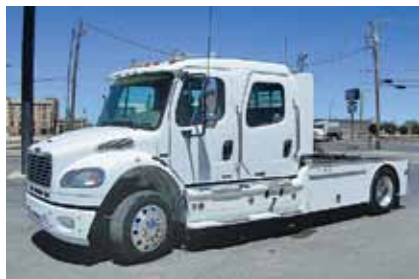
2007 Freightliner M2 Mercedes MBE 300 , 300 HP, Allison Automatic Transmission, Air Ride, 22.5 Tires, Aluminum Wheels, Air Brakes, Schwalbe Conversion, Loaded, Leather Seats, Great Sound System, DVD Player, 28,000 Miles. (7HY38622-FAR-3)