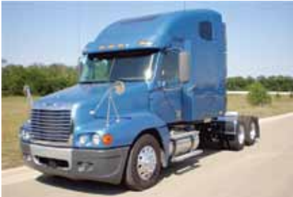
2008 Freightliner CL12064ST Century 120 , 70 in Raised Roof Condo; Diesel; 10 Spd OD; Engine Brake; Air Ride Suspension; 3.42 Ratio; LP 22.5 Tires; All Aluminum Wheels; 230 in Wheelbase; Tandem Axle, 542,000 Miles. (8LW48880-TEM-2)