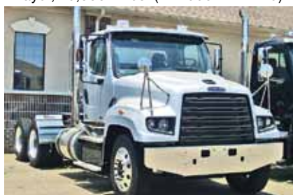
2012 Freightliner 114SD , Detroit Diesel D13, 450 HP, 10 Spd, Air Ride, 3.70 Ratio, 210" WB, 24.5 LP Tires, All Aluminum Wheels, Warranty - Ask For Details. New. (CHBK1591-SHV-2) $110,917