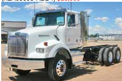
2012 Western Star 4900SA, Cummins ISX, 485 HP, 18 Spd, Tuff Trac Suspension, 4.30 Ratio, 227 in Wheelbase, 24.5 Tires, Aluminum Front Wheels, Steel Rear Wheels, New. (CPBL2661-FAR-1) $130,998