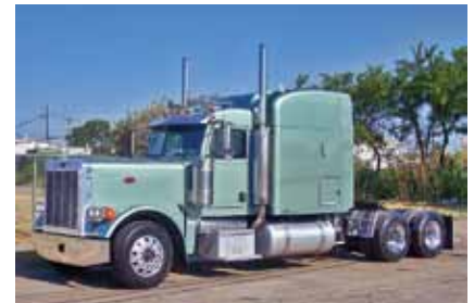
2007 Peterbilt 379 EXT , Caterpillar C15, 475 HP, 13 SPD, 70" Sleeper, Air Ride Suspension, 3.25 Ratio, 265" Wheelbase, Aluminum Front Wheels, Aluminum Outer Rear, 22.5 LP Tires, 760,000 Miles. (7D673941-WFF-2)