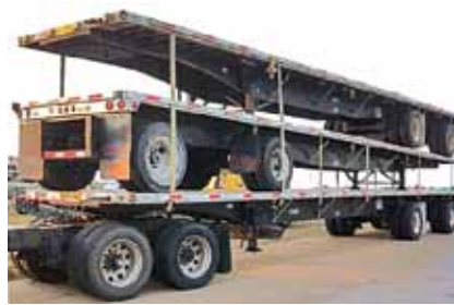
2004 Utility Flat Bed , Air Ride Suspension; 48 ft Length x 102 in Width; Aluminum Floor; 22.5 LP Tires; Steel Disc Wheels; Spread Axle; Combination Composition, WSAR Financing Available. (4A304604-TYL-TRL-3b)