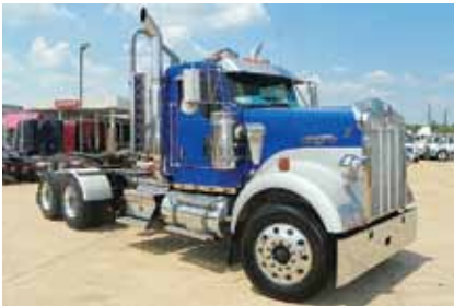
2006 Kenworth W900 , C15 Caterpillar Engine 475 hp; Diesel; 18 Spd OD; Engine Brake; Air Ride Suspension; 24.5 Tires; Aluminum Wheels; 235 in Wheelbase; Tandem Axle, 485,000 Miles. (6J110320-TXK-3) $67,500