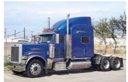
2007 Peterbilt 379X, Cummins ISX, 475 HP, 13 Spd, 70" Stand Up Sleeper, Engine Brake, Air Ride Suspension, 265" Wheelbase, 24.5 LP Tires, All Aluminum Wheels, Air Brakes, Long & Tall, Big Power, 744,444 Miles. (7N667868-WFF-2)