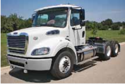
2011 Freightliner Business Class M2 112, DD 13 Detroit Engine 450 hp; 10 Spd OD; Diesel; Engine Brake; 4 Bag Air Ride Suspension; 3.73 Ratio; LP 22.5 Tires; 175 in Wheelbase, New. (BDAW8771-TEM-2) $99,750