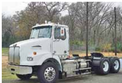
2011 Western Star 4900SA, DD 13 Detroit Engine 450 hp; 10 Spd OD; Diesel; Engine Brake; Air Ride Suspension; 3.55 Ratio; 11R 24.5 Tires; Aluminum/Steel Wheels; 200 in Wheelbase; Tandem Axle. New (8LY44929-BRY-2)