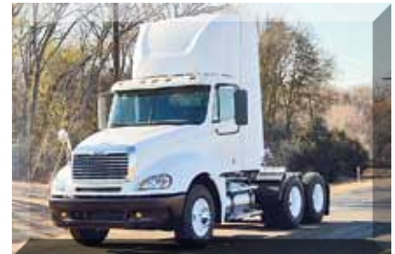
2005 Freightliner CL12064ST Columbia 120, 14.0 Detroit Engine 470 hp; 606,000 mi; Diesel; 10 Spd OD; Engine Brake; Air Ride Suspension; 3.70 Ratio; 11 R 22.5 Tires; Steel Disc Wheels; 171 in Wheelbase (5LU94874-BRY-1) $35,500 $33,900