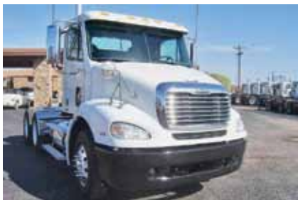
2007 Freightliner CL11264S - Columbia 112, MBE4000 Mercedes Engine 350 hp; Diesel; 10 Spd OD; Engine Brake; Air Ride; 3.58 Ratio; 22.5 Tires; Aluminum/Steel Wheels; 162 in Wheelbase; 169,000 Miles. (7LX20900-ABL-2) $48,500