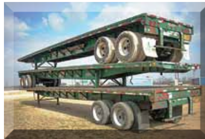
1994 Fontaine Flatbed, 4' x 102", Steel Wheels, 11R22.5 Tires, Air Ride Suspension, Hardwood Floor, Excellent trailer for the money. Good Brakes and drums, decent rubber. R1562241-SAN-TRL-1) $8,250