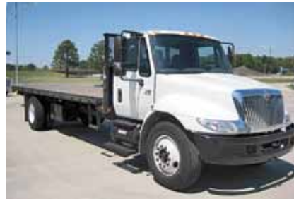
2005 International DT466, 210 HP, Allison Automatic Transmission, 24' Flat Bed, Spring Suspension, 254" Wheelbase, 22.5 LP Tires, Steel Wheels, 172,110 Miles. (5H119781-SHV-3)

See a complete inventory of new and used trucks and trailers online at: www.LonestarTruckGroup.com