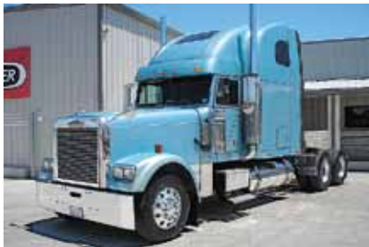
2003 Freightliner FLD13264T Classic XL, 70 in Raised Roof Condo; 12.7 Detroit 500 hp; Diesel; 13 Spd OD; Engine Brake; Air Ride; 3.70 Ratio; LP 22.5 Tires; Aluminum Wheels; 260 in Wheelbase; Tandem Axle, 855,000 Miles. (3DK57543-WAC-3)