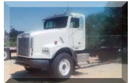
2001 Freightliner Tractor, Caterpillar, 450 HP, 15 Spd, Air Ride, 20,000 lb. Front Axle Weight, 46,000 lb. Rear Axle Weight. (1LJ15337-TYL-1) $41,500 $39,500