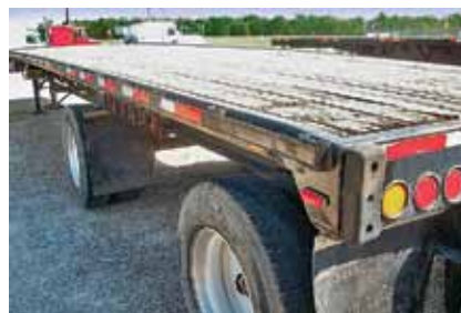
2001 Transcraft Flat Bed, Air Ride Suspension; 48 ft Length x 102 in Width; Apitong Floor; Steel Composition. (Y1063705-BRY-TRL-3)