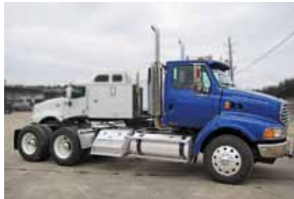
2007 Sterling LT 9500 Tractor, Mercedes MBE4000, 10 Spd, Air Ride Suspension, 24.5 Tires, Aluminum Front Wheels, Steel Rear Wheels, 240,120 Miles. (7AX44104-SHV-2) $39,500