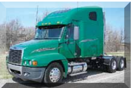
2008 Freightliner C12064ST Century 120, 70 in Raised Roof Condo; 14.0 Detroit Engine 500 hp; 10 Spd OD; Engine Brake; Air Ride Suspension; 3.42 Ratio; 22.5 Tires; All Aluminum Wheels; 230 in Wheelbase; Tandem Axle, 462,900 Miles. (8LW48831-WAC-1) $62,750 $58,000