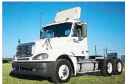
2004 Freightliner , CL12064ST Columbia 120, Series 60 Detroit Engine 470 hp; 10 Spd OD; Diesel; Engine Brake; Air Ride; 3.70 Ratio; 22.5 TALL Tires; All Steel Wheels; 171" WB; Tandem Axle; 581,000 Miles. (4LM09963-SAN-2) $29,500