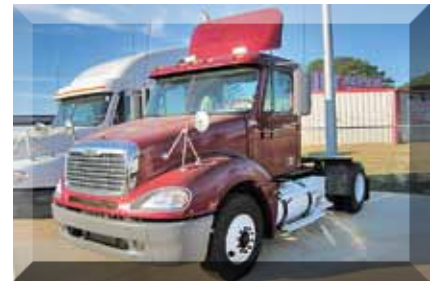
2004 Freightliner CL120, Detroit Diesel DDC 12.7, 375 HP, 10 Spd, 166" Wheelbase, 22.5 LP Tires, Steel Wheels. Hard to find single axle. Lease maintained. 552,120 Miles. (4LN05762-SHV-1) $22,500