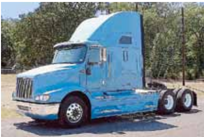
2003 International 9200, 60 in Mid Roof Sleeper; ISX Cummins 450 hp; Diesel; 10 Spd OD; Engine Brake; Air Ride; 3.55 Ratio; LP 22.5 Tires; Aluminum/Steel Wheels; 220 in Wheelbase; Tandem Axle, 815,000 Miles. (3N054822-WAC-2)