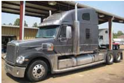
2007 Freightliner CC13264 Coronado, 70" Condo Sleeper, DDC 14.0 Detroit Engine, 515 HP, 13 Spd Overdrive, Engine Brake, Air Ride Suspension, All Aluminum Wheels, Tandem Axle, 596,330 Miles. (7PY2309-TYL-2)