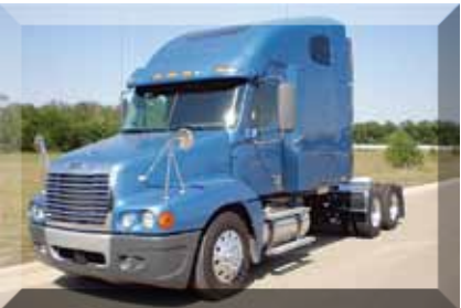
2008 Freightliner C12064ST Century 120, 70 in Raised Roof Condo; Diesel; 10 Spd OD; Engine Brake; Air Ride Suspension; 3.42 Ratio; LP 22.5 Tires; All Aluminum Wheels; 230 in Wheelbase; Tandem Axle, 542,000 Miles. (8LW48880-TEM-1) $57,500