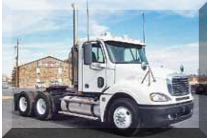
2007 Freightliner CST12064 Century 120, DDC 14.0 Detroit Engine 455 hp; 10 Spd OD; Diesel; Engine Brake; Air Ride Suspension; 3.70 Ratio; 22.5 LP Tires; All Steel Wheels; 171 in Wheelbase, 717,000 Miles. (7LX77661-ABL-1) $34,500