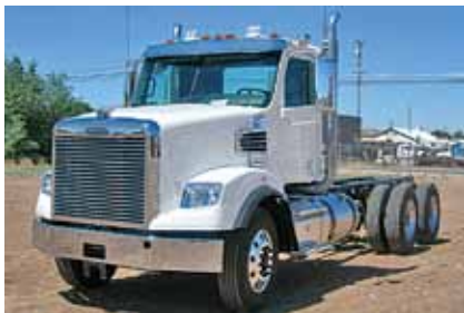
2011 Freightliner Coronado, Detroit DD15, 475 HP, 10 SPD, Engine Brake, Tuff Trac Susp, 227" WB, Air Brakes, Tire Size 24.5, Dual Locking Differentials, Aluminum Outers, Zero Miles. (BDAW9999-FAR-2) $119,500 $119,000