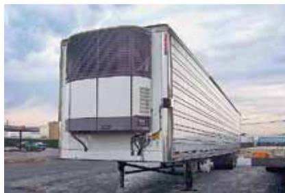
2005 Utility Reefer, Air Ride Suspension; 53 ft Length x 102 in Width; Swing Door; Aluminum Floor; 11R22.5 Tires; Aluminum Outside Wheels; 12,000 hours on Carrier Unit!!; (5M661611-ABL-TRL-3) $24,500