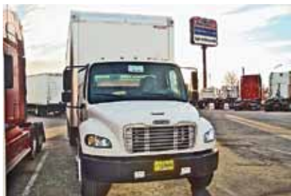
2005 Freightliner M2 Business Class 26' Box Van, Caterpillar C7, 210 HP, 6 Spd, Spring Suspension, 22.5 Tires, Steel Wheels, Air Brakes, 26,000 Miles. (5HU78836-ABQ-3) $32,900