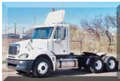
(Qty: 2) 2005 Freightliner CL12064ST Columbia 120, Detroit 490 hp; Diesel; 10 Spd OD; Engine Brake; Air Ride; 3.90 Ratio; 11R22.5 Tires; Steel Wheels; 183" WB, 612,000 Miles & 597,751 Miles. (5LU68685-WFF-1) $35,900