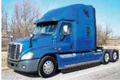
(2011 Freightliner CA12564SPL Cascadia, 72 in Raised Roof Condo; DD 15 Detroit Engine 455 hp; Diesel; 500 mi; 10 Spd OD; Engine Brake; Air Ride; 3.42 Ratio; LP 22.5 Tires; Aluminum Wheels; 232 in Wheelbase. New BSBD1639-TEM-3)