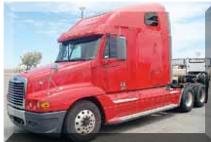
2005 Freightliner CL12064ST Century 120, 70 in Double Deck Condo; 14.0 Series 60 Detroit 515 hp; Diesel; Ultrashift OD; Engine Brake; Air Ride; 3.58 Ratio; 22.5 Tires; Aluminum Outsiders; 224 in WB, 463,100 Miles. (5LU78322-ABQ-1) $42,900