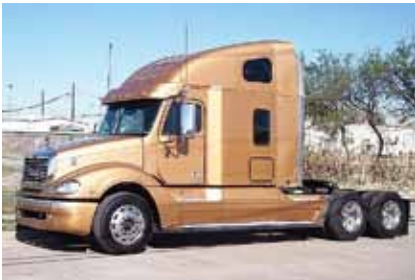
2007 Freightliner CL12064ST Columbia 120, 70 in Raised Roof Condo; Detroit 490 hp; Diesel; 10 Spd OD; Engine Brake; Air Ride; 3.42 Ratio; 24.5LP Tires; All Aluminum Wheels; 235 in Wheelbase; Tandem Axle; 471,000 Miles. (7LX50736-WFF-3)