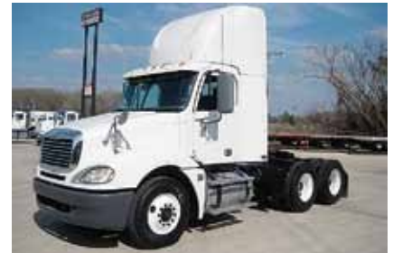
2005 Freightliner CL12064S Columbia 120, 14.0L Detroit Engine 455 hp; 10 Spd OD; Diesel; 4 Bag Air Ride Suspension; 3.70 Ratio; 22.5LP Tires; All Steel Wheels; 171 in Wheelbase; Tandem Axle, 552,312 Miles. (5LN76723-TYL-3)