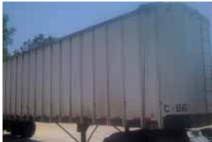
2008 Peerless Open Top Chip Trailer. 42' x 96", 112R24.5 Tires, Aluminum Floor, Top Swing Gate. (JPJ11670-TYL-TRL-3b) $9,500