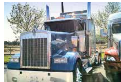
2008 Kenworth W900L, Caterpillar C15, 550 HP, 18 Spd, Mid Roof Sleeper, Engine Brake, Air Ride Suspension, 265" Wheelbase, 24.5 Tires, All Aluminum Wheels, Air Brakes, 455,285 Miles. (8R228072-ABQ-2) $79,500