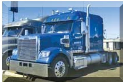
2011 Freightliner Coronado 122, Detroit Diesel DD15, 475 HP, 10 Spd, Air Ride Suspension, 249" Wheelbase, Aluminum Front Wheels, Steel Rear Wheels, 24.5 LP Tires. New. (BDBB1433-TXK-1) $127,899