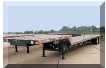
2006 Transcraft Combo Drop Deck, 53' x 102", Air Ride; 22.5 LP Tires; Alum. sides & floor, (4) Apitong nail strips, (25) pair of D-Rings in floor, Winch track drivers side (15) sliding winches. Alum. tool box, Ramp Brackets. (61080537-SHV-TRL-1A) $29,500