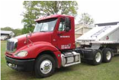
2003 Freightliner CL120 Tractor, Detroit Diesel DDC 12.7, 430 HP, 10 Spd, Air Ride Suspension, 171" Wheelbase, Steel Wheels, 22.5 LP Tires, 517,321 Miles. (3LK55310-TXK-3)