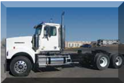
2011 Western Star 4900FA, Detroit DD15, 505 hp; 13 Spd; Diesel; Engine Brake; AirLiner Susp; 4.10 Ratio; 24.5 Tires; Aluminum/Steel Wheels; 230" WB; 14,600 lb Front Axle Weight; 46,000 lb Rear Axle Weight. New (8PBD1894-FAR-1) $128,900