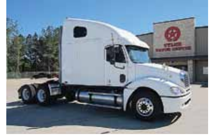
2004 Freightliner CL12064ST Columbia 120, 70 in Condo Sleeper; C15 Caterpillar 435 hp; 10 Spd OD; Engine Brake; Air Ride; 3.58 Ratio; 22.5 LP Tires; Aluminum/Steel Wheels; 230 in WB; Tandem Axle, 628,700 Miles. (4LN14441-TXK-2)