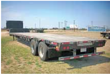
2006 Transcraft Drop Deck, 48" x 102', Steel Wheels, 22.5 LP Tires, Hardwood Floor, Hard to find closed tandem drop deck. Ready to make you some money. (61081465-SAN-TRL-3)