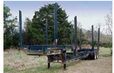
1998 Galyean 4-Bunk Log, Spring Suspension; 40 ft Length; 24.5 Tires; Steel Disc Wheels; Fixed Tandem Axle; Steel Composition; Call for more details. (WHO15604-TXK-TRL-3b) $10,000