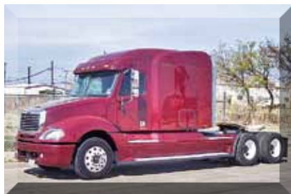
2005 Freightliner Columbia CL120 , Detroit Diesel S60, 455 HP, Mid Roof Sleeper, 10 Spd., 240" Wheelbase Engine Brake, Air Ride Suspension, 646,000 Miles. (5LN70034-WFF-1) $29,900