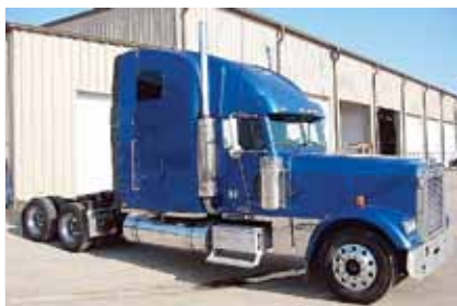
2006 Freightliner FLD13264T Classic XL, 70 in Condo Sleeper; C15 Caterpillar 435 hp; 13 Spd OD; Engine Brake; 4 Bag Air Ride; 3.55 Ratio; 22.5LP Tires; All Aluminum Wheels; 259" WB; Tandem Axle, 435,321 Miles (6DU26013-TYL-2)