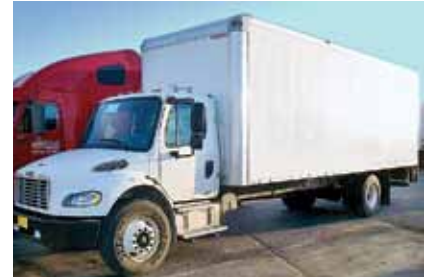
2007 Freightliner M2 106; C7 Cat 210 hp; Diesel; 6 Spd; Spr Susp; 26' Box; Lift End Gate; Roll up Door; 4.11R; 22.5 Tires; Steel Whls; 270" WB; 19,000# Rear Ax Wt; 10,000# Frnt Ax Wt, 84,903 Miles. (7HY30138-ABQ-2) $38,900 $37,900