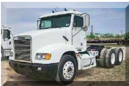
1996 Freightliner FLC12064ST , M11 DIESEL Cummins Engine 330 hp; 10 Spd OD; Diesel; Spring Suspension; 22.5 LP Tires; Aluminum/Steel Wheels; Tandem Axle. (TP870032-SAN-1) $8,995