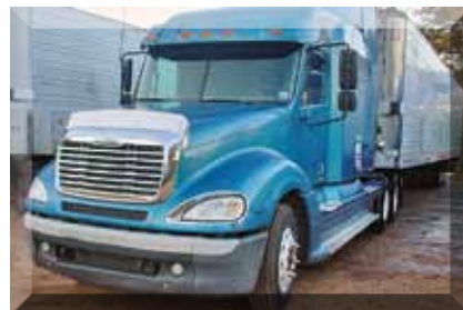
2005 Freightliner Columbia CL120 , Mercedes MBE4000, 10 Spd, Exhaust Brake, Air Ride Suspension, 230" Wheelbase, 22.5 Tires, Aluminum Front Wheels, Steel Rear Wheels, 768,650 Miles. (5LU23237-TYL-1) $20,500 $18,500