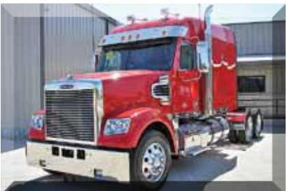
2012 Freightliner CC122 Coronado , Detroit DD15, 505 HP, 13 Spd, Mid Roof Sleeper, Engine Brake, Air Ride, 250" WB, 24.5 LP Tires, Aluminum Front Wheels, Aluminum Outer Wheels. New. (CD-BE0406-TEM-1) $129,850