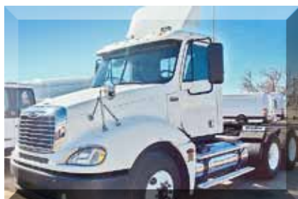
2005 Freightliner CL12064ST Columbia 120 , Series 60 Detroit 455 hp; 10 Spd OD; Diesel; Engine Brake; Air Ride Susp; 3.70 Ratio; 22.5 Tires; All Steel Wheels; 270" WB; Tandem Axle; 341,983 Miles. (5LN37258-ABQ-1) $43,900 $42,900