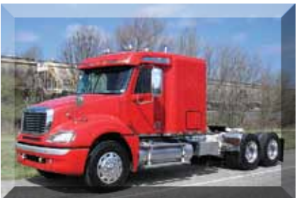
2007 Freightliner CL120 Columbia , Mercedes MBE4000, 58" Mid Roof Sleeper, 10 Sp Transmission, Engine Brake, Air Ride Suspension, 230" Wheelbase, 22.5 LP Tires, All Aluminum Wheels, 371,900 Miles. (7DY4141-WAC-1) $44,600