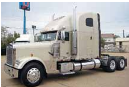
2007 Freightliner FLD13264T Classic XL, 70 in Condo; C15 Caterpillar 475 hp; 10 Spd OD; Engine Brake; 4 Bag Air Ride; 3.58 Ratio; 24.5 Tires; All Aluminum Wheels; 259 in Wheelbase; Tandem Axle, 770,320 Miles. (7DY62418-TXK-3)