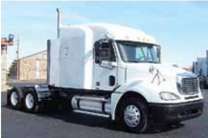
(4) 2006 Freightliner CL12064S Columbia 120, 70 in Mid Roof XT Sleeper; DDC 14.0 Detroit Engine 455 hp; 10 Spd OD; Engine Brake; Air Ride Susp; 2.62 Ratio; 22.5 LP Tires; Aluminum/Steel Wheels; 230" WB, 652,662 Miles. (6LN84364-ABL-2) $34,900