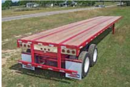
2010 Clark Flat Bed, Air Ride; 48 ft Length x 102 in Width; Apitong Floor; All Steel Wheels; Tandem Axle; Steel Composition; Air ride slide. Price includes FET. -0- Down with approved credit. (AA009844-TYL-TRL-2) $23,115