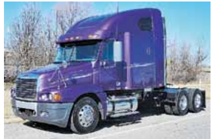
2007 Freightliner CST 12064 Century 120, 70 in Hi-Style Sleeper; Detroit Engine 500 hp; Diesel; 10 Spd OD; Engine Brake; Air Ride; 3.42 Ratio; 22.5 LP Tires; All Aluminum Wheels; 230 in Wheelbase, 514,000 Miles. (7LW48219-BRY-3)