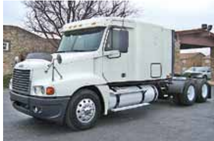
2005 Freightliner CST120 Century Tractor, Detroit DDC 14.0, 455 HP, 70" Midroof, 10 SPD, Air Ride Suspension, Wheelbase 232", 22.5 LP Tires, Aluminum Front Wheels, Steel Rear Wheels, 762,000 Miles. (5LM61824-ABL-3) $28,500 $25,000