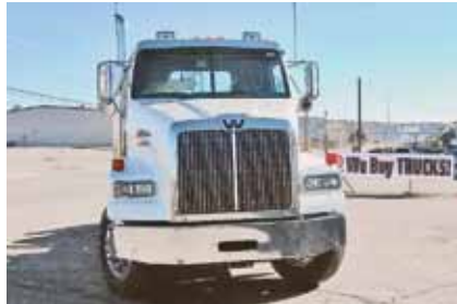
2011 Western Star 4900SA, Detroit 450 hp; 13 Spd; Diesel; Engine Brake; AirLiner Susp; 4.11 Ratio; 24.5 Tires; Aluminum/Steel Wheels; 210 in WB; 14,600 lb Front Axle Weight; 46,000 lb Rear Axle Weight, New. (8PBD1891-FAR-3)