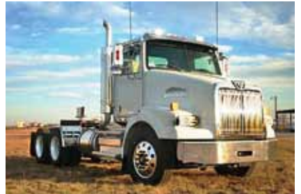
2011 Western Star 4900SA, Detroit Diesel D13, 450 HP, Air Ride Suspension, Engine Brake, 195" Wheelbase, 24.5 Tires, Aluminum Front Wheels, 2 YR/200,000 Mile Warranty. New. (BPAX8557-SAN-2)