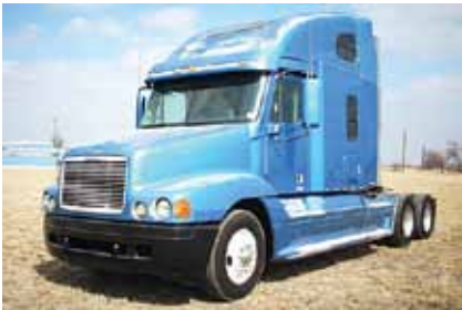
1998 Freightliner Conventional Tractor, 70" Sleeper, DDC 12.7 Detroit Engine, 470 HP, 10 Spd, Air Ride Suspension, New Turbo, 80% Virgin Drive Tires, 845,000 Miles. (WP890869-SAN-3)