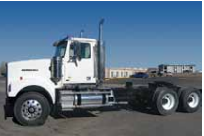
2011 Western Star 4900FA, Detroit DD15, 505 hp; 13 Spd; Diesel; Engine Brake; AirLiner Susp; 4.10 Ratio; 24.5 Tires; Aluminum/Steel Wheels; 230" WB; 14,600 lb Front Axle Weight; 46,000 lb Rear Axle Weight. New (8PBD1894-FAR-2)