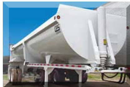
2010 CPS End Dump , Spring Suspension; 32 ft Length; Frame; 11r24.5 Tires; 32" Half Round. Ar450 Material. Single Point Suspension. High Lift Tail Gate. Price includes FET. Financing Available W.A.C. (AP011086-TYL-TRL-1A) $33,900