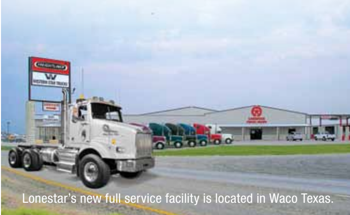
Lonestar's new full service facility is located in Waco Texas.