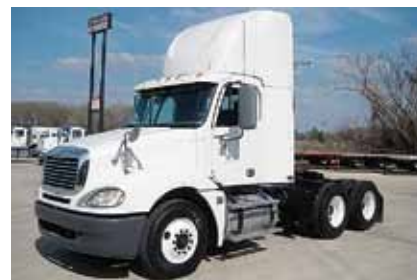
2005 Freightliner CL12064S Columbia 120, 14.0L Detroit Engine 455 hp; 10 Spd OD; Diesel; 4 Bag Air Ride Suspension; 3.70 Ratio; 22.5LP Tires; All Steel Wheels; 171 in Wheelbase; Tandem Axle, 552,312 Miles. (5LN76723-TYL-3)