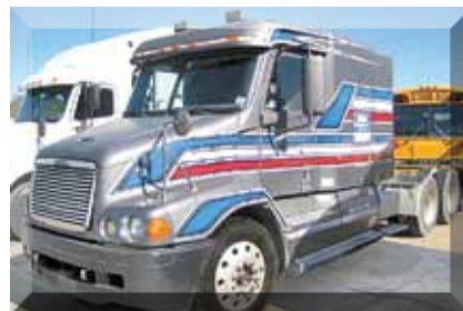
1998 Freightliner Century , 410 HP, 9 Spd., Air Ride Suspension, 230" Wheelbase, 22.5 LP Tires, All Aluminum Wheels. (WL774981-SHV-1) $8,000 $7,000