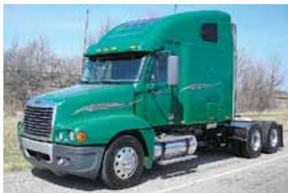
2008 Freightliner CL12064ST Century 120, 70 in Raised Roof Condo; 14.0 Detroit 500 hp; 10 Spd OD; Engine Brake; Air Ride; 3.42 Ratio; 22.5 Tires; All Aluminum Wheels; 230 in Wheelbase; Tandem Axle, 367,350 Miles. (8LW48879-TEM-3)