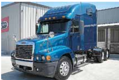
2008 Freightliner CL12064ST 120, 70 in Raised Roof Condo; 14.0 Detroit Engine 500 hp; Diesel; 10 Spd OD; Engine Brake; Air Ride; 3.42 Ratio; 22.5 Tires; All Aluminum Wheels; 230" WB; Tandem Axle, 411,650 Miles. (8LY44931-TEM-2)