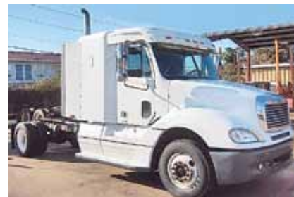
2003 Freightliner CL12042ST Columbia 120, 48" Mid Roof; C15 Caterpillar 435 hp; 10 Spd OD; AirRide; 3.55; 22.5LP Tires; Steel Wheels; 200" WB, Single Axle; 12,000# Front Axle Wt; 23,000# Rear Axle Wt, 901,213 Miles. (3LL00668-TXK-2)