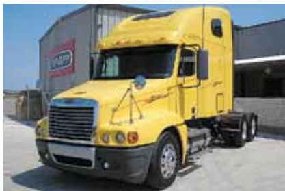
2008 Freightliner CL12064ST Century 120, 70 in Raised Roof Condo; 14.0 Detroit 500 hp; Diesel; 10 Spd OD; Engine Brake; Air Ride; 3.42 Ratio; 22.5 Tires; All Aluminum Wheels; 230" WB; Tandem Axle; 405,750 Miles. (8LAA3445-WAC-2)