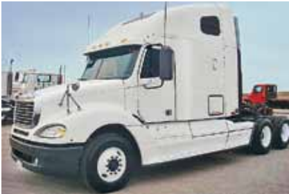
2007 Freightliner CL12064ST Columbia 120, 70 in Double Deck Condo; Series 60 Detroit 455 hp; Diesel; 10 Spd OD; Engine Brake; Air Ride; 3.70 Ratio; 22.5 Tires; Steel Wheels; 232" WB; 618,197 Miles. (7LX77858-ABQ-3) $34,900