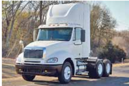
2005 Freightliner CL12064ST Columbia 120, 14.0 Detroit Engine 470 hp; 10 Spd OD; Diesel; Engine Brake; Air Ride Suspension; 3.70 Ratio; 11 R 22.5 Tires; Steel Disc Wheels; 171 in Wheelbase, 606,000 Miles. (5LU94874-BRY-2)