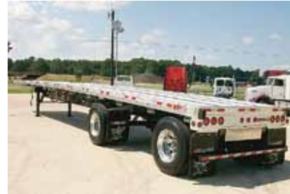
2009 Manac CFB48 Flat Bed, Air Ride; 48"x102"; Aluminum Floor; 24.5LP Tires; Aluminum Outers; Tandem Axle; Comb. Composition; Sprd Axle, Cargo Hands, Chain Ties, Galv. Steel Cross Members. (9K010502-TYL-TRL-3b) $24,200 Incl. FET.