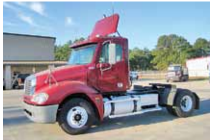
2004 Freightliner CL12042ST Columbia 120, 12.7 Detroit Engine 375 hp; 10 Spd OD; Diesel; Air Ride Suspension; 3.70 Ratio; 22.5LP Tires; All Steel Wheels; 166 in Wheelbase; Single Axle, 533,430 Miles. (4LN05763-SHV-2)