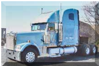
2005 Freightliner FLD13264T Classic XL , 70 in Raised Roof Condo; C15 Caterpillar 450 hp; 13 Spd OD; Engine Brake; Air Ride Susp; 3.55 Ratio; 22.5 LP Tires; Aluminum Wheels; 260" WB, 750,000 Miles. (5DN44654-ABL-1) $26,500 $24,500