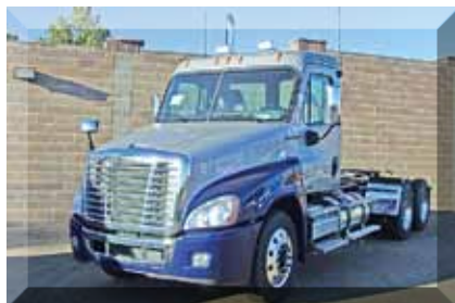
2009 Freightliner Cascadia 125 , Mercedes MBE4000, 10 Spd, Engine Brake, Air Ride Suspension, 220" Wheel Base, 22.4 LP Tires, All Aluminum Wheels, Air Brakes, Pre 2010 Emissions, Save Thousands. (9LAJ4523-TXK-1) $94,000 $89,900