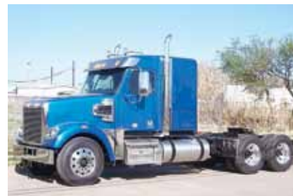
2012 Freightliner CC12264 Coronado SD, Detroit 505 hp; Hard to find small sleeper truck. Stainless steel visor. LED lighting. Dual 100 gallon tanks. All aluminum wheels.; 6x4, New. (CDBE7384-WFF-2)