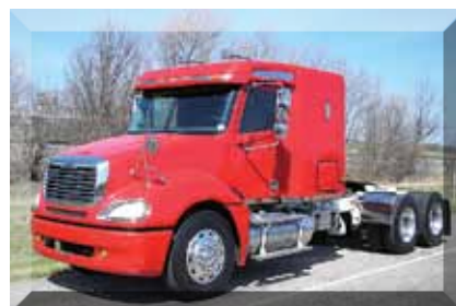
2004 Freightliner CL120 Columbia , 58" Mid Roof Sleeper, Caterpillar C12, 430 HP, 10 Spd, Air Ride Suspension, Engine Brake, 24.5 Tires, All Aluminum Wheels, 626,450 Miles. (4LM99775-BRY-1) $24,965.