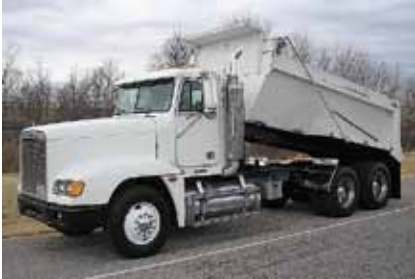
2001 Freightliner FLD12064ST, 12.7 Detroit Engine 470 hp; Diesel; 13 Spd; Engine Brake; Air Ride Suspension; 22.5 Tires; Aluminum/Steel Wheels; 230" WB; Tandem Axle; 15' Demo Dump bed, with full Pintle Hitch. (1PF95463-TEM-2)