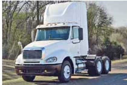
2005 Freightliner CL12064ST Columbia 120, 14.0 Detroit Engine 470 hp; 10 Spd OD; Diesel; Engine Brake; Air Ride Suspension; 3.70 Ratio; 11 R 22.5 Tires; Steel Disc Wheels; 171 in Wheelbase, 606,000 Miles. (5LU94874-BRY-2)