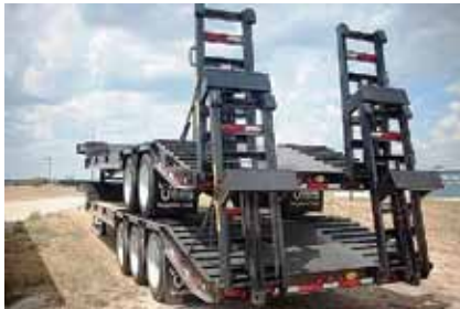
2011 Viking Tandem & Triple Axle, Fixed Neck; Spring Susp; Wood Floor; All Steel Wheels; Fixed Tandem Axle; Steel Composition; Tandem axle 35 Ton, 100,000 Lb Capacity Equip. Trailer, 28'11" Deck Length with 46" Oal, Dove Tail & Ramps. (35 Ton New Viking-SAN-TRL-3)