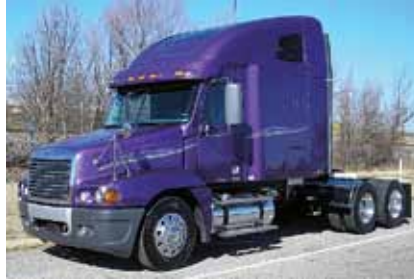
2007 Freightliner CST12064ST Century 120, 70 in Raised Roof Condo; 14.0 Detroit 500 hp; Diesel; 10 Spd OD; Engine Brake; Air Ride; 3.42 Ratio; LP 22.5 Tires; Aluminum Wheels; 230" WB, 514,000 Miles. (7LW48219-TEM-3)