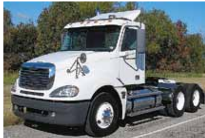
2005 Freightliner CL11264ST Columbia 112, 14.0 Detroit Engine 430 hp; 10 Spd OD; Diesel; Engine Brake; Air Ride Suspension; 3:70 Ratio; 22.5 Tires; All Steel Wheels; 171 in Wheelbase; Tandem Axle. 475,000 Miles. (5LN65255-WAC-3)