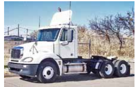
2005 Freightliner Conventional , Detroit DDC 14.0, 455/490 HP, 10 Speed, Engine Brake, Air Ride Suspension, 183" Wheelbase 22.5 Tires, Steel Wheels, 597,751 Miles. (5LU68685-WFF-2)