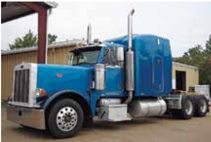
2005 Peterbilt 379EXHD, 63 in Stand Up Sleeper; C15 Caterpillar 475 hp; 13 Spd OD; Eng. Brake; Pete Flex Air Susp; 3.36 R; 22.5LP Tires; Alum. Wheels; 263 in WB; 12,000 lb Front Ax. Wt; 36,000 lb Rear Ax. Wt, 678,321 Miles. 5D837487-TXK-3