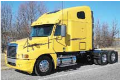
2007 Freightliner CL12064ST Century 120, 70 in Raised Roof Condo; 14 Detroit 500 hp; 10 Spd OD; Engine Brake; Air Ride; 3:42 Ratio; LP 22.5 Tires; All Aluminum Wheels; 230 in Wheelbase; Tandem Axle, 430,500 Miles. (7LW48712-WAC-2)