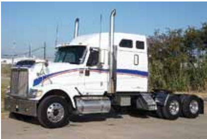
2007 International 9900, Cummins ISX, 435 HP, 13 Spd, Engine Brake, Airride Suspension, 260" Wheel Base, 22.5 Tires, All Aluminum Wheels, Air Brakes, 599,330 Miles. (7C398278-WFF-3)