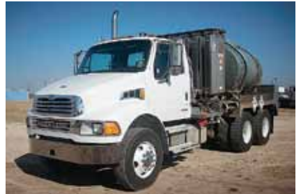
2005 Sterling Acterra 6500, Cat 300HP; Diesel; 9 Spd OD; TuffTrac Susp; 22.5 Tires; Steel Disc Wheels; 190" WB; Semi Tank; 2,500 gal Capacity; 3.90 Ratio; 40,000# Rear Axle Wt; 13,220# Front Axle Wt, 150,000 Miles. (5AU05746-SAN-2)