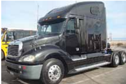
2005 Freightliner CL120 Columbia, Detroit Diesel DDC 14.0, 435 HP, 10 Spd, Engine Brake, Air Ride Suspension, 232" Wheelbase, 22.5 Tires, All Aluminum Wheels, 783,539 Miles. (5LM94716-ABQ-3) $29,900 $26,900