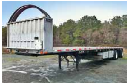
2007 Transcraft Flat Bed, 48' x 102", Air Ride Suspension, Tandem Axle, 11R24.5 Tires, Aluminum Outer Wheels Only. Financing Available W.A.C. (72019688-SHV-TRL-3) $17,500.

See a complete inventory of new and used trucks and trailers online at: www.LonestarTruckGroup.com