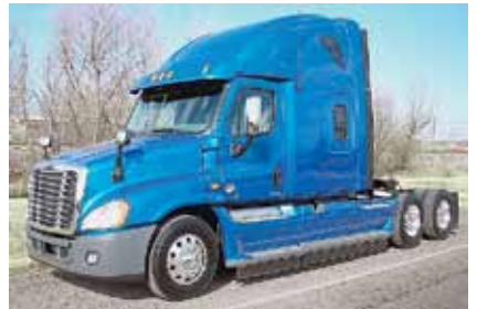
2011 Freightliner CA12564SLP Cascadia, 72 in RR Condo; DD 15 Det 455HP; 500 mi; 10 Spd OD; Eng. Brake; Air Ride; 3.42 Ratio; LP 22.5 Tires; Aluminum Wheels; 232 " WB; 13,300 lb Front Axle Wt; 40,000 lb Rear Axle Wt. New. (BSBD1638-BRY-3)