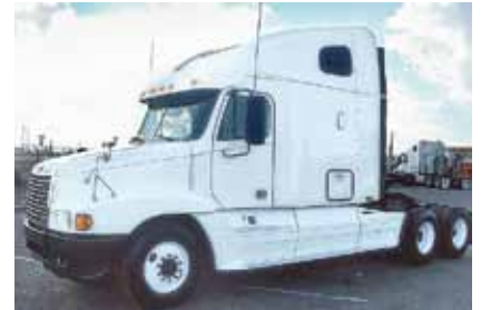
2006 Freightliner CST12064 Century 120, Double Deck Condo; Series 60 Detroit 505 hp; Diesel; 10 Spd OD; Engine Brake; Air Ride; 3.73 Ratio; 22.5 Tires; All Steel Wheels; 232 in WB, 608,034 Miles. (6PV86087-ABQ-2) $36,900-$28,900