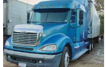
2005 Freightliner Columbia CL120, Mercedes MBE4000, 10 Spd, Exhaust Brake, Air Ride Suspension, 230" Wheelbase, 22.5 Tires, Aluminum Front Wheels, Steel Rear Wheels, 768,650 Miles. (5LU23237-TXK-2)