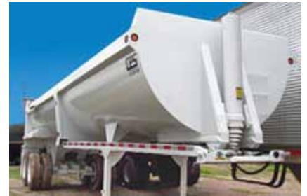
2010 CPS End Dump, Spring Suspension; 32 ft Length; Frame; 11r24.5 Tires; 32" Half Round. Ar450 Material. Single Point Suspension. High Lift Tail Gate. Price includes FET. Financing Available W.A.C. (AP011086-TYL-TRL-3) $33,900