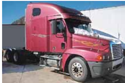
2004 Freightliner CST12064ST Century 120, 70 in Condo; 14.0L Detroit 500 hp; Diesel; 10 Spd OD; Engine Brake; Air Ride; 3.58 Ratio; 22.5LP Tires; All Aluminum Wheels; 230 in Wheelbase; Tandem Axle, 549,534 Miles. (4LM69433-SHV-2)