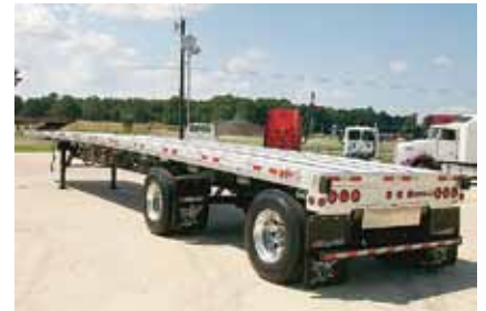
2009 Manac CFB48 Flat Bed, Air Ride; 48'x102"; Aluminum Floor; 24.5LP Tires; Aluminum Outers; Tandem Axle; Comb. Composition; Sprd Axle, Cargo Hands, Chain Ties, Galv. Steel Cross Members. (9K010502-TYL-TRL-3b) $24,200 Incl. FET.