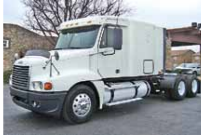
2005 Freightliner CST120 Century Tractor, Detroit DDC 14.0, 455 HP, 70" Midroof, 10 SPD, Air Ride Suspension, Wheelbase 232", 22.5 LP Tires, Aluminum Front Wheels, Steel Rear Wheels, 762,000 Miles. (5LM61824-ABL-3) $28,500