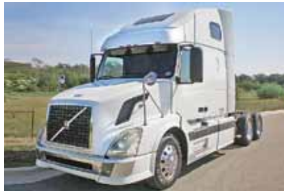
2005 Volvo VNL42T670, Raised Roof Sleeper; ISX Cummins Engine 400 hp; 10 Spd OD; Engine Brake; Air Ride Suspension; 3.36 Ratio; 22.5 Tires; All Aluminum Wheels; 230 in Wheelbase, 625,000 Miles. (5N373820-WAC-3)