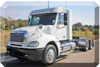
2006 Freightliner CL12064ST Columbia 120, 14.0 Detroit Engine 515 hp; 10 Spd OD; Diesel; Engine Brake; Air Ride Suspension; 3.70 Ratio; LP 22.5 Tires; Aluminum Outside Wheels; 232 in Wheelbase; 496,210 Miles. (6PV48978-WAC-1) $42,500 $39,500