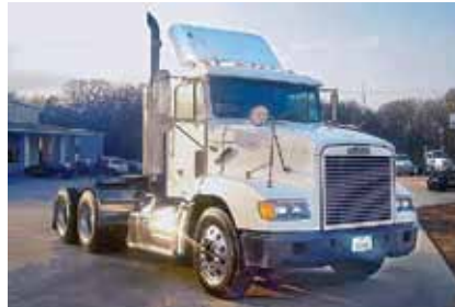
1999 Freightliner FLD12064D, 10 Spd OD; Diesel; Engine Brake; 370 Ratio; 11R 22.5 Tires; 179 in Wheelbase. (XLB839559-BRY-2)