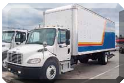
2005 Freightliner M2 106, C7 Cat 210 hp; Auto-OD; Spring Susp; 26 ft Length; Lift End Gate; Roll up Door; 5.29 Ratio; 22.5 Tires; Steel Wheels; 270" WB; 19,000# Rear Axle; 8,000# Front Axle, 104,011 miles. (5HU28997-ABQ-1) $33,900 $29,999