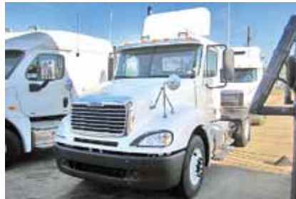
2004 Freightliner Conventional, Detroit DDC 14.0, 455 HP, 10 Spd, Air Ride Suspension, 22.5 LP Tires, Steel Wheels, Single Axle, 687,744 Miles. (4DM86975-SHV-2)