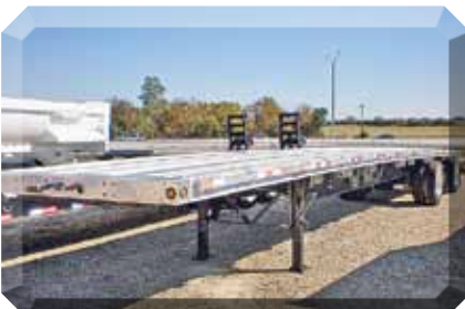
2009 Manac Flat, Air Ride Suspension; 48 ft Length x 102 in Width; 24.5 Tires; Aluminum Wheels; Tandem Axle; Combination Composition; Nice flatbed. (9K010504-TEM-TRL-1) 25,950 $23,435