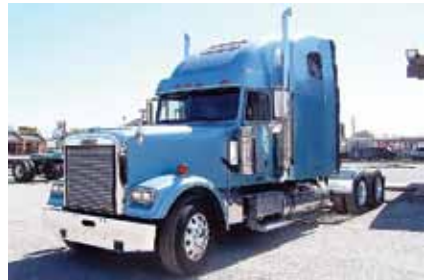
2006 Freightliner FLD13264T Classic XL, 70 in Condo; C15 Caterpillar 475 hp; 13 Spd OD; Engine Brake; Air Ride; 3.55 Ratio; 22.5LP Tires; All Aluminum Wheels; 259 in Wheelbase; Tandem Axle, 465,321 Miles. (6DU26053-SHV-3)

See a complete inventory of new and used trucks and trailers online at: www.LonestarTruckGroup.com