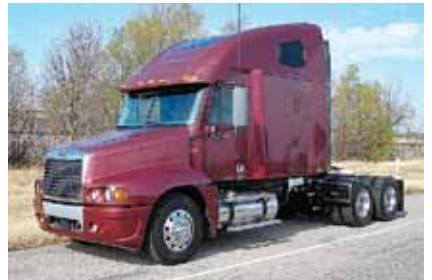
2007 Freightliner CL12064ST Century 120, 70 in Raised Roof Condo; 14 Detroit 500 hp; 10 Spd OD; Engine Brake; Air Ride Susp; 3:42 Ratio; 22.5 Tires; All Aluminum Wheels; 230 in Wheelbase; Tandem Axle, 482,850 Miles. (7LW48121-BRY-3)