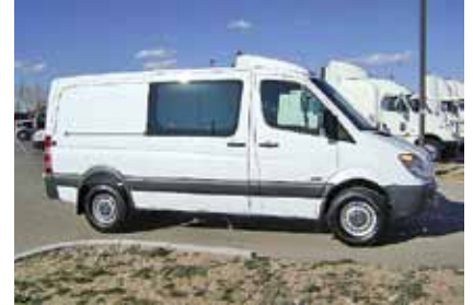
2010 Freightliner Sprinter 2500, Mercedes 3.0L V6 Diesel 188, 5 Speed Automatic Transmission, Spring Suspension, 144" Wheelbase Hydraulic Brakes, 16.0 Tires, Steel Wheels, 5 Year/100K Warranty, Zero Miles. (A5430700-ABQ-2)