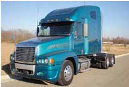
2007 Freightliner CL12064ST Century 120, 70 in Raised Roof Condo; 14 Detroit 500 hp; 10 Spd OD; Engine Brake; Air Ride; 3:42 Ratio; 22.5 Tires; All Aluminum Wheels; 230 in Wheelbase; Tandem Axle, 548,500 Miles. (7VL75445-WAC-2)