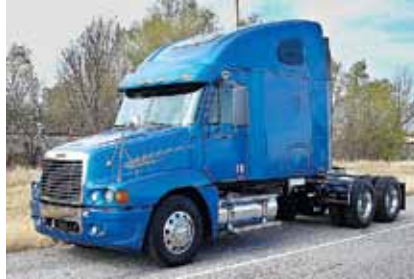
2007 Freightliner C12064ST Century 120, 70 in Raised Roof Condo; 14 Detroit 500 hp; ; 10 Spd OD; Engine Brake; Air Ride; 3:42 Ratio; 22.5 Tires; All Aluminum Wheels; 230 in Wheelbase; Tandem Axle; 590,000 Miles. (7LW41866-TEM-3)