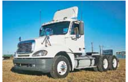
2004 Freightliner CL12064ST Columbia 120, Series 60 Detroit 470 hp; 10 Spd OD; Engine Brake; Air Ride; 3.70 Ratio; 22.5 TALL Tires; All Steel Wheels; 171 in Wheelbase; Tandem Axle; 581,000 Miles. (4LM09963-SAN-2)