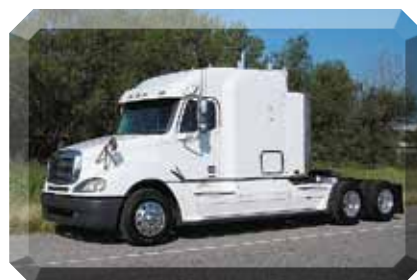
2007 Freightliner CL12042ST Columbia 120, Mid Roof XT Sleeper; DIESEL Detroit Engine 515 hp; Diesel; 10 Spd; Engine Brake; Air Ride Suspension; Aluminum Wheels; Tandem Axle, 476,900 Miles. (7LW29101-BRY-1) $39,500