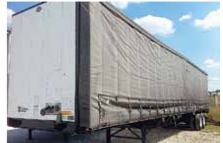
2004 Utility Side Curtain, 48 ft Length x 102 in Width; 24.5 Tires; Steel Disc Wheels; Sliding Tandem Axle; Closed Tandem, AIR SLIDER, Steel Wheels. (4A236301-TYL-TRL-3) $14,900