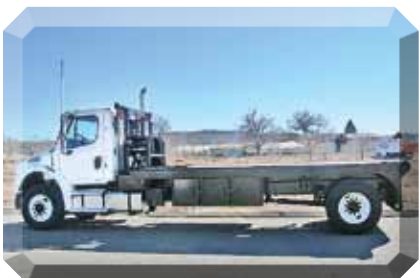
2009 Freightliner M2 106, Cab Chassis, Cummins ISC, 300 HP, 10 Speed, Engine Brake, Spring Susp, 254" WB, Roustabout Bed with Winch, Poles and Tailroller, 22.5 Tires, Steel Wheels, Air Brakes, Zero Miles. (9HAH8898-FAR-1) $107,500 $99,900