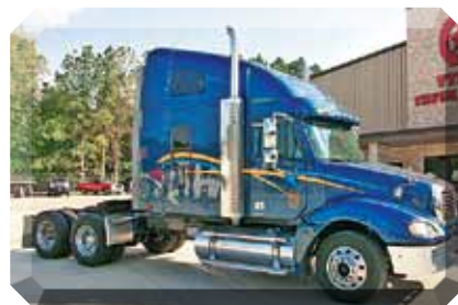
2004 Columbia CL120, Detroit DDC14.0, Exhaust Brake, Air Ride Suspension, 230" Wheelbase, 22.5 LP Tires, All Aluminum Wheels. (4LM99484-SHV-1) $24,500 $23,000