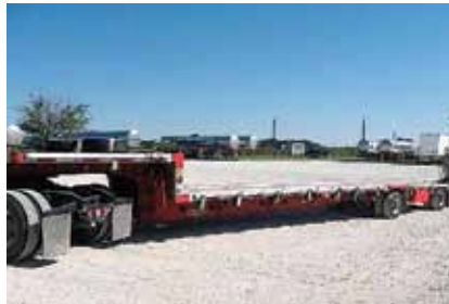
2001 Fontaine Drop Deck, Air Ride Suspension; 48 ft Length x 102 in Width; Aluminum Floor; 17.5 Tires; Combination Composition; Combo Drop Deck. Sliding winches and Tool box. Low deck height. (31071148-TYL-TRL-2) $15,500