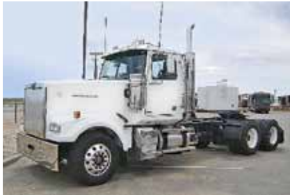
2011 Western Star 4900 EX, DD15 Detroit 505 hp; 10 Spd OD; Diesel; Engine Brake; Air Ride; 3.58; 22.5 LP Tires; Aluminum/Steel Wheels; 230 in Wheelbase; 12,000 lb Front Axle Weight; 40,000 lb Rear Axle Weight. New. (BPAW8761-ABQ-3)