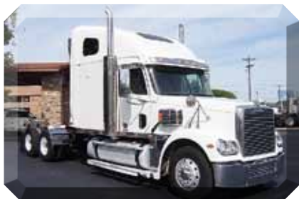
2006 Freightliner CC13264 Coronado, 70" Raised Roof Sleeper; DDC 14.0 Detroit Engine 500 hp; 10 Spd OD; Engine Brake; Air Ride; 3.58 Ratio; 22.5 LP Tires; Aluminum Wheels; 260 in Wheelbase, 721,816 miles. (6PV72525-ABL-1) $37,500