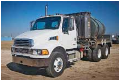
2005 Sterling Acterra 6500 Chemical Truck, Diesel CAT 300 hp; ; 9 Spd OD; Tuff Trac Susp; 22.5 Tires; Steel Disc Wheels; 190" WB; Semi Tank; 2,500 gal Capacity; Combination Composition; 3.90 R; 40,000 lb Rear Axle Wt; 13,220 lb Front Axle Wt, 150,000 Miles. (5AU05746-SAN-3)