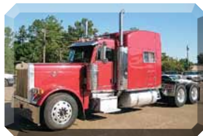
2005 Peterbilt 379EXHD, 70 in Ultra Sleeper; C15 Caterpillar 475 hp; Diesel; 18 Spd OD; Engine Brake; Pete Flex Air Susp; 24.5 Tires; Aluminum Wheels; 270 in WB, 843,212 Miles. (5N855059-TYL-1) $42,500 $41,000