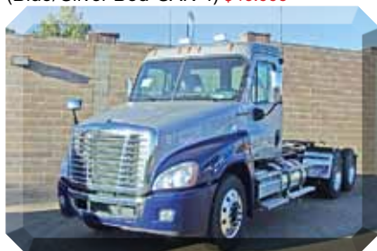
2009 Freightliner Cascadia 125, Mercedes MBE4000, 10 Spd, Engine Brake, Air Ride Suspension, 220" Wheel Base, 22.4 LP Tires, All Aluminum Wheels, Air Brakes, Pre 2010 Emissions, Save Thousands. (9LAJ4523-TXK-1) $94,000 $89,900