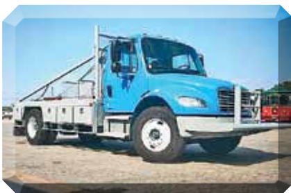
2004 Freightliner Business Class M2 106 Winch Truck, Diesel Caterpillar Engine 190 hp; 6 Spd; Spring Susp; 4.11 Ratio; 22.5 Tires; Steel Disc Wheels; Single Axle; 15 ft Length; 17,500 lb Rear Axle Weight; 8,000 lb Front Axle Weight; 133,000 Miles. (Blue/Silver Bed-SAN-1) $46,995