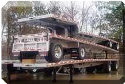
2011 Reitnauer Flat, (Qty: 2) Air Ride Suspension; 48 ft Length x 102 in Width; Aluminum Floor; 24.5 Tires; Aluminum Wheels; Tandem Axle; Aluminum Composition. (TYL-TYL-TRL-1A) $34,472