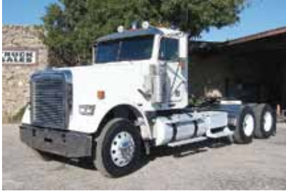
2006 Freightliner FLD12064m MBE4000 Mercedes Engine 450 hp; 10 Spd OD; Engine Brake; Air Ride Suspension; 3.73 Ratio; 22.5 Tires; Aluminum/Steel Wheels; 206 in Wheelbase; 462,795 miles. (6DW93203-ABL-2) $41,900