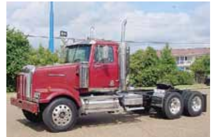
2006 Western Star 4900FA, MBE 4000 Mercedes Eng 460 hp; 10 Spd OD; Diesel; Engine Brake; TufTrac Suspension; 3.90 Ratio; 11R 24.5 Tires; Aluminum Outside Wheels; 220 in Wheelbase; Tandem Axle, 298,324 Miles. (6PU63039-TYL-3)