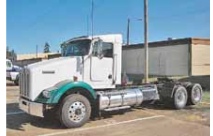
2005 Kenworth T800, C15 Caterpillar Engine 435 hp; 10 Spd OD; Diesel; Engine Brake; Air Ride Suspension; 3.36 Ratio; 22.5LP Tires; All Aluminum Wheels; 228 in Wheelbase; Tandem Axle; 552,754 Miles. (5F096181-TXK-2)