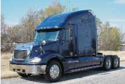
2005 Freightliner CL12064ST Columbia 120, 70 in Raised Roof Condo; 14 Detroit Engine 470 hp; 13 Spd OD; Engine Brake; Air Ride Suspension; 3:73 Ratio; 24.5 LP Tires; All Aluminum Wheels; 240 in WB, 690,000 Miles. (5LU85755-TEM-2)